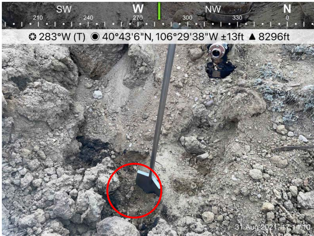
Photo 1: SS01, collected adjacent to Margaret Spaulding (OWP) #5 former wellhead, 8/31/2021.