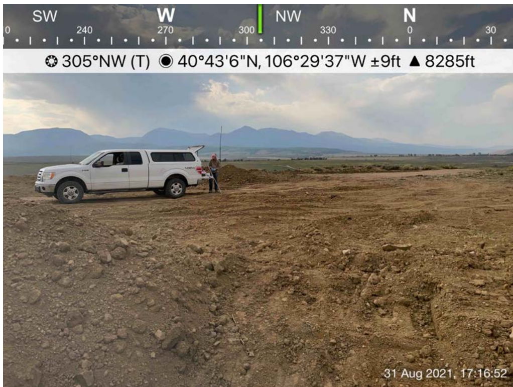
Photo 4: Margaret Spaulding (OWP) #5 well site location, 8/31/2021.