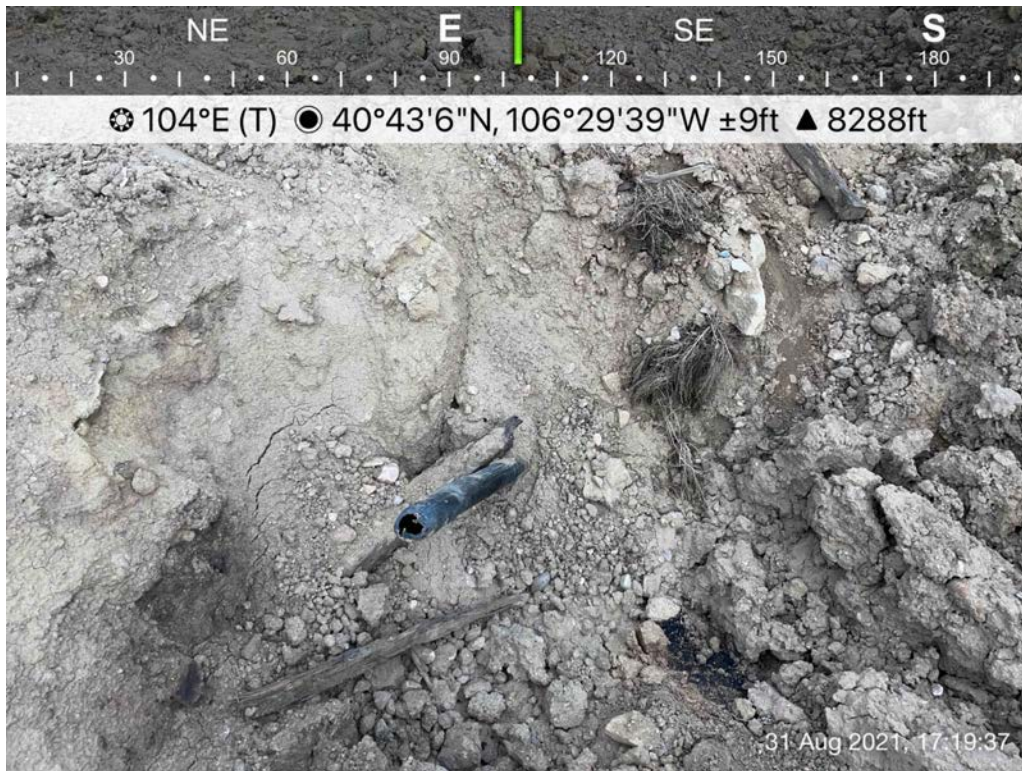
Photo 5: Flowline removal, Margaret Spaulding (OWP) #5, 8/31/2021.