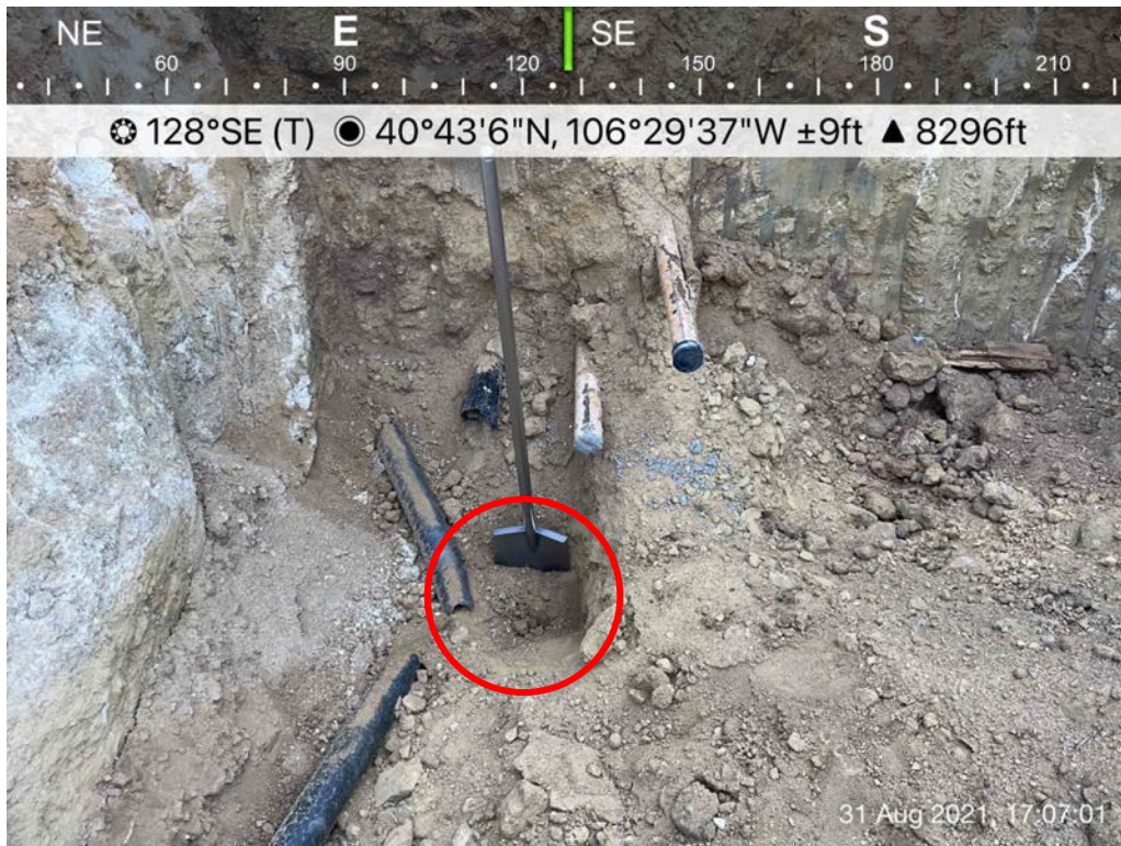
Photo 3: SS03, collected from base of flowline excavation, Margaret Spaulding (OWP) #5, 8/31/2021.