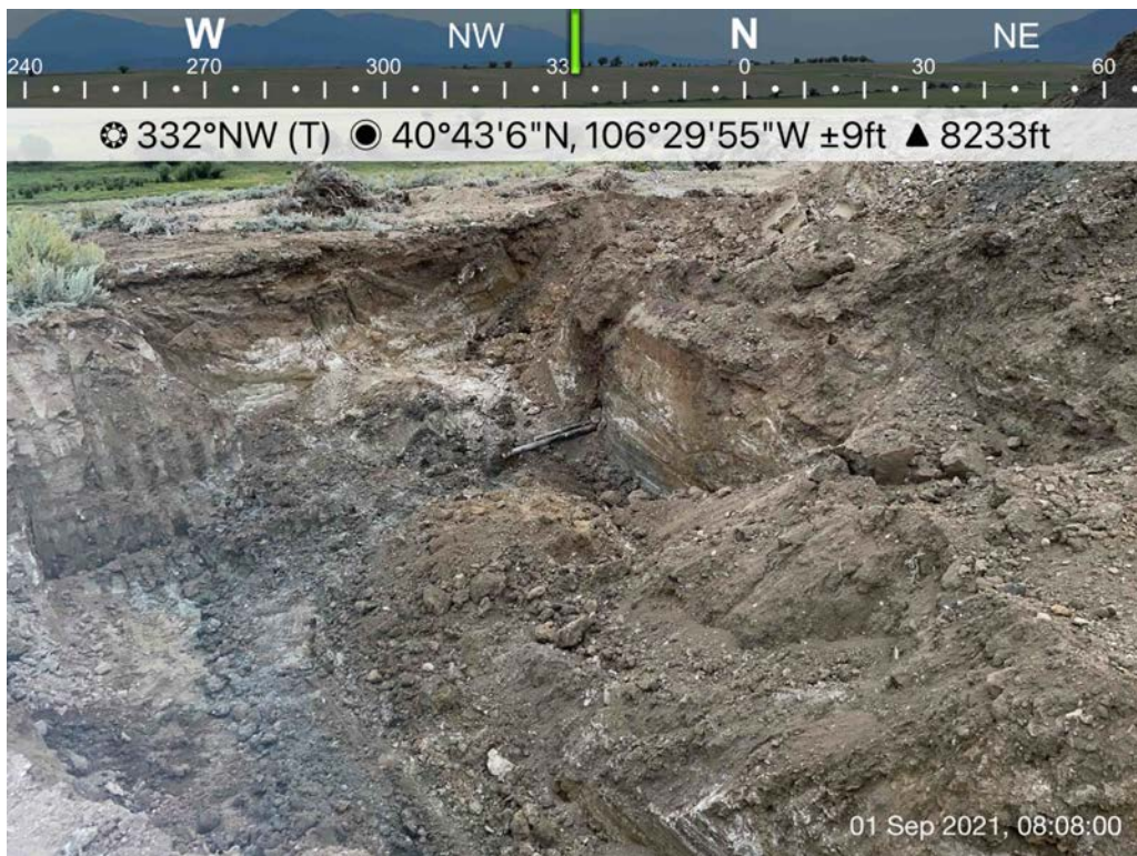
Photo 4: Flowline removal, Margaret Spaulding (OWP) #4-B, 9/1/2021