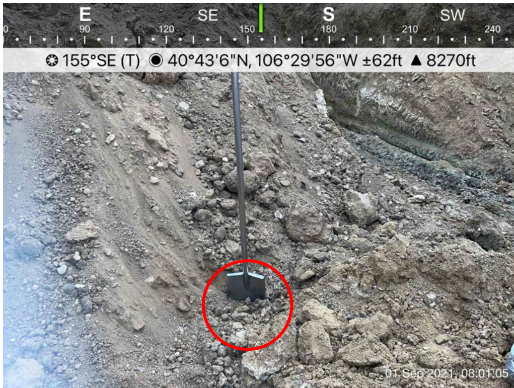
Photo 1: SS01, collected adjacent to Margaret Spaulding (OWP) #4-B former wellhead, 9/1/2021.