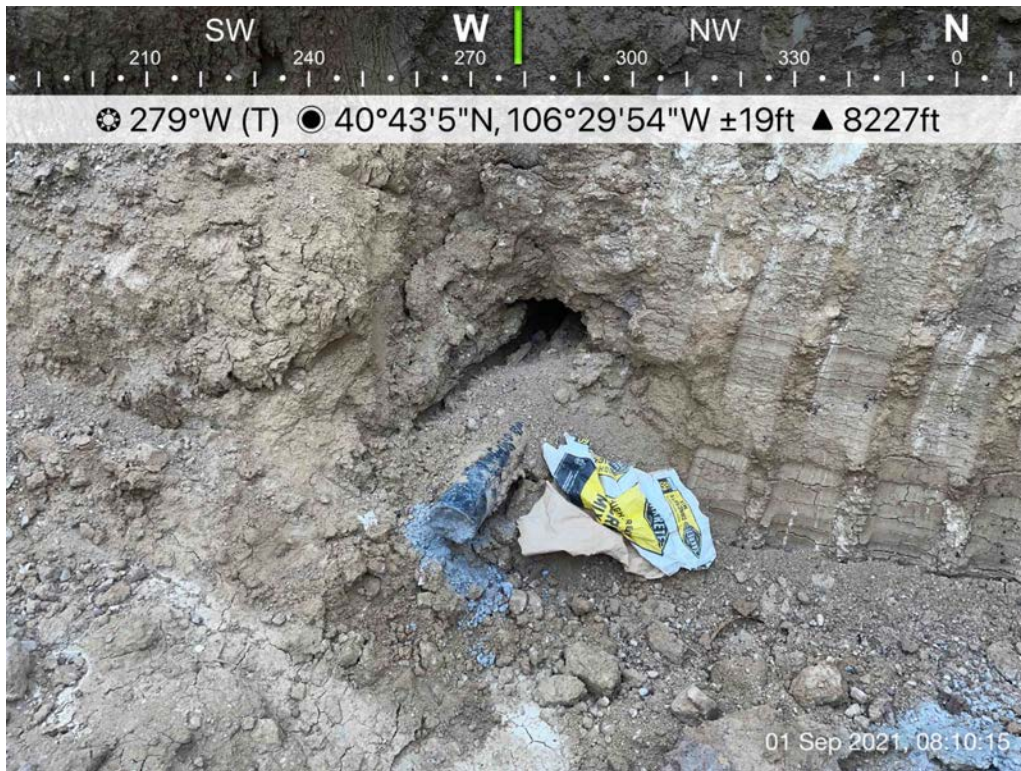
Photo 5: Flowline removal, Margaret Spaulding (OWP) #4-B, 9/1/2021.