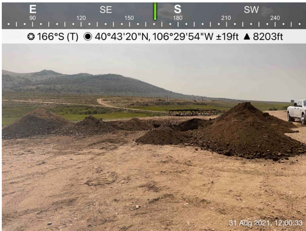
Photo 4: Margaret Spaulding (OWP) #3 well site location, 8/31/2021.