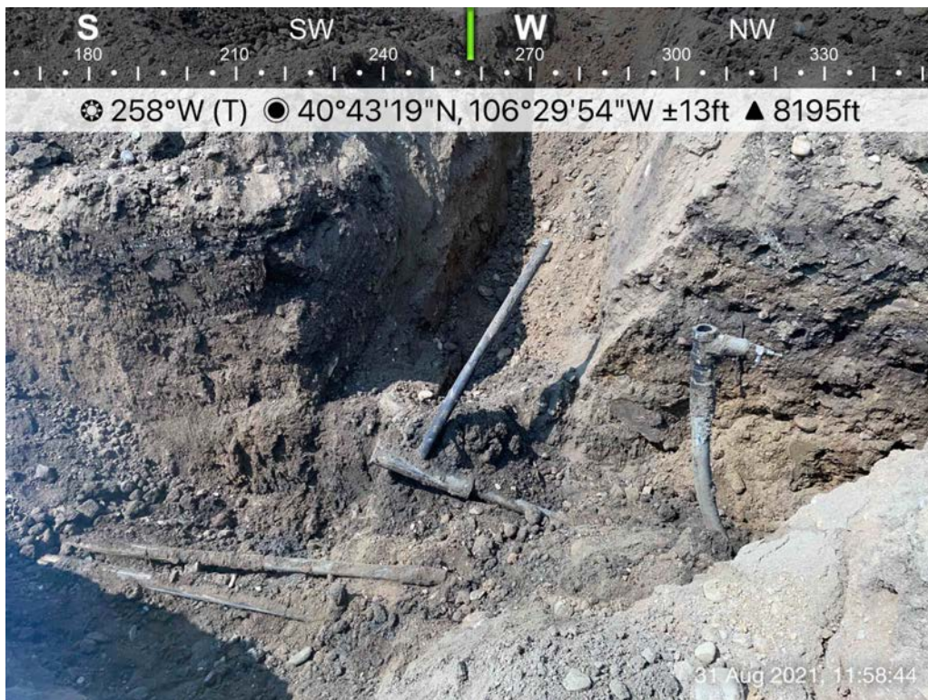
Photo 6: Flowline removal, Margaret Spaulding (OWP) #3, 8/31/2021.