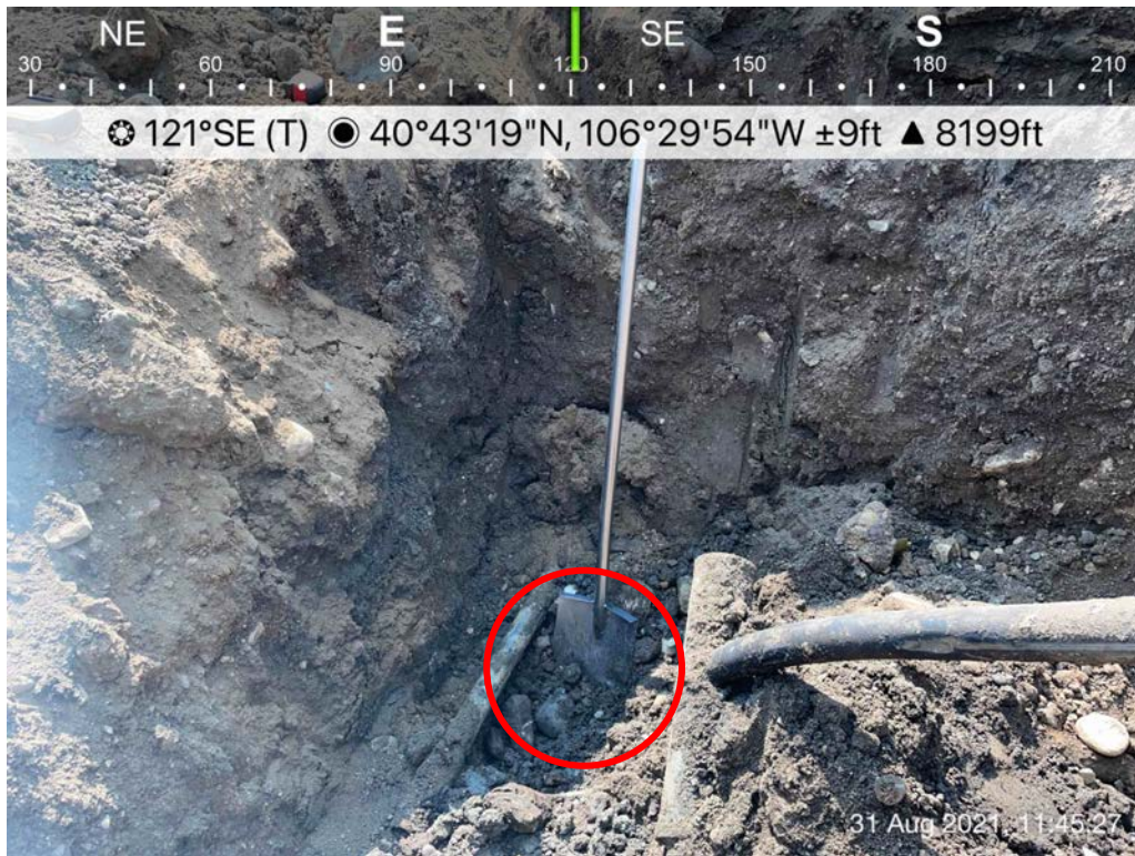
Photo 3: SS03, collected from base of flowline excavation, Margaret Spaulding (OWP) #3, 8/31/2021.