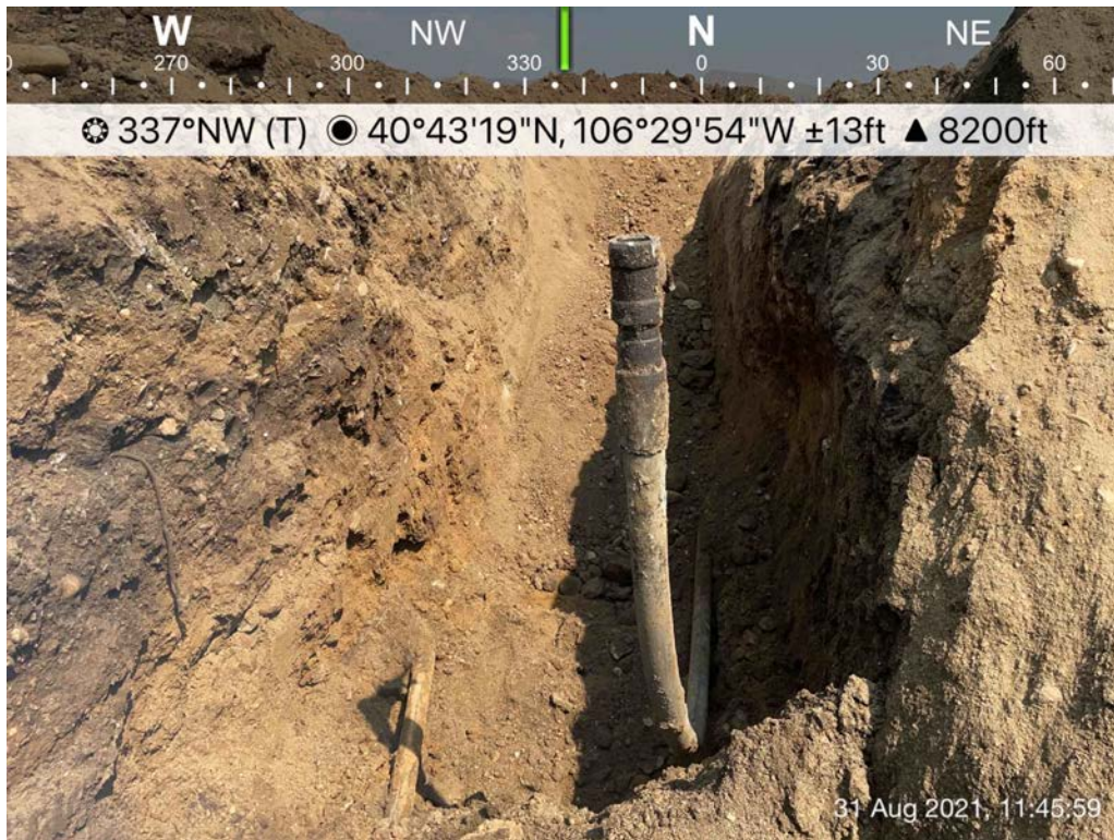
Photo 5: Flowline removal, Margaret Spaulding (OWP) #3, 8/31/2021.