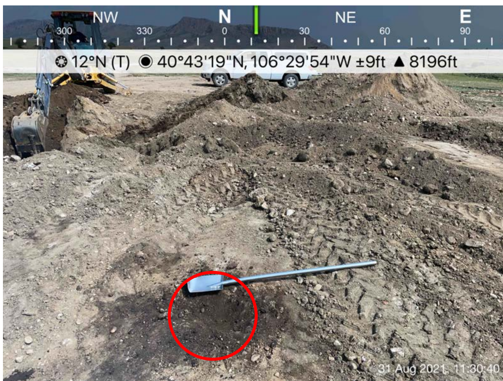
Photo 2: SS02, collected from below former pumping unit, Margaret Spaulding (OWP) #3, 8/31/2021.