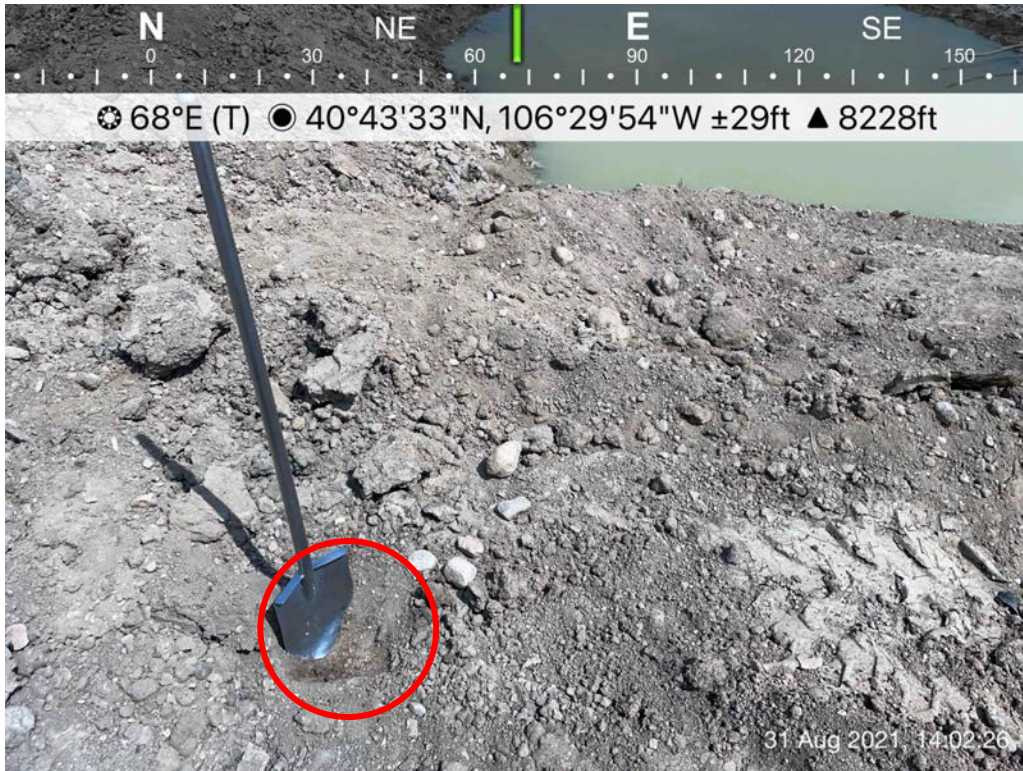
Photo 1: SS01, collected adjacent to Margaret Spaulding (OWP) #2 former wellhead, 8/31/2021.