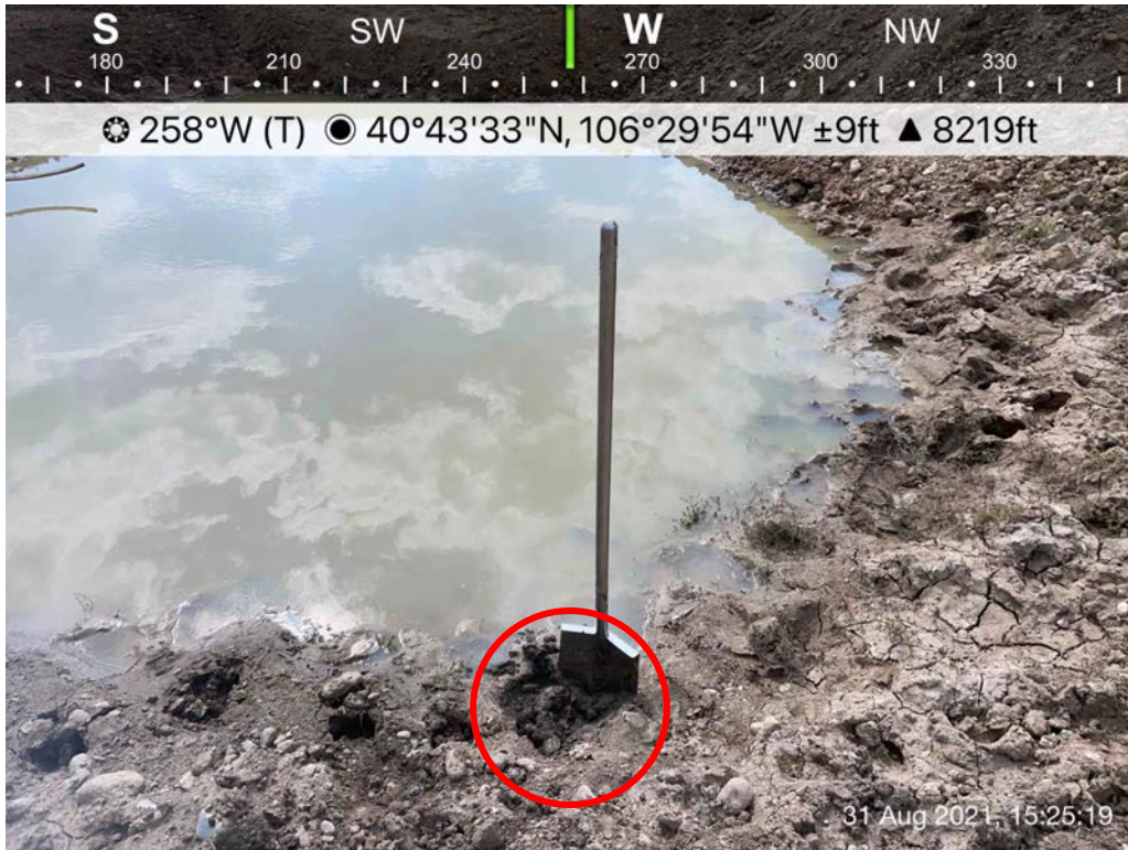
Photo 3: SS03, collected from the vicinity of previous Soil Boring 1 location per the COAs in the Initial Form 27, 8/31/2021.