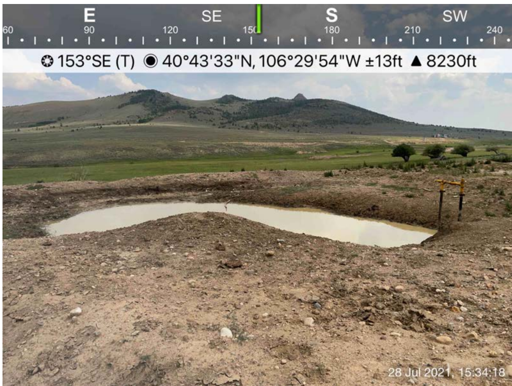
Photo 4: Margaret Spaulding (OWP) #2 well site location, 8/31/2021.