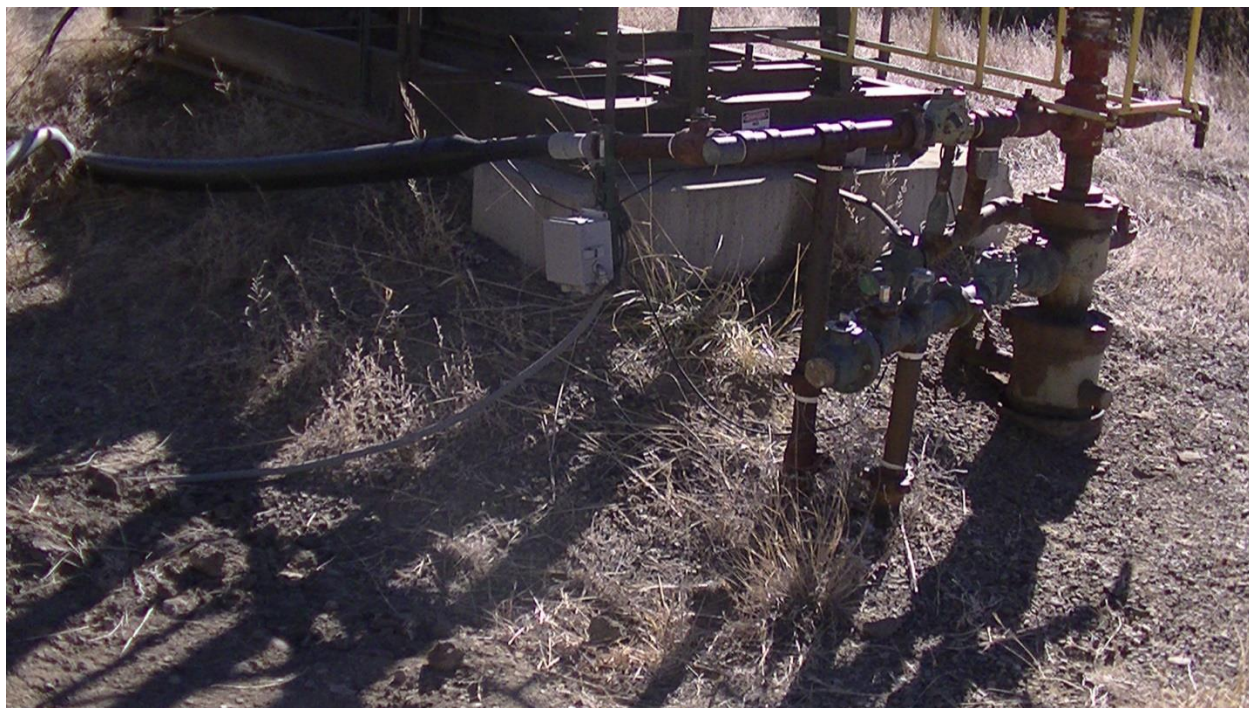
Removed extra hoses to comply with housekeeping