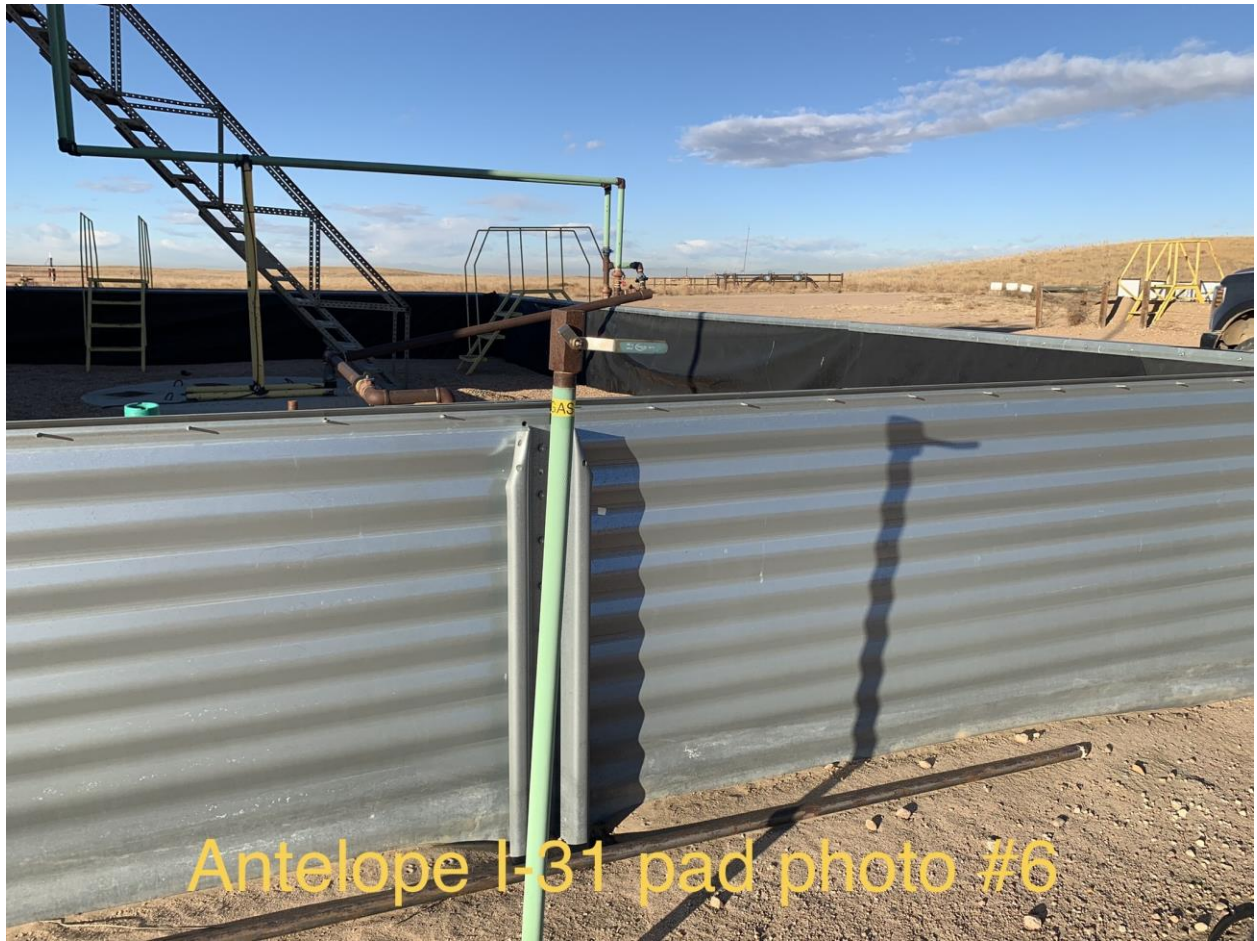
Antelope I-31 pad photo #6