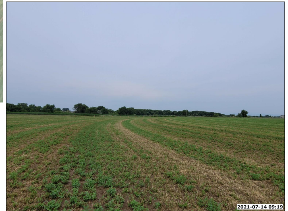
LOCATION PICTURE OF PAUL NELSON 25-29HZ WELL PAD - CAMERA VIEW WEST

K:\AMARCO\2020\2020_10_PAUL_NELSON_TSN_057M_SEC_29\DWG\PAUL_NELSON.dwg, 11/16/2021, 3:42:50 PM, steven