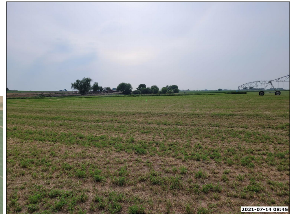
LOCATION PICTURE OF PAUL NELSON 25-29HZ FACILITY PAD - CAMERA VIEW EAST