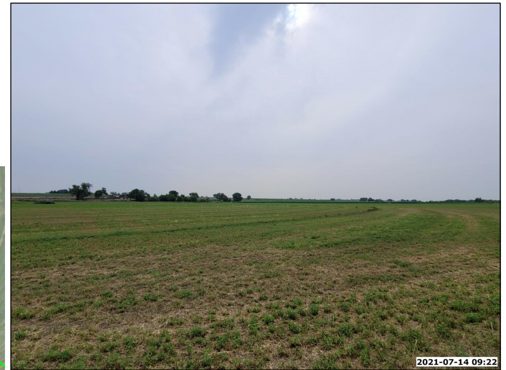
LOCATION PICTURE OF PAUL NELSON 25-29HZ WELL PAD - CAMERA VIEW EAST