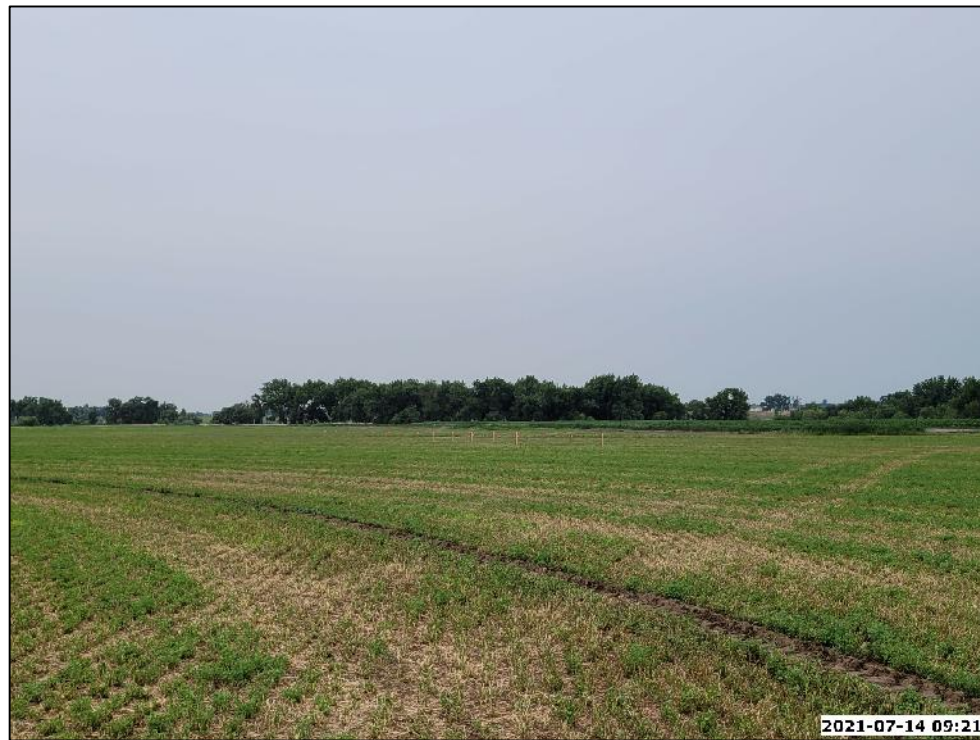
LOCATION PICTURE OF PAUL NELSON 25-29HZ WELL PAD - CAMERA VIEW SOUTH