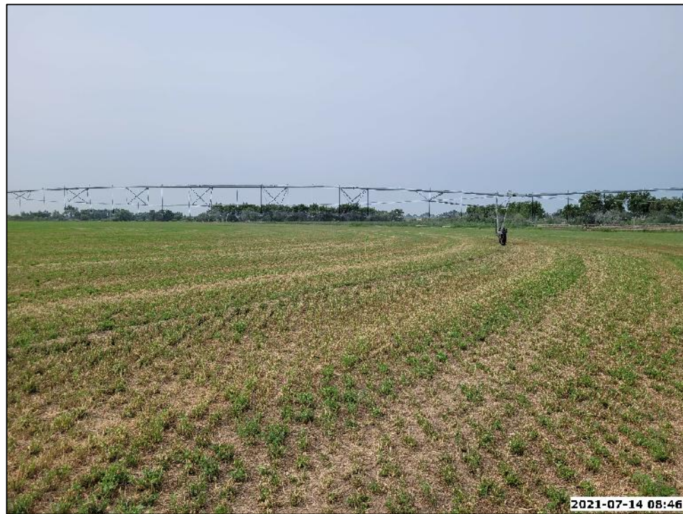
LOCATION PICTURE OF PAUL NELSON 25-29HZ FACILITY PAD - CAMERA VIEW SOUTH