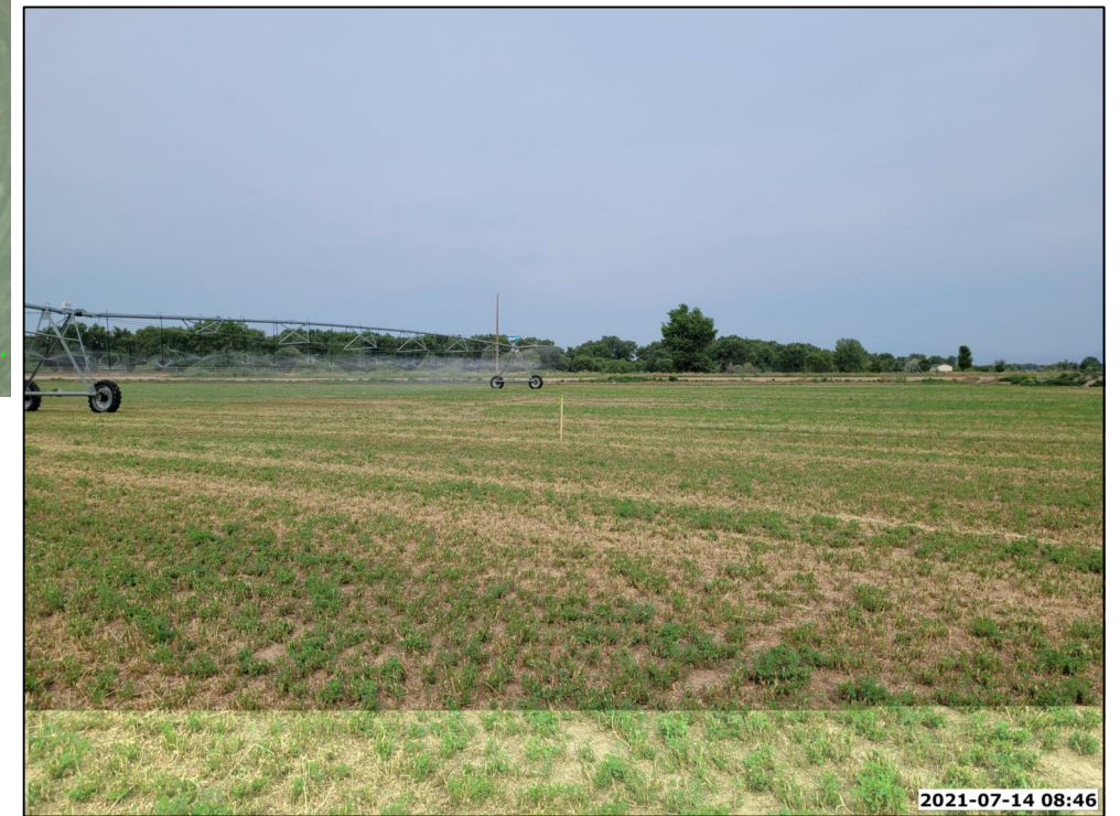
LOCATION PICTURE OF PAUL NELSON 25-29HZ FACILITY PAD - CAMERA VIEW WEST

K:\AMARCO\2020\2020_10_PAUL_NELSON_TSN_057M_SEC_29\DWG\PAUL_NELSON.dwg, 11/16/2021, 3:43:59 PM, steven