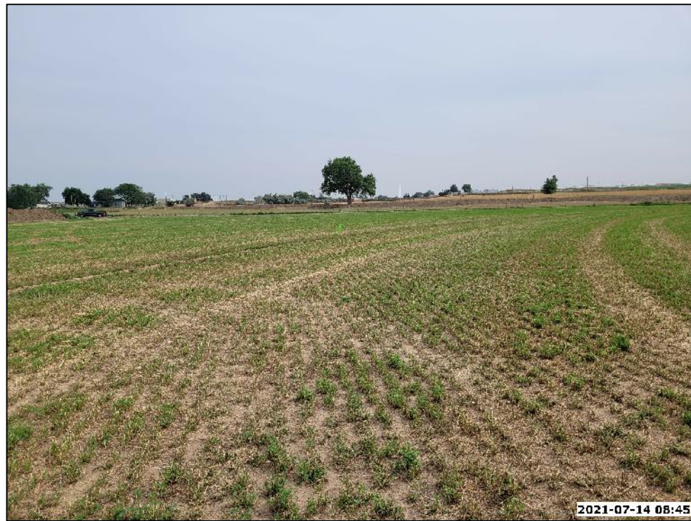
LOCATION PICTURE OF PAUL NELSON 25-29HZ FACILITY PAD - CAMERA VIEW NORTH