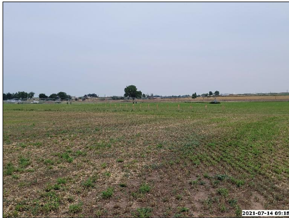
LOCATION PICTURE OF PAUL NELSON 25-29HZ WELL PAD - CAMERA VIEW NORTH

SECTION 29, TOWNSHIP 5 NORTH, RANGE 67 WEST, 6TH P.M., WELD COUNTY, COLORADO