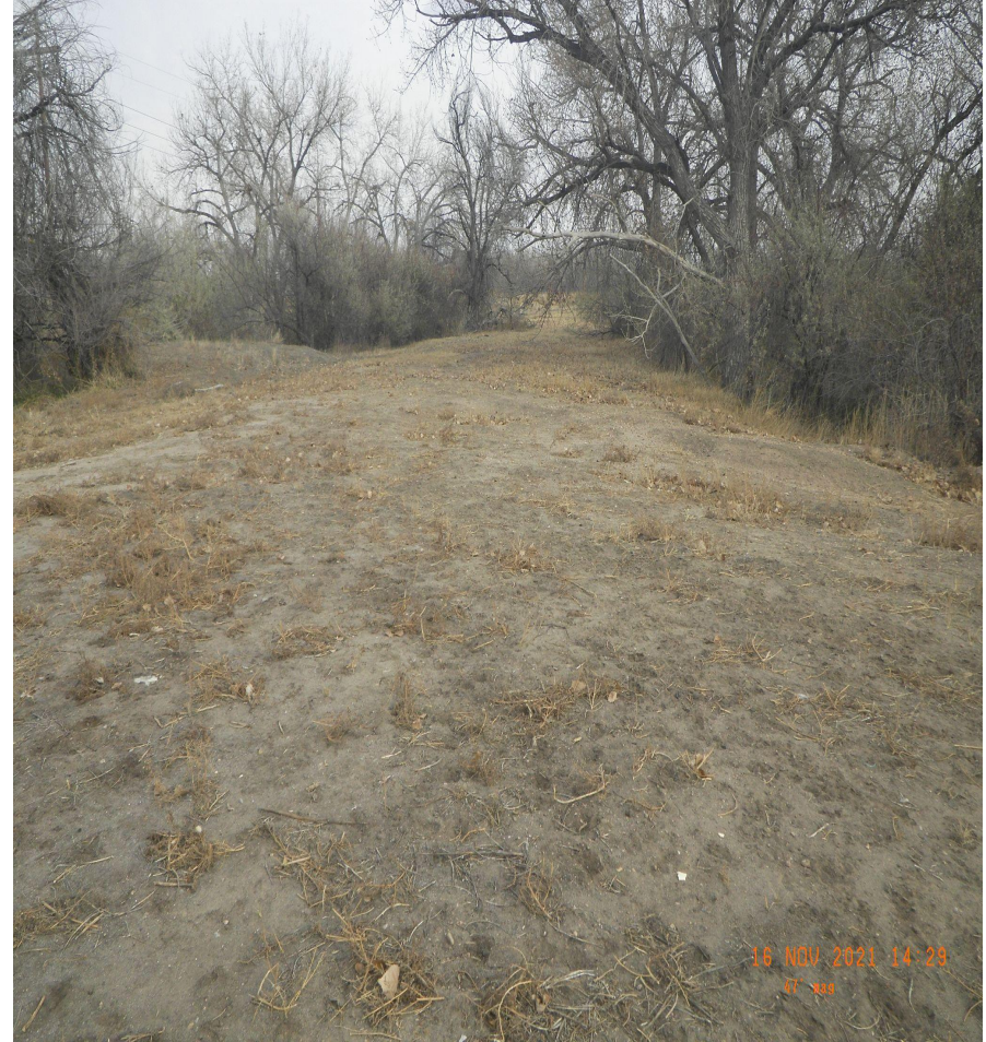
Photo 4. Photos taken from the middle of the tank battery. Left photo facing north and right photo facing east. See photo descriptions under photo 5.