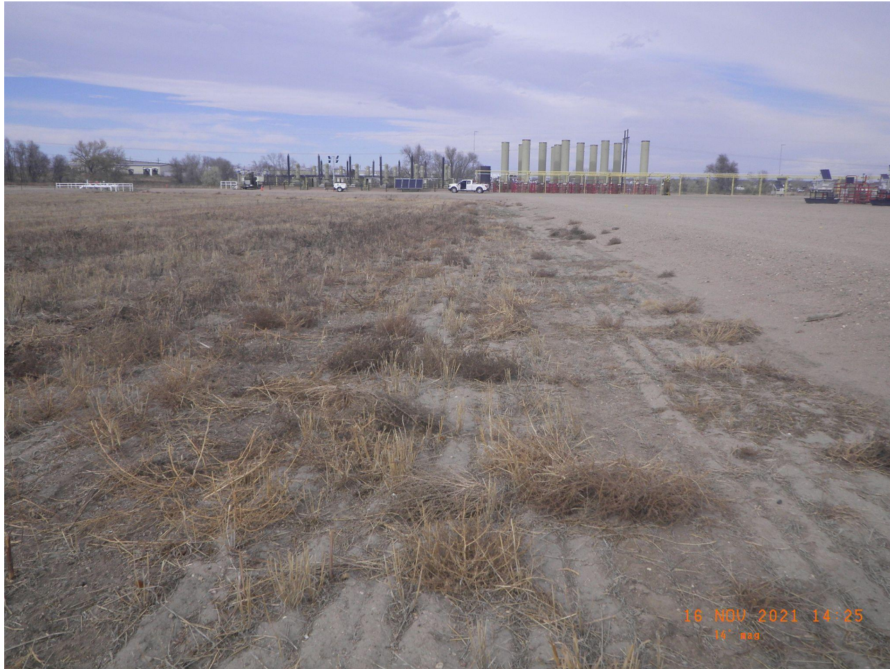
Photo 2. Overview photo of the reclaimed well pad taken at ground level from the southern edge looking north. Note: well pad vegetation could not be identified but appeared to be some sort of agricultural crop.