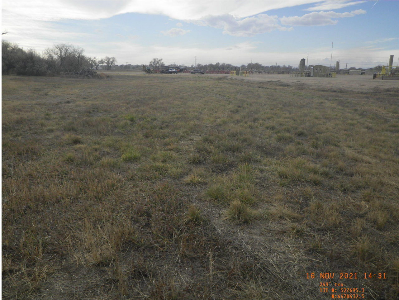
Photo 6. Reference area to the south of the tank battery.