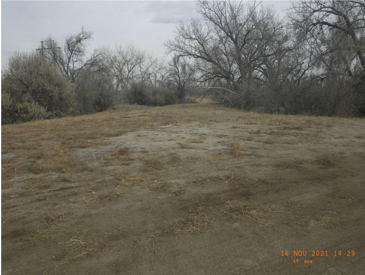
Photo 3. Overview photo of the reclaimed tank battery taken at ground level from the southern edge looking north.