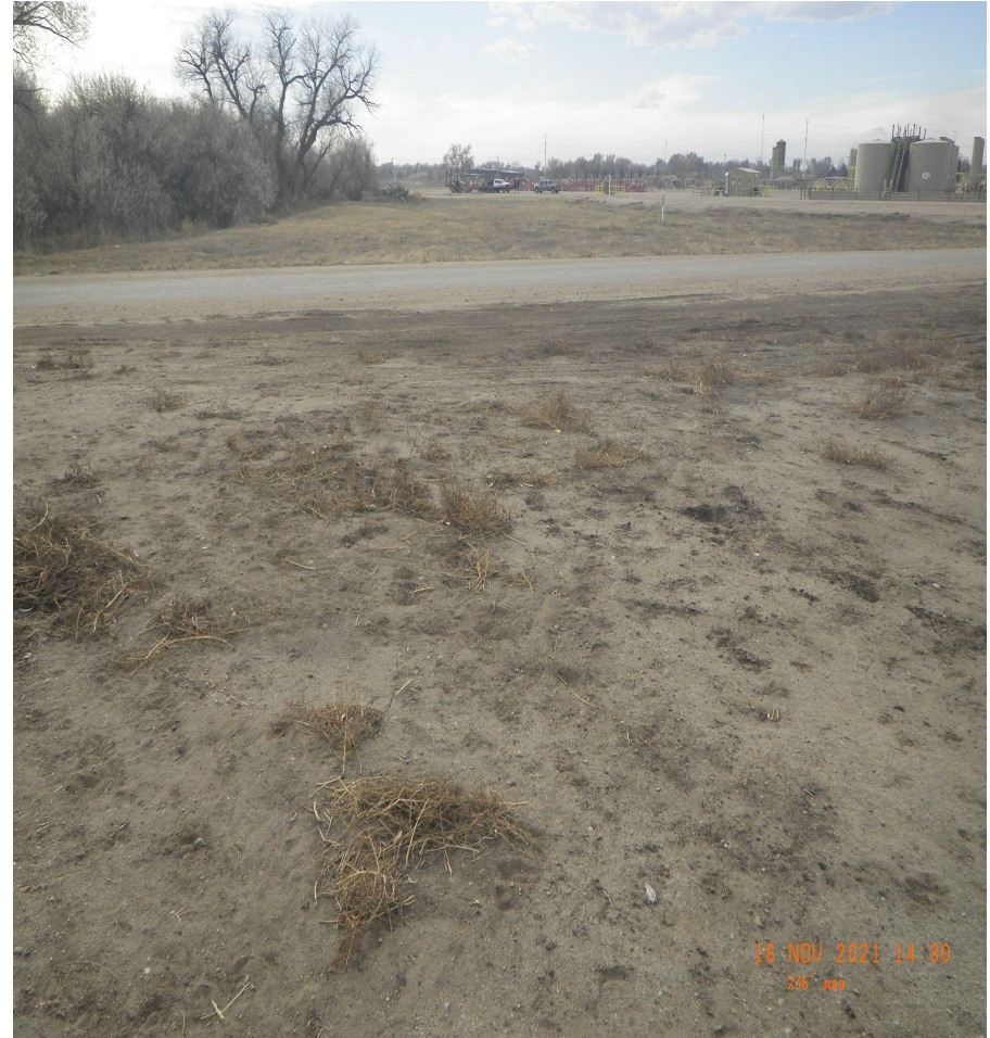
Photo 5. Photos taken from the middle of the tank battery. Left photo facing south and right photo facing west. The photos show that the tank battery shows minimal vegetation/desirable species compared to the reference area, see photo 6.