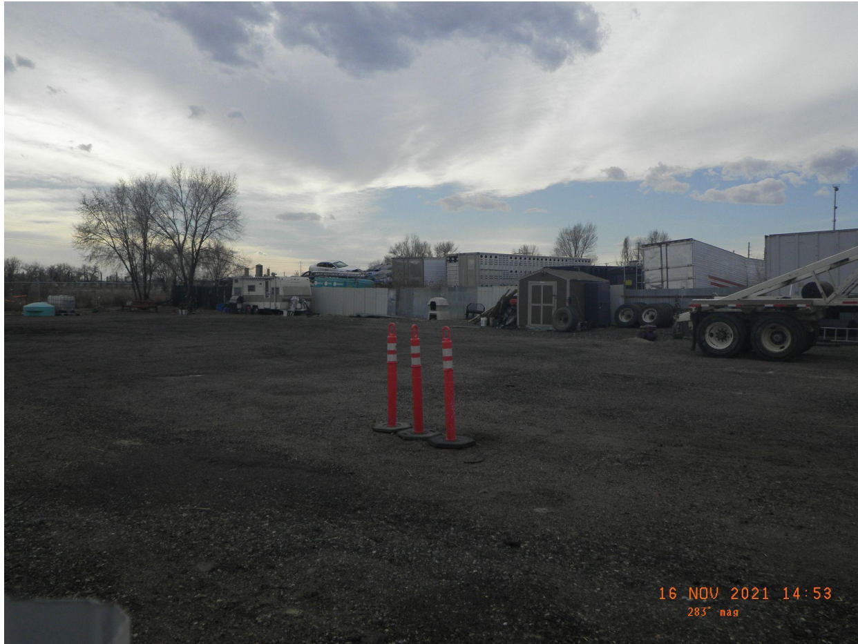
Photo 2. Overview photo of the reclaimed well pad taken at ground level from the eastern edge looking west. Note: well pad now resides in an industrial storage area.