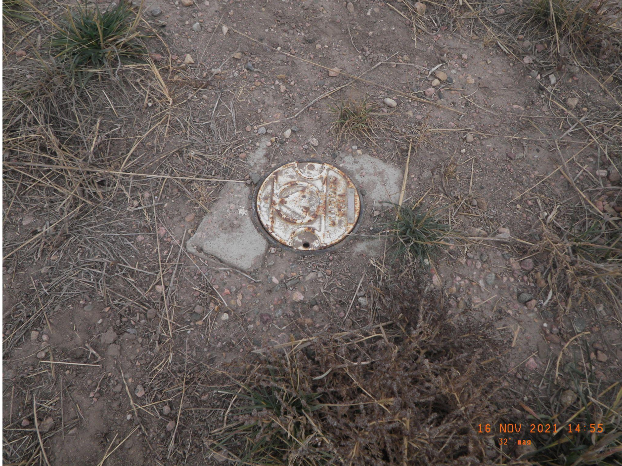
Photo 4. Monitoring wells remain on site for the open remediation, doc # 401568468.