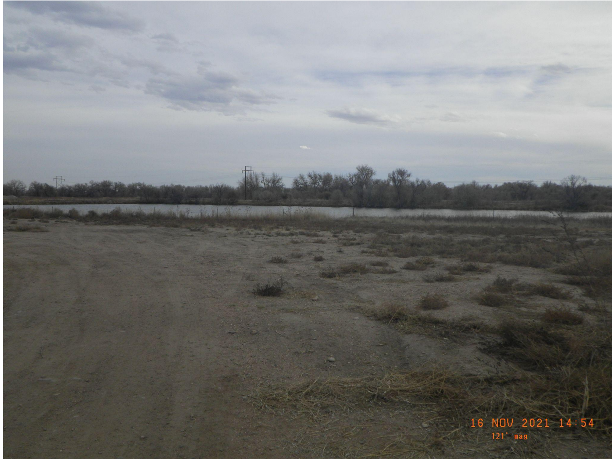
Photo 3. Overview photo of the tank battery taken at ground level from the northern edge looking south. Note: weedy annual vegetation dominates tank battery and gravel remains on site.