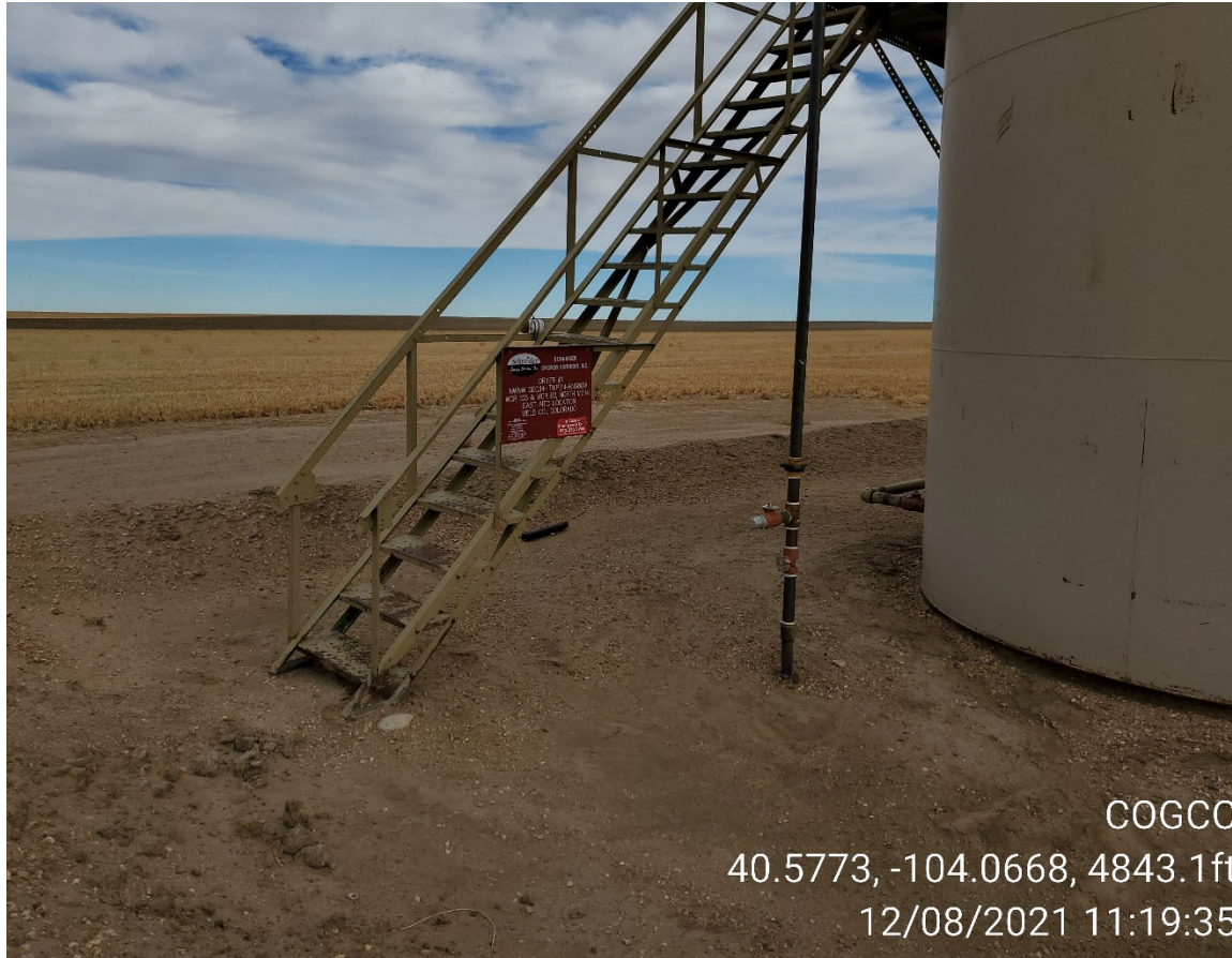
Photo 1 Tank Battery Sign