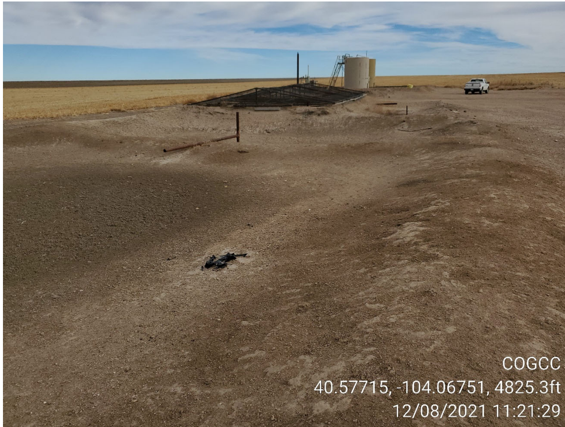
Photo 8 At southwest corner of Pit 4 looking east at pit complex