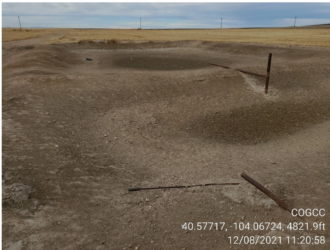
Photo 6 Pits 3 & 4 looking west