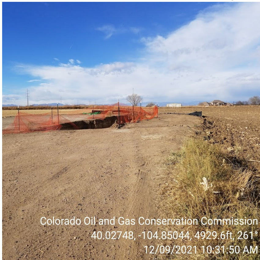
Photo 1 – Site overview, silt fence damaged by wind, fencing down.