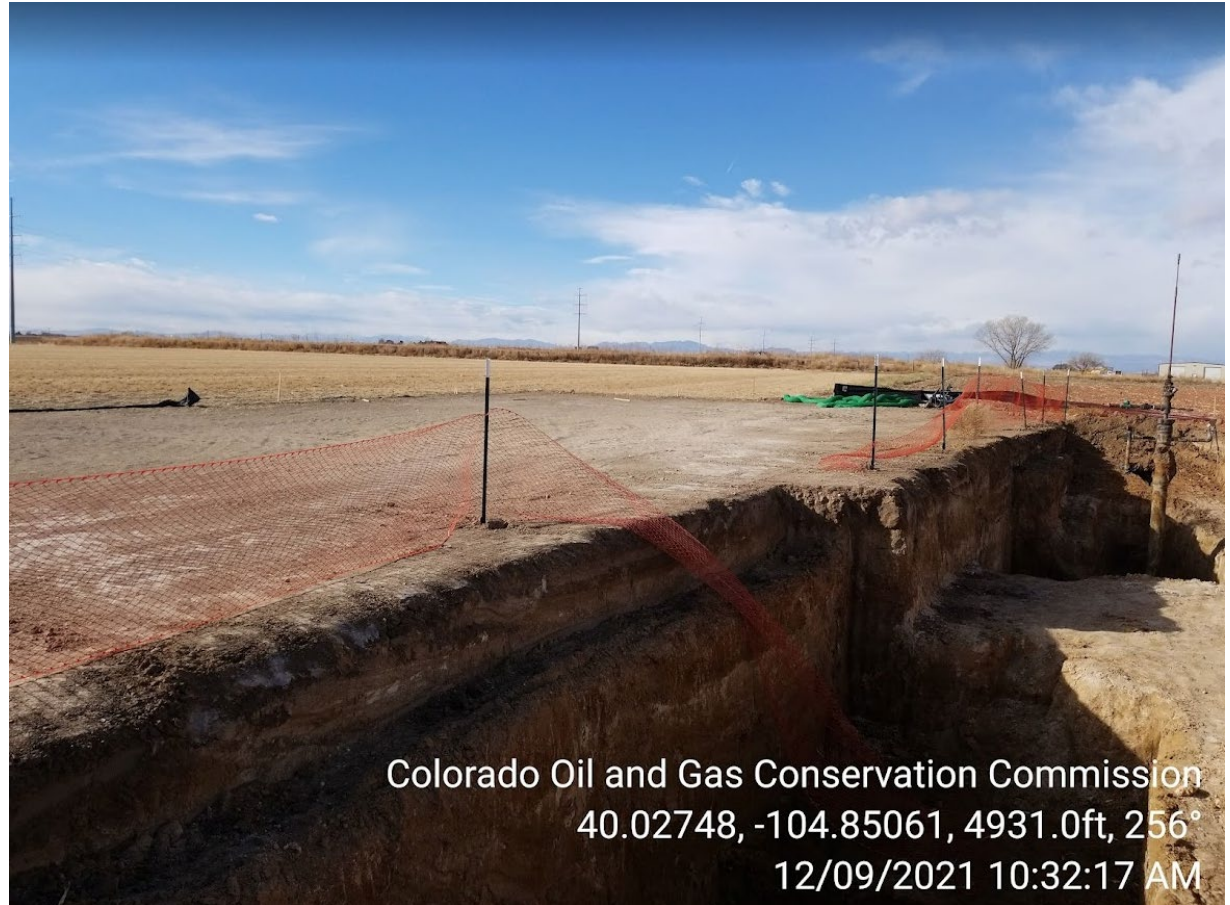
Photo 5 – Foreground: Fencing down around excavation, Background: Silt fence damaged by wind.