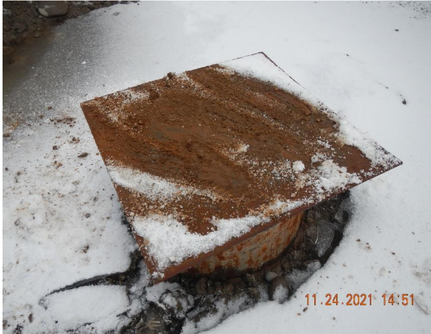
Identifying information is not present on steel plate.