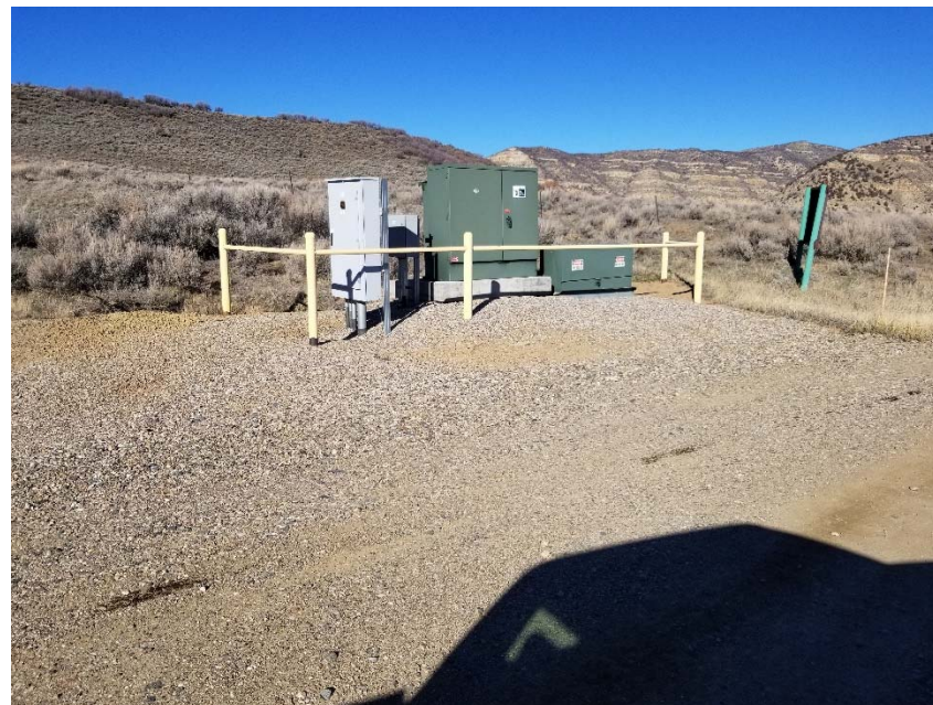
Photo 4. Stained soil on location.