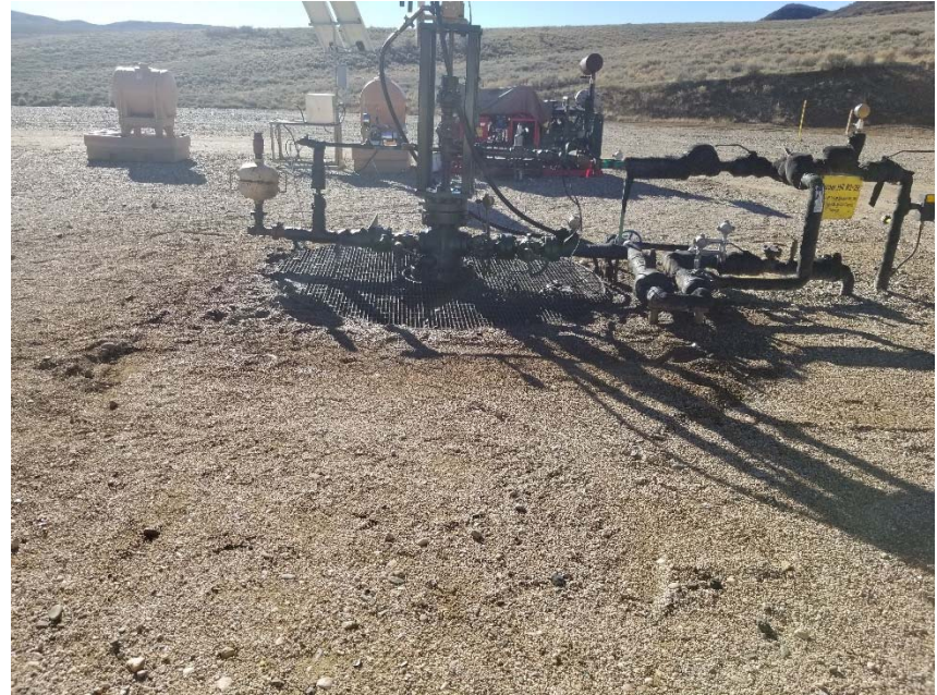
Photo 2. Stained soil around wellhead.