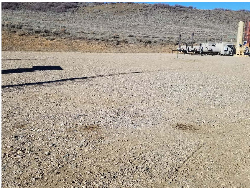
Photo 3. Stained soil on location.