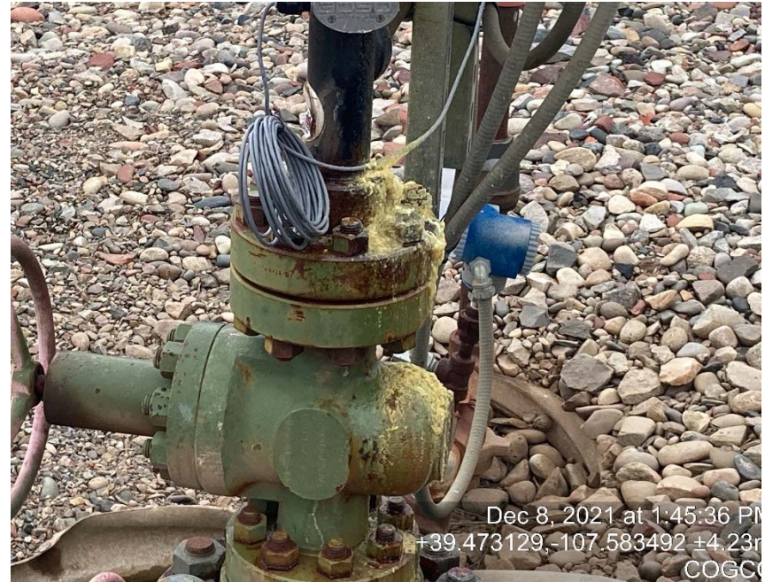
Leaking well head