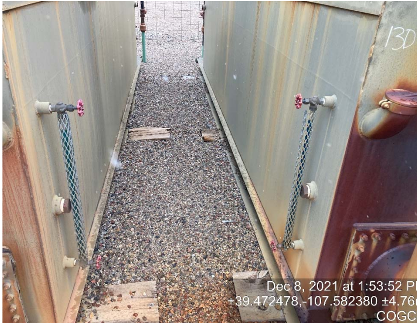
Unmarked vessels show level of fluid in sight glass