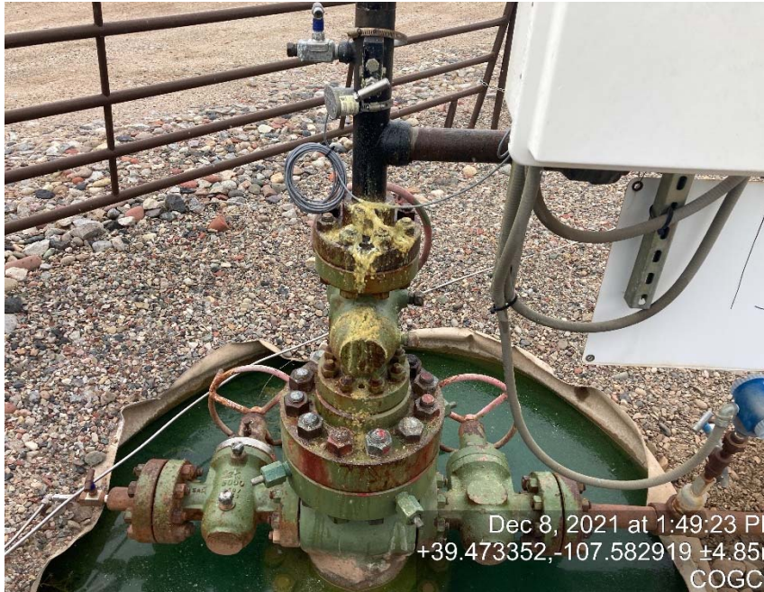
Leaking well head