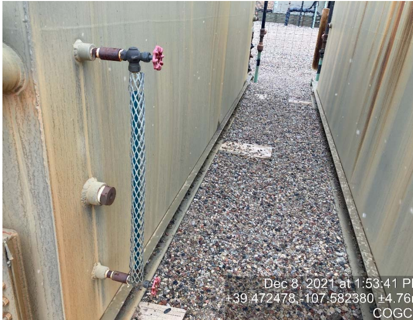
Unmarked vessels show level of fluid in sight glass