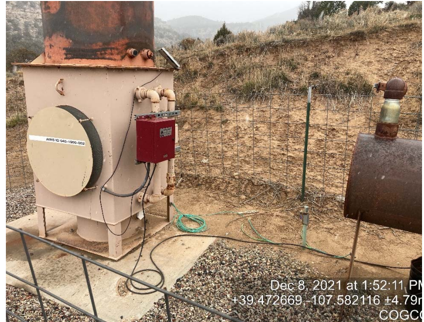
ECD is disconnected (stored equipment)