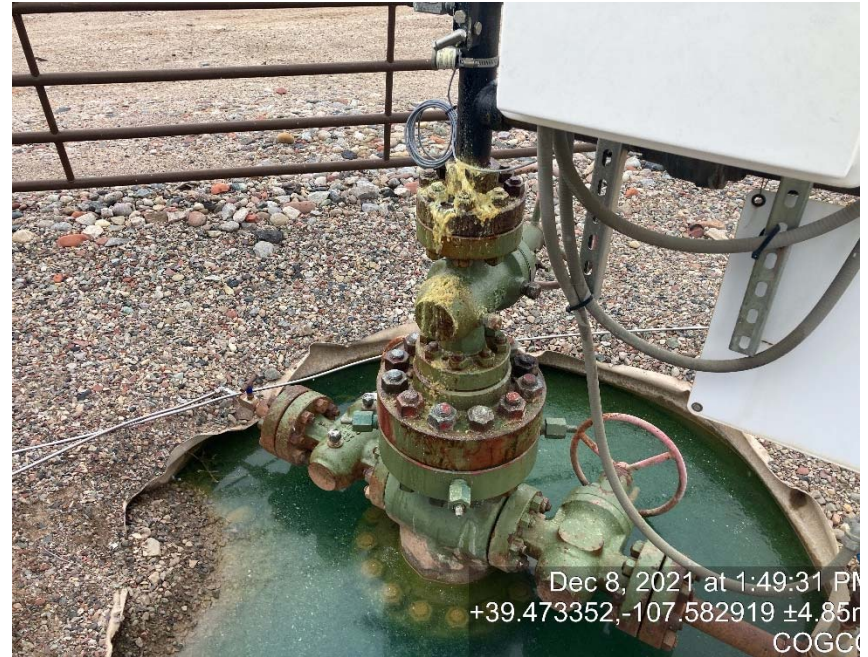
Leaking well head