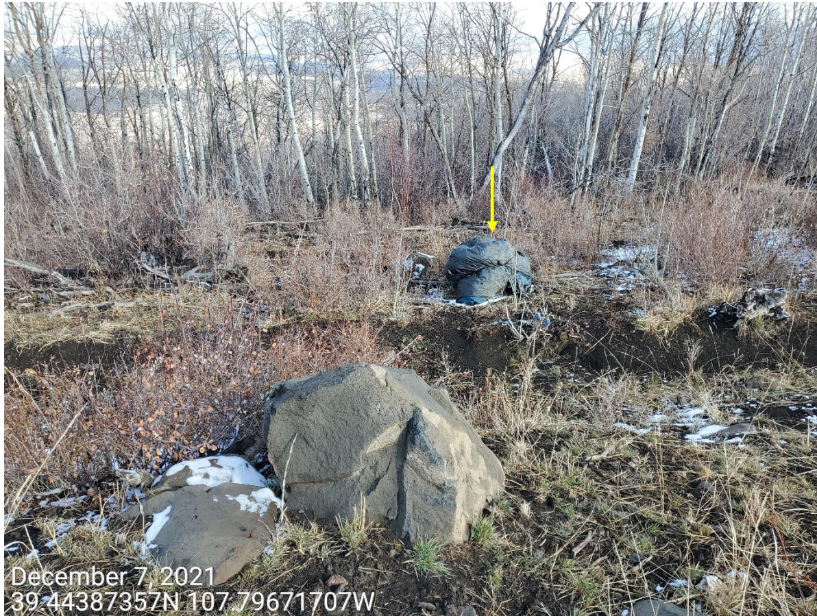
Photo 9: Photo shows what appears to be a bundle of tarp material stored on the northern interim areas of the Location.