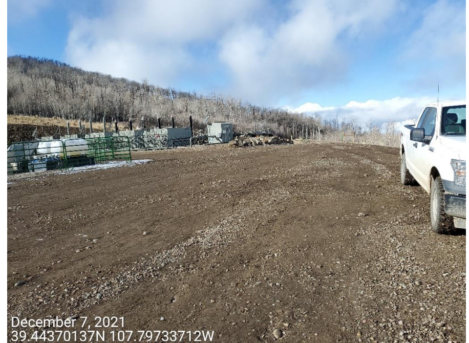
Photo 2: Photos 1-2 provide an overview of the Location from east, southeast, southwest to west.