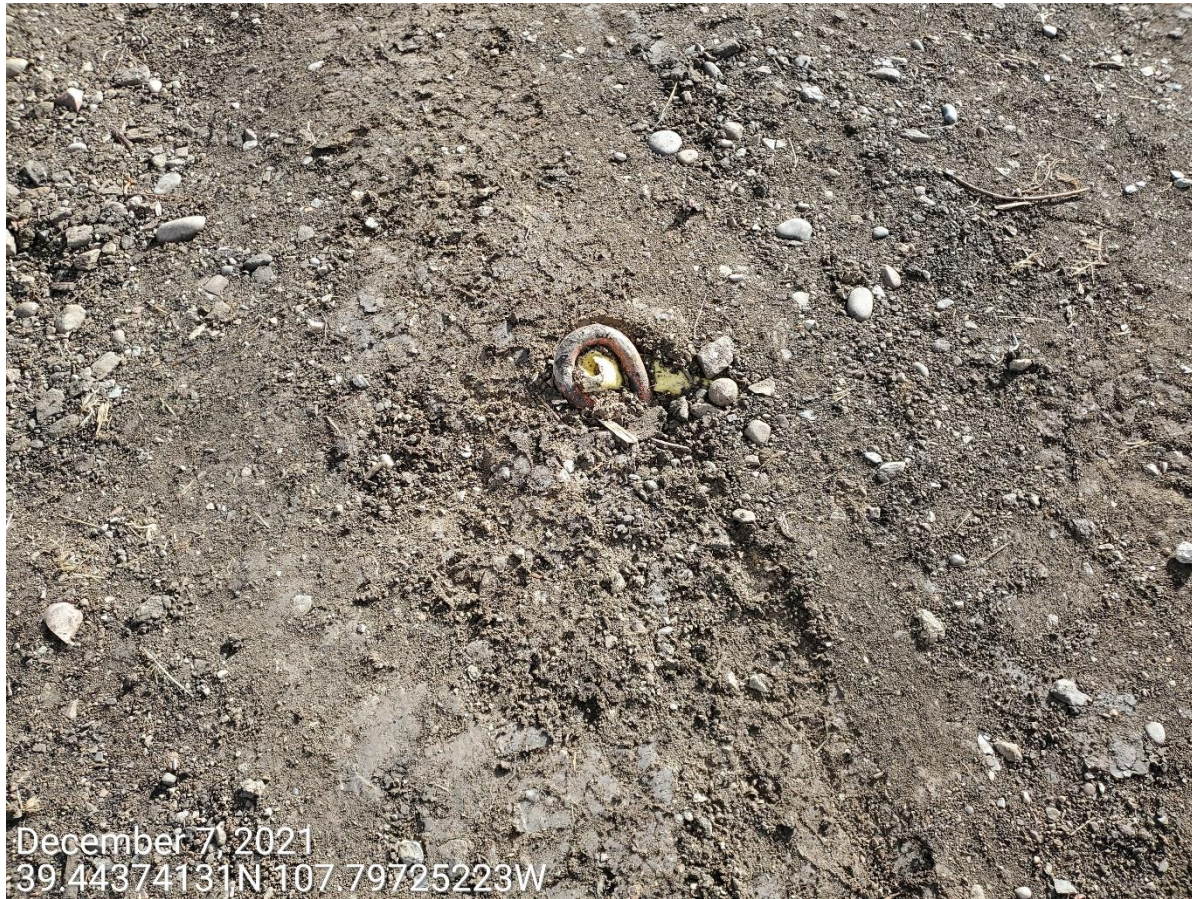
Photo 10: Photo example of anchor observed on the Location without proper marking.