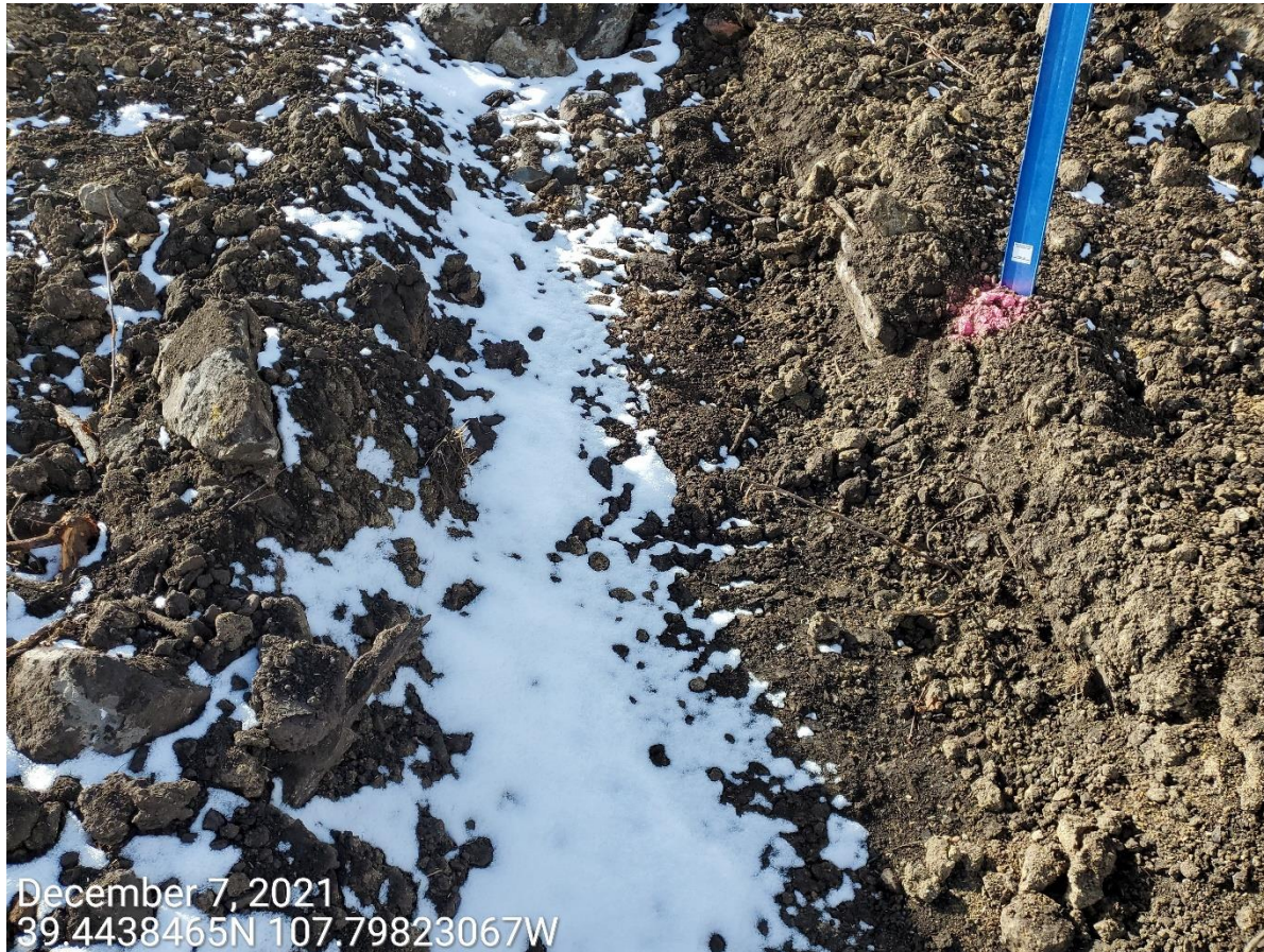
Photo 8: Photo taken from the stormwater diversion ditch on the west end of the Location. Photo shows soils within ditch have not been consolidated in accordance with good engineering practice; soils within ditch are loose, and are considered a pollutant source.