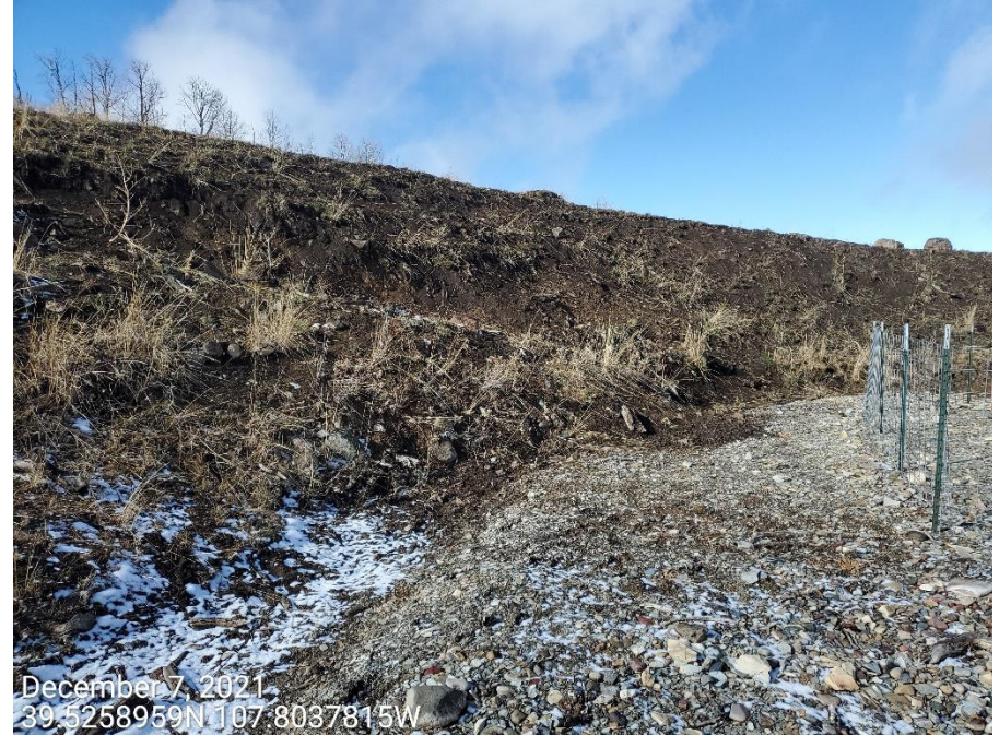
Photo 4: Photos examples showing control measures to protect and stabilize the cut slopes of the Location are missing or insufficient; erosion degradation evident.