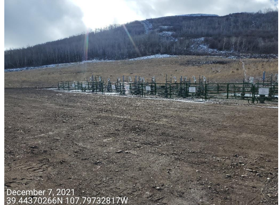
Photo 1: Photos 1-2 provide an overview of the Location from east, southeast, southwest to west.