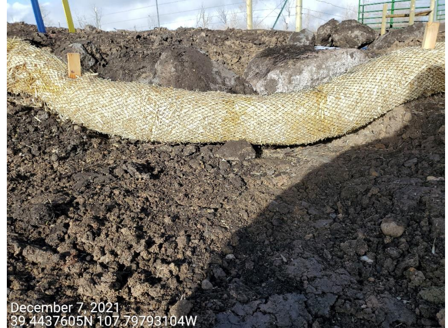
Photo 6: Photos provide example of straw wattles observed implemented on the west end of the Location. Photos show wattles have not been installed per good engineering practices; wattles have been placed/staked upon the surface, and have not been trenched and backfilled.