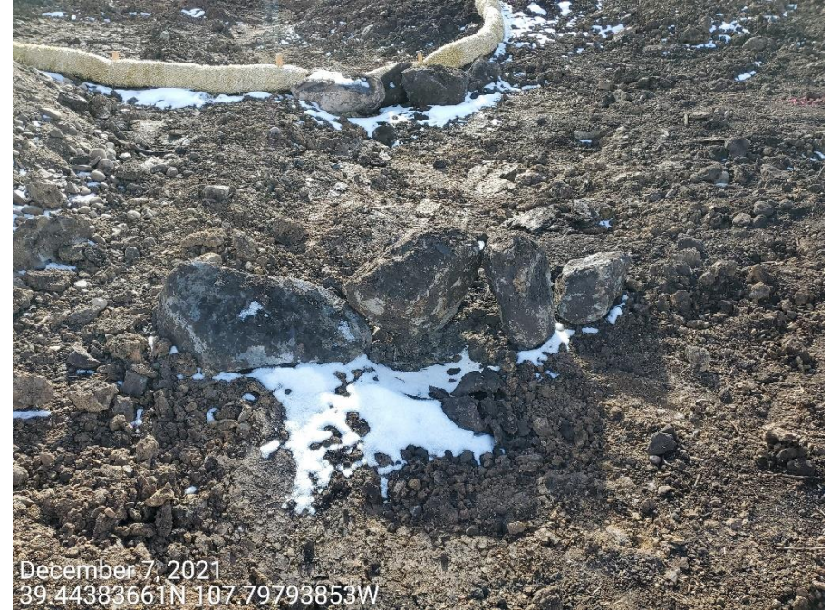
Photo 7: Photos provide example of rock checks / velocity checks observed implemented within the ditch and other areas on the west end of the Location. Rock checks have been constructed with inappropriately sized material, and in such a manner that will facilitate stormwater erosion degradation.