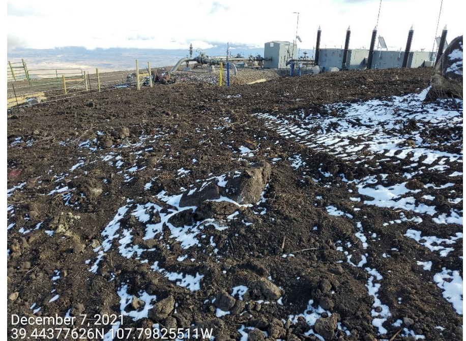
Photo 5: Photos examples showing the recently disturbed areas along the west end of the Location; re-seeding evident. Photos show stormwater and erosion control measures to stabilize soils are missing or insufficient.