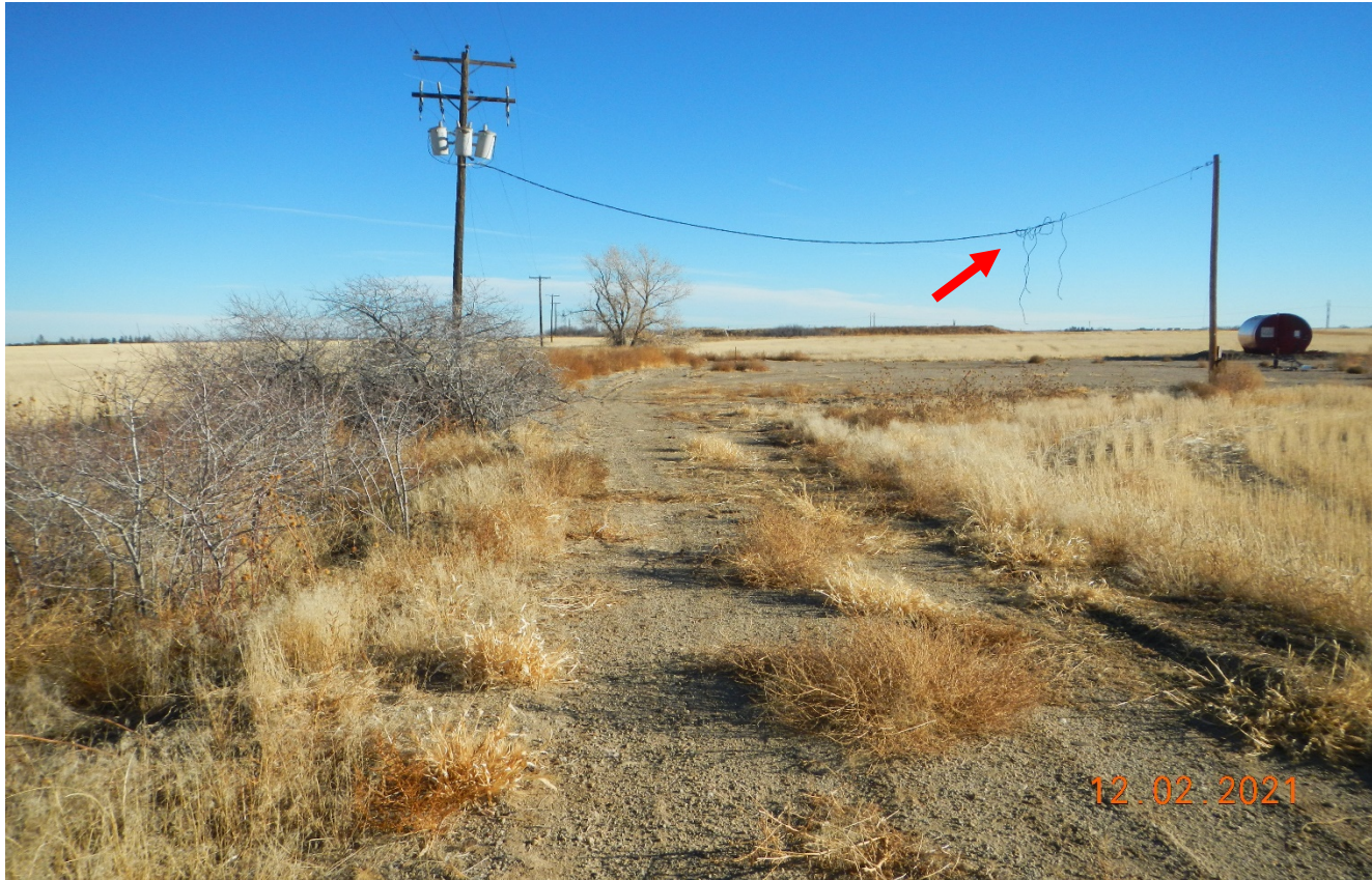
Photo 1. Facing northeast along the access road toward the well site. The electric utility at the location is in disrepair shown at red arrow.