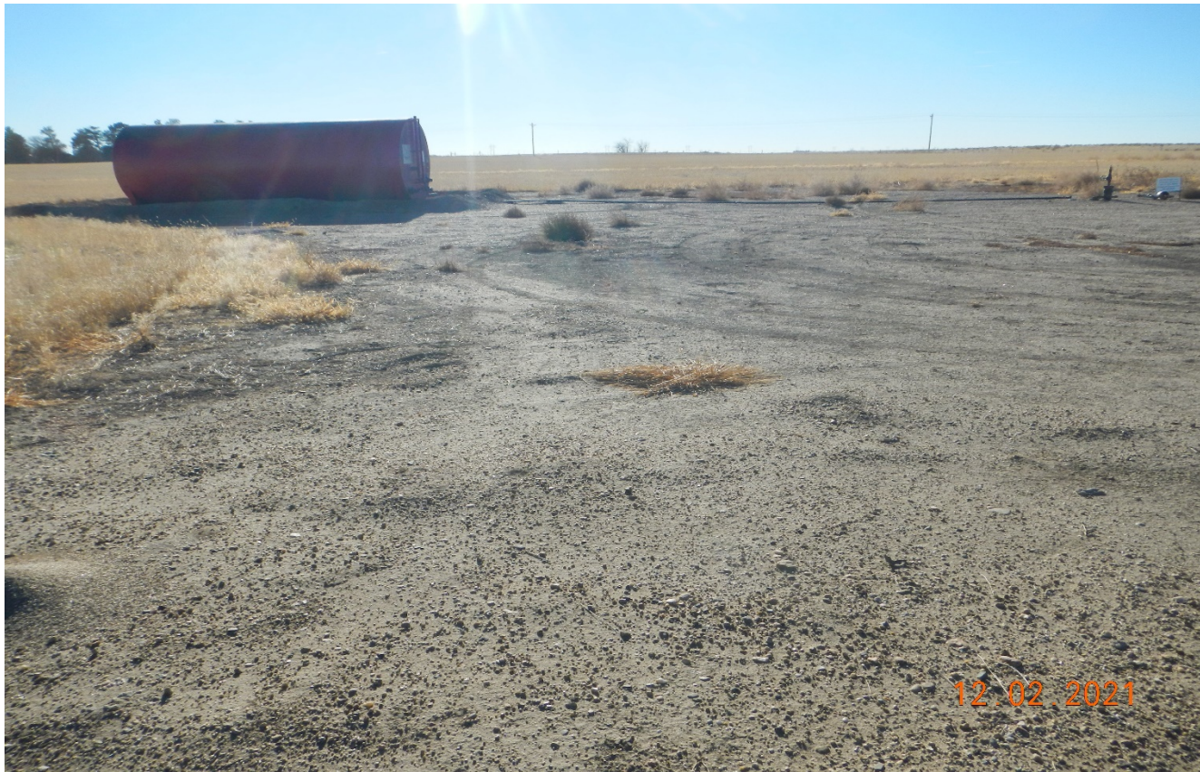
Photo 2. Facing southwest toward the well and tank battery.