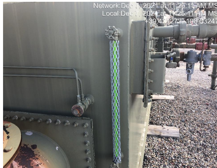
Photo #5333 Sight glass indicates the storage is tank is full of an unknown fluid.