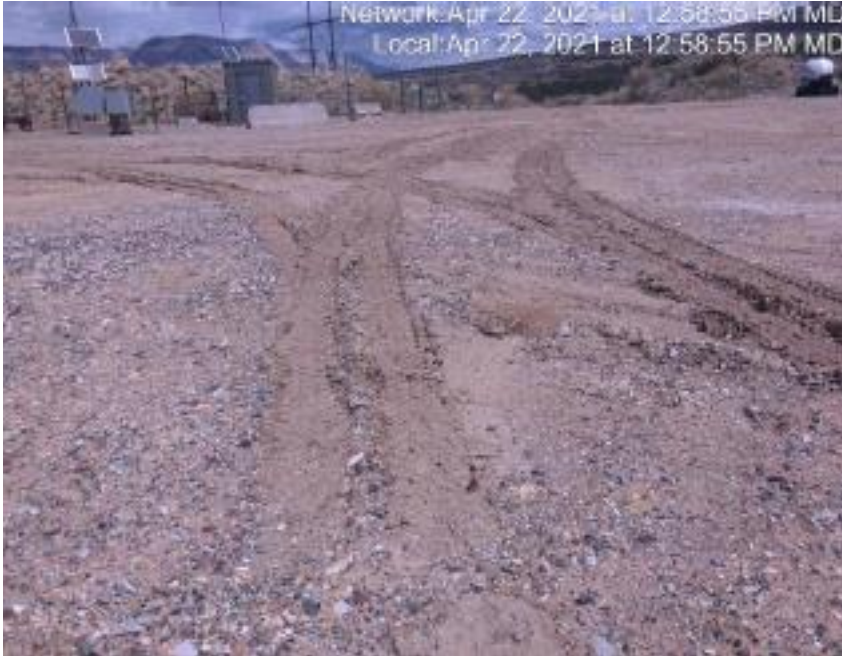
Photo #3589 from inspection #699802967 conducted on 4/22/21.