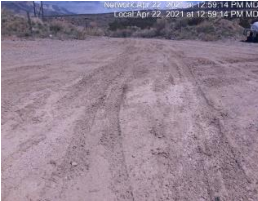
Photo #3588 from inspection #699802967 conducted on 4/22/21.