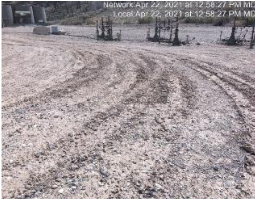
Photo #3588 from inspection #699802967 conducted on 4/22/21.