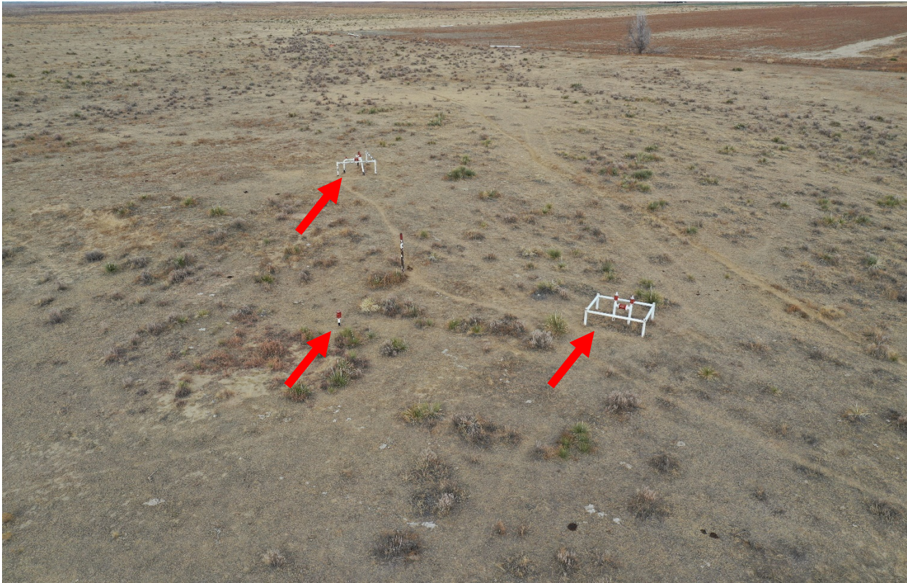
Photo 3. There are abandoned pipe risers that remain at the north side of the location.