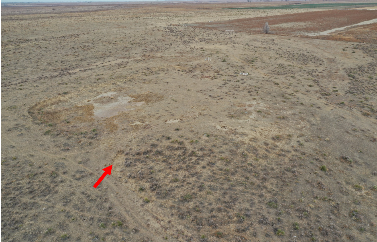
Photo 1. Drone aerial photo facing northwest toward the abandoned well location. The location has not been recontoured and reclaimed. There is erosion occurring along the access road near the location shown at red arrow.