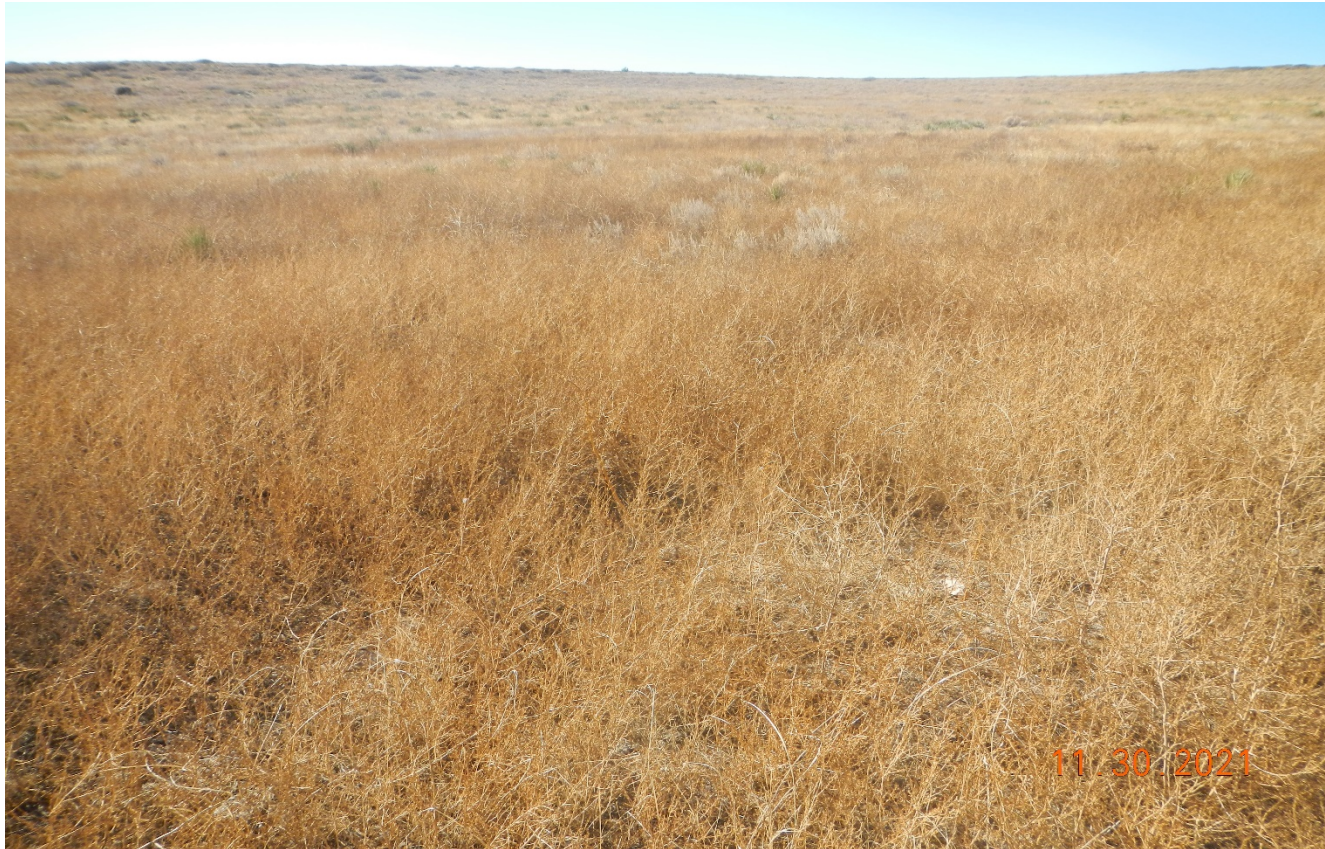
Photo 4. Facing west at the south side of the location. This area consists mostly of undesirable weeds (Russian thistle).