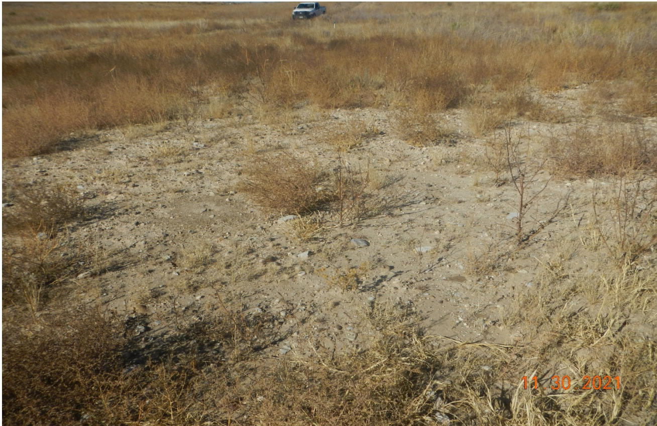
Photo 8. The equipment previously observed was removed however reclamation has not been performed.