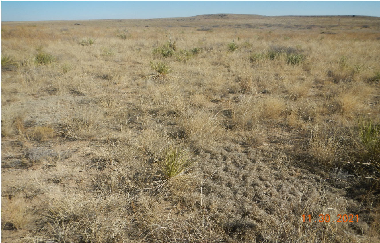
Photo 9. Facing toward the surrounding undisturbed reference area which consists of Blue grama, Sand dropseed, Prairie threeawn, among other native species.