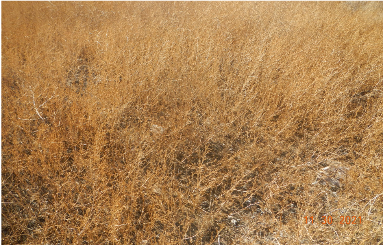
Photo 6. View of undesirable weeds at the south side of the location. The weed debris needs to be removed and the area reseeded.