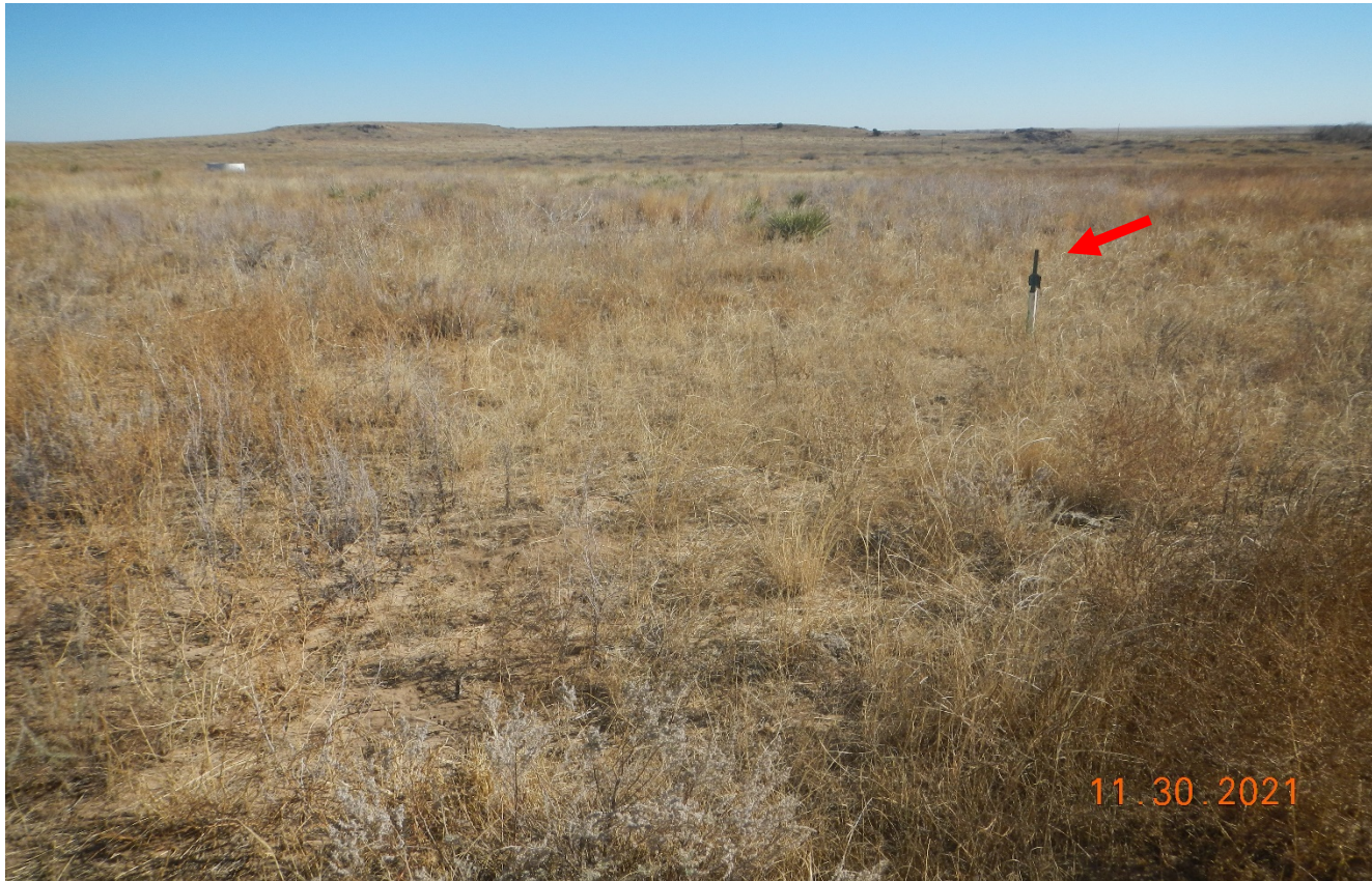
Photo 2. There is a plastic pipe with t-post at north side of the location shown at red arrow. This needs to be removed.