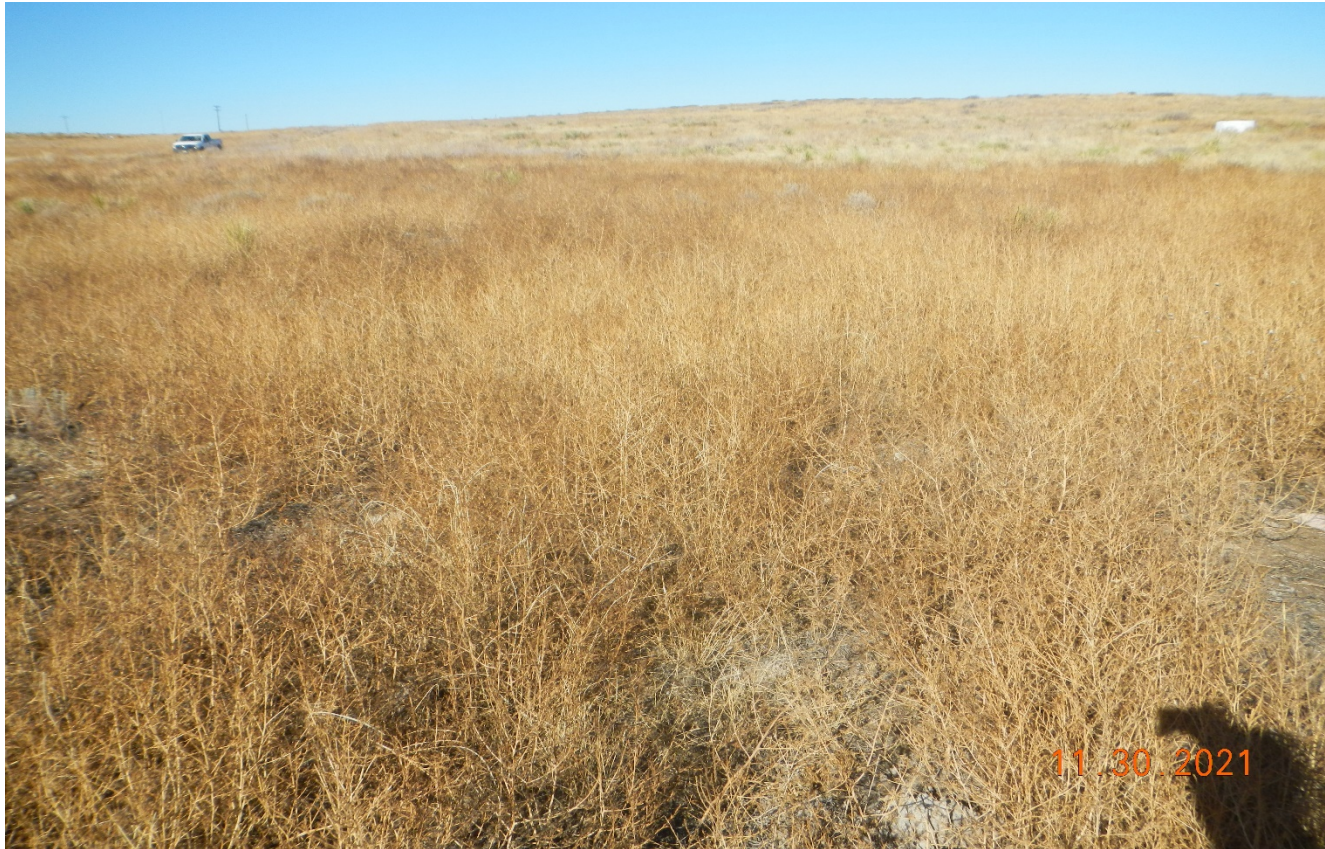
Photo 5. Facing north at the south side of the location. This area consists mostly of undesirable weeds (Russian thistle).