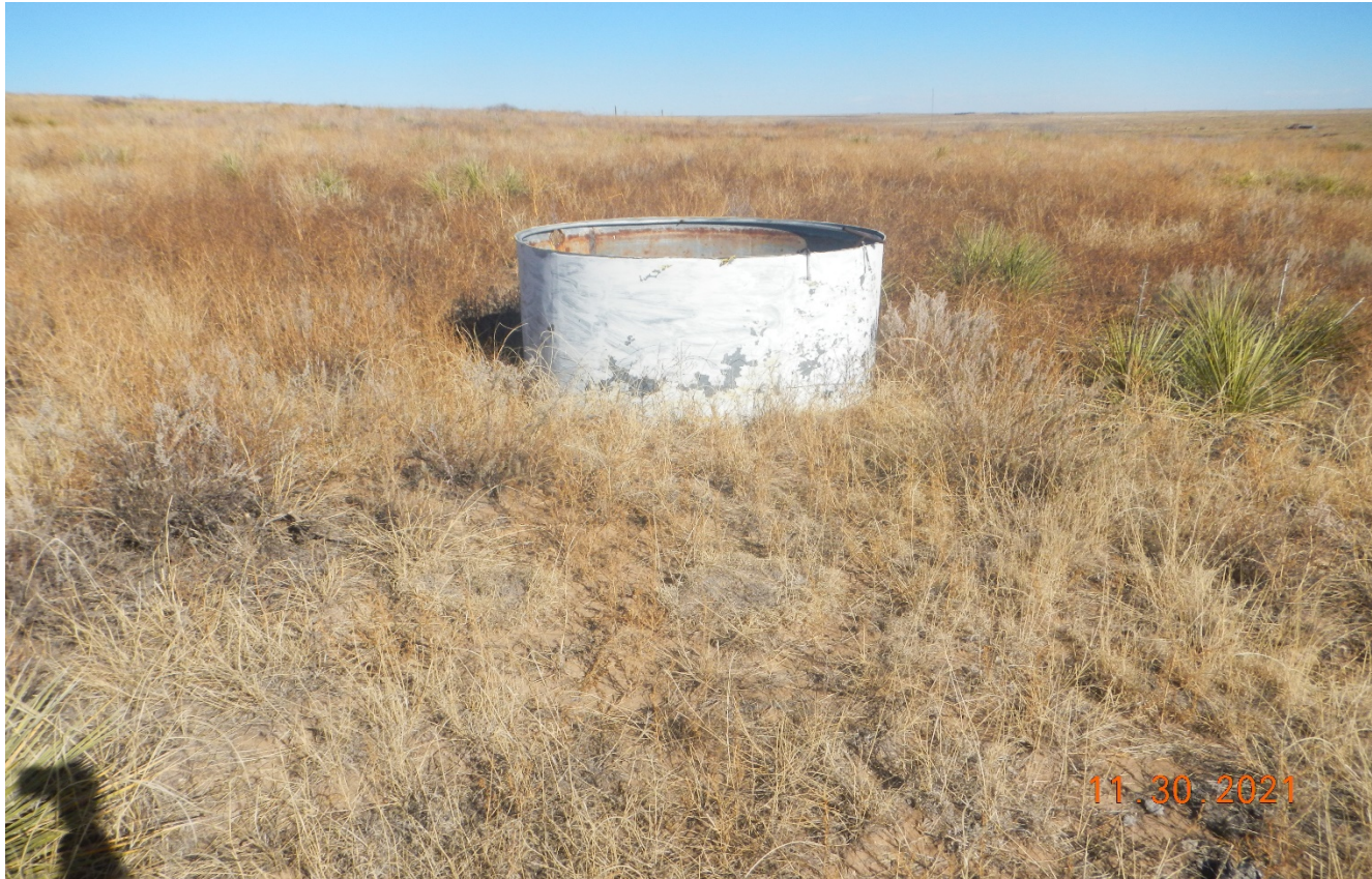
Photo 3. Facing northeast near the location. There is culvert with pipeline valves that appear to be associated with the well.