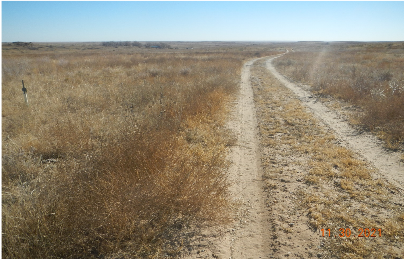
Photo 1. Facing southeast toward the location. The access road continues thru the location.