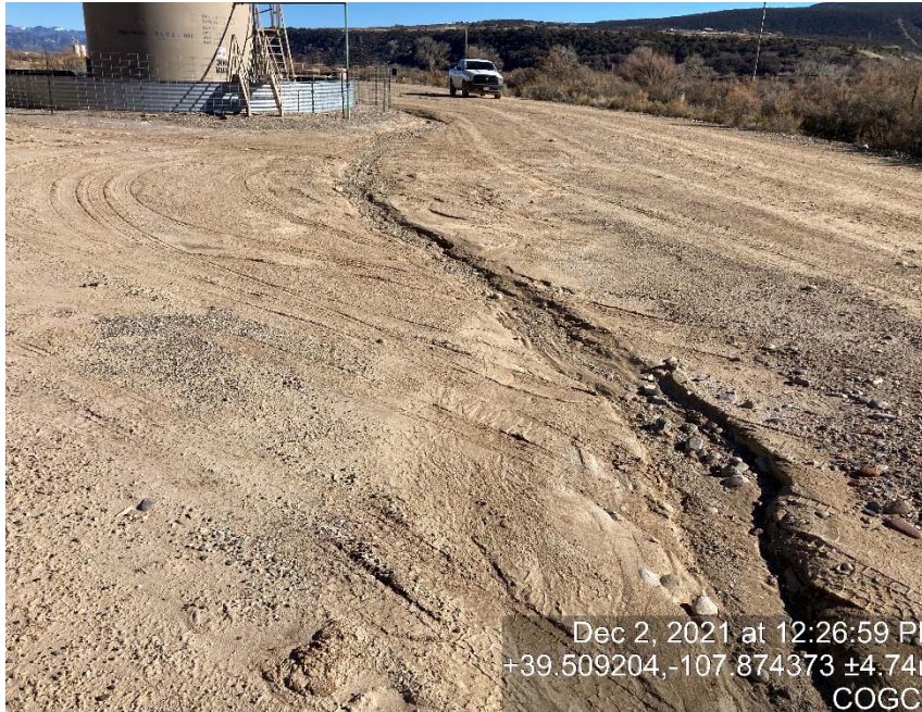
Lack of stabilization/erosion/sediment migration