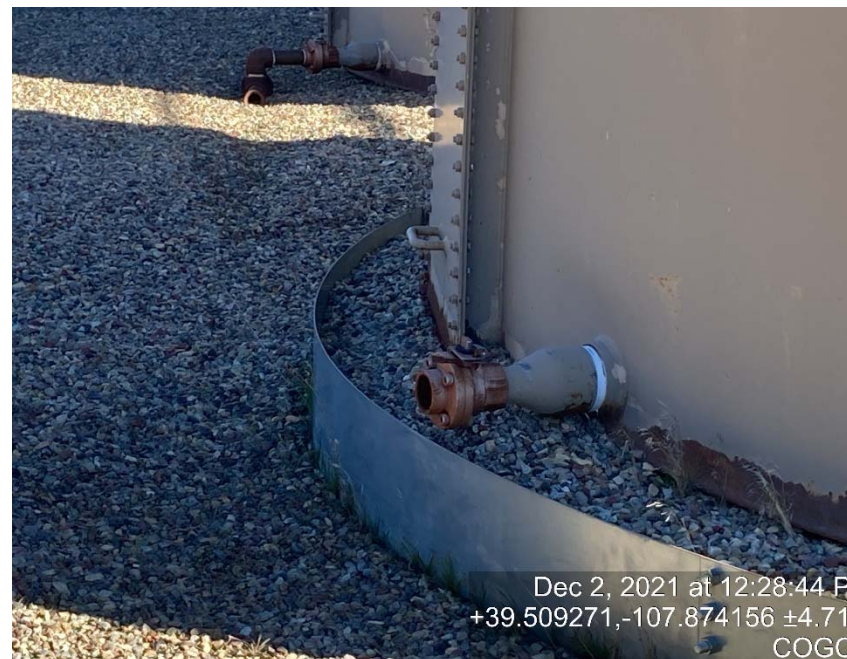
Load lines lacking bull plugs/caps