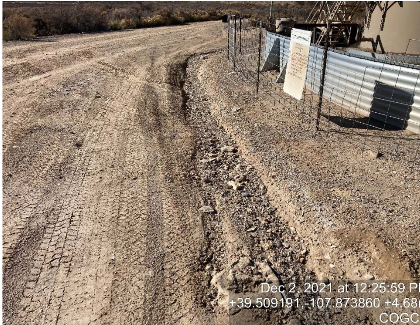
Lack of stabilization/erosion/sediment migration