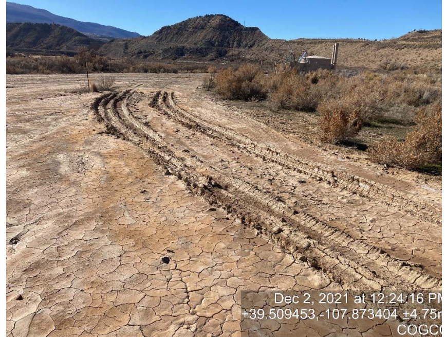
Lack of stabilization/erosion/sediment migration