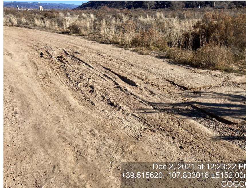
Lack of stabilization/erosion/sediment migration