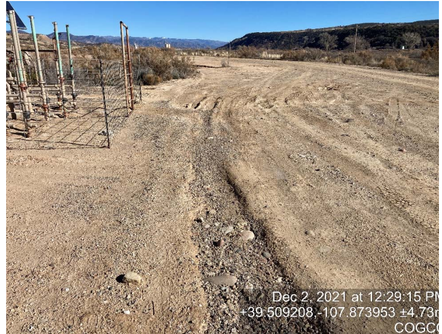
Lack of stabilization/erosion/sediment migration