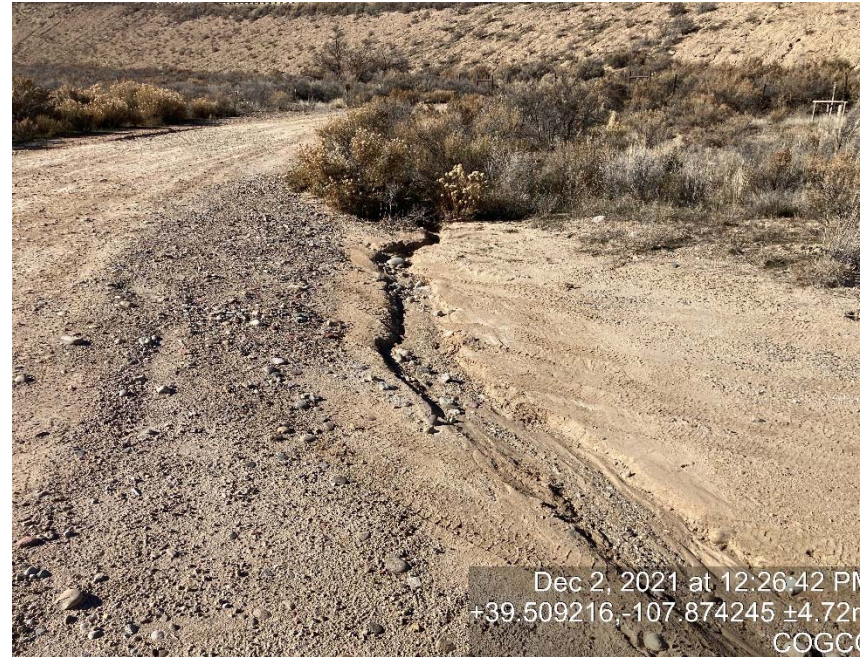
Lack of stabilization/erosion/sediment migration