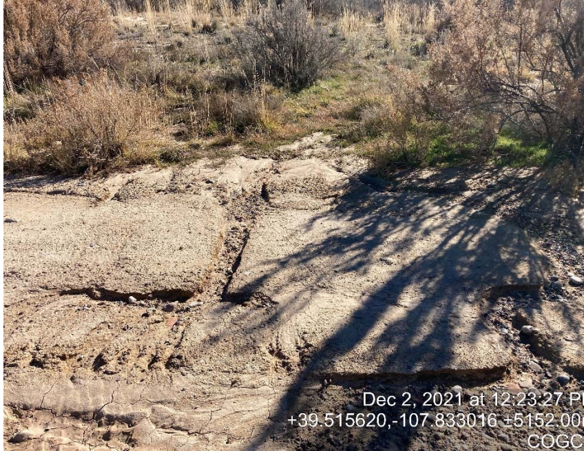
Lack of stabilization/erosion/sediment migration