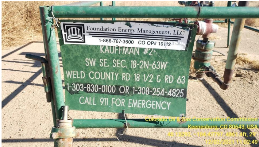
Photo 1 WH sign