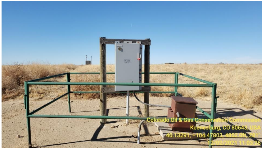
Photo 3 Electric panel