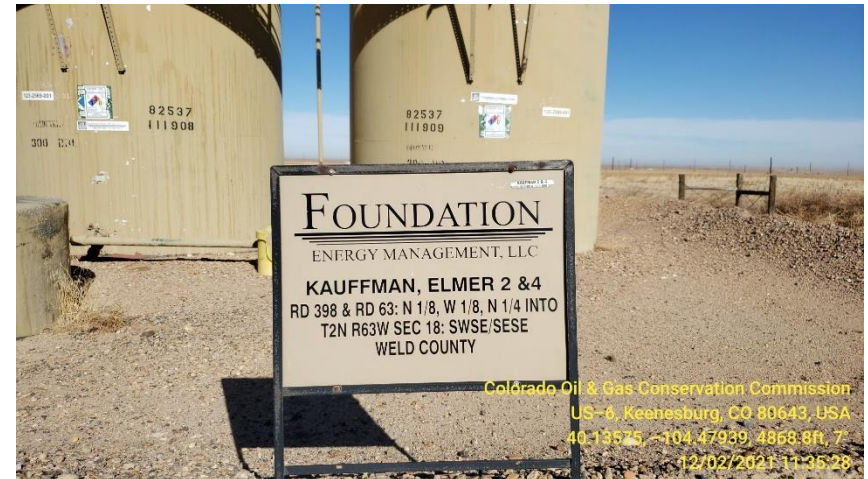
Photo 5 wees all along TB access rd.