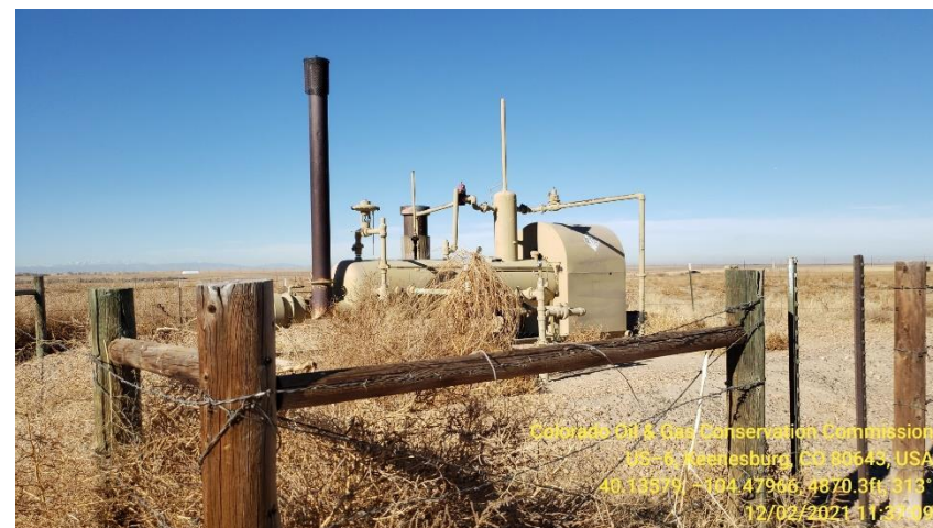
Photo 8 Dead weeds by the Horiz. Heated Sep.