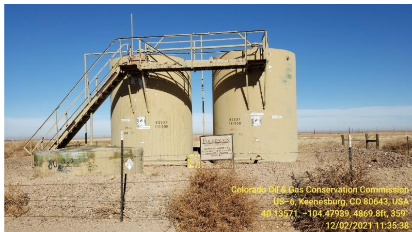
Photo 7 Dead weeds on TB berm.