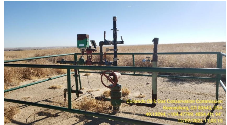
Photo 2 WH