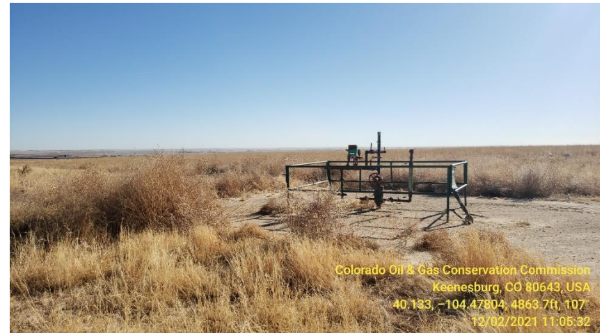
Photo 4 tall dead weeds around wellsite ROW