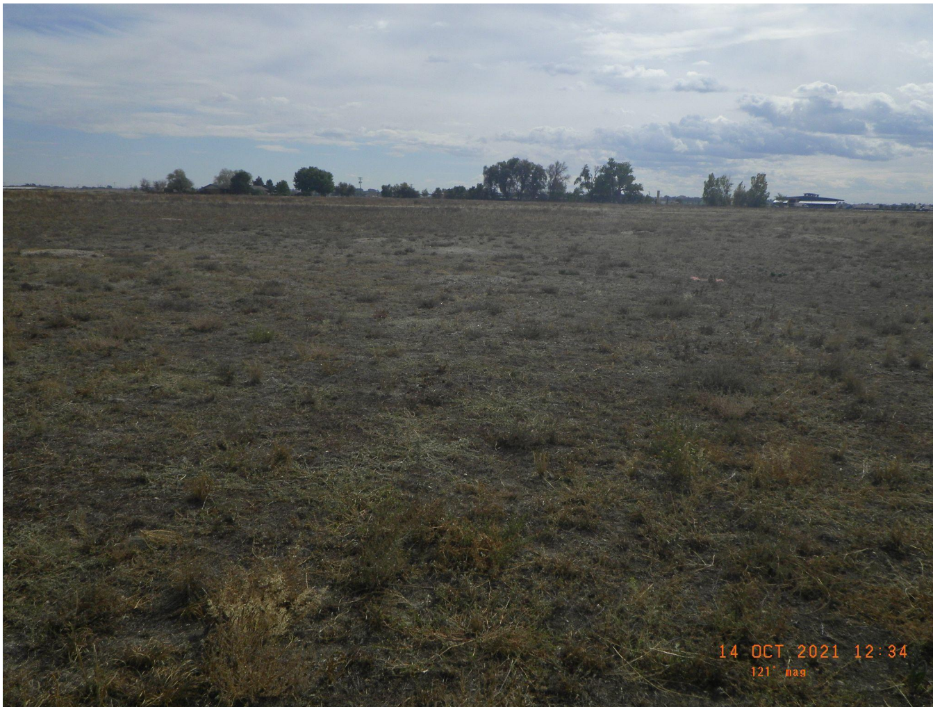
Photo 5. Reference photo to the east of the well pad.