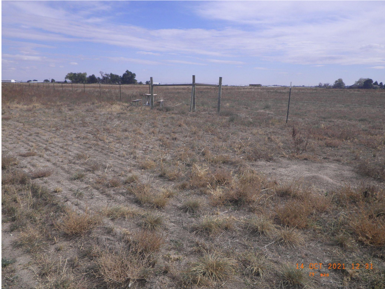
Photo 2. Overview photo of the well pad taken at ground level from the south end looking north. Note: well pad resides on the edge of an active campground and has been seeded with an unknown perennial bunchgrass when the land transitioned from agriculture to campground use. Fence in background of photo is not associated with oil and gas operations.