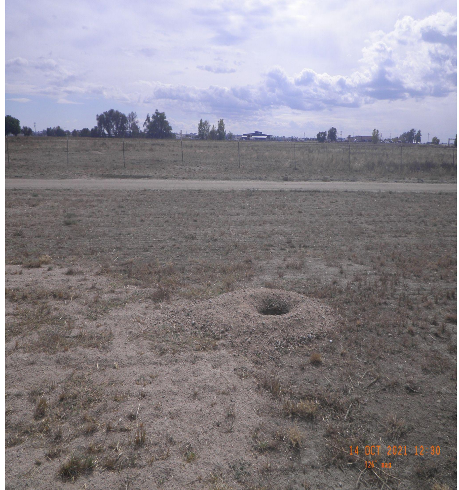
Photo 7. Photos taken from the middle of the tank battery. Left photo facing north and right photo facing east (see description under photo 8).