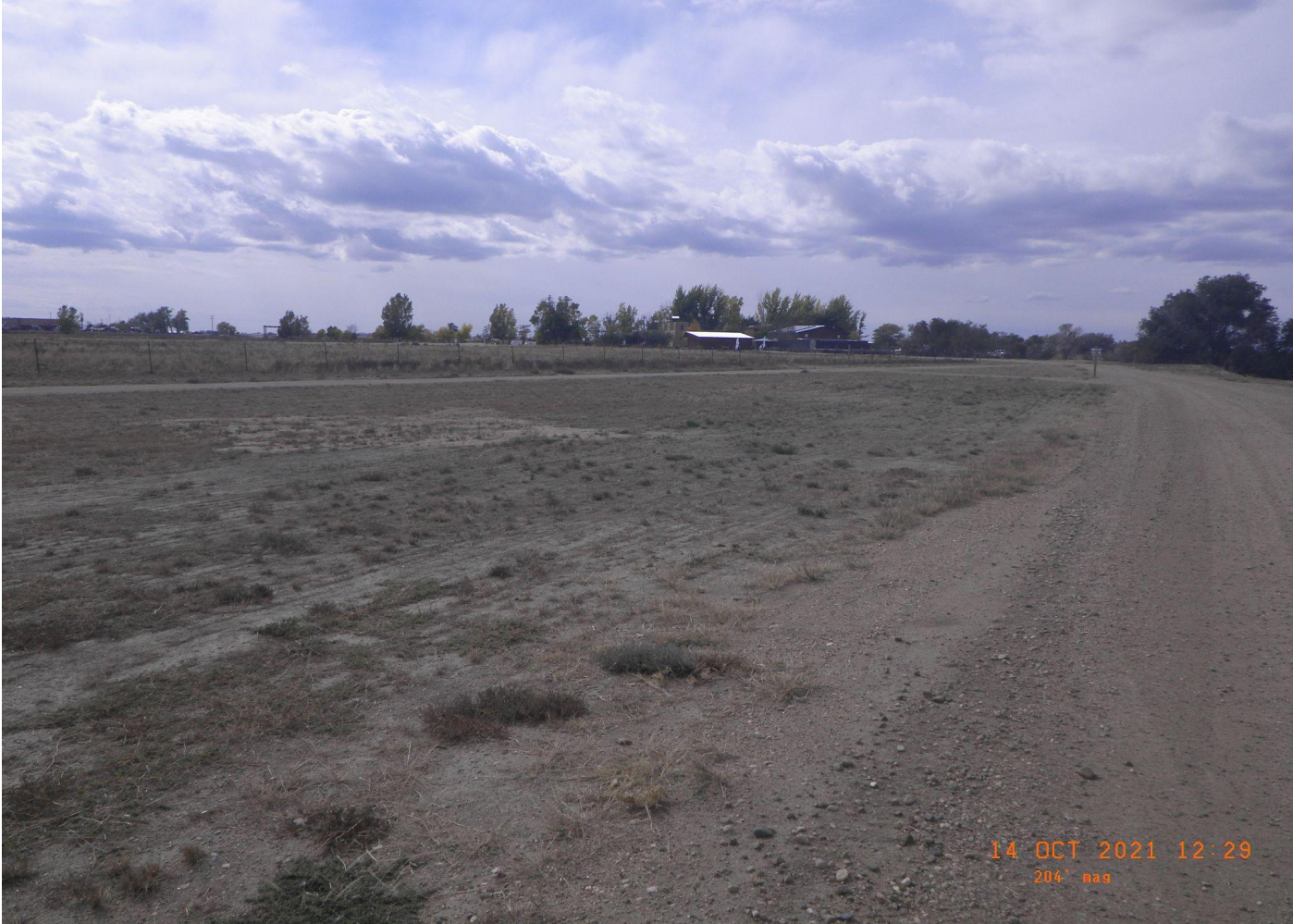
Photo 6. Tank battery overview photo taken at ground level from west of the tank battery looking south. Note: the reclaimed tank battery now resides between two dirt roads in an active campground.