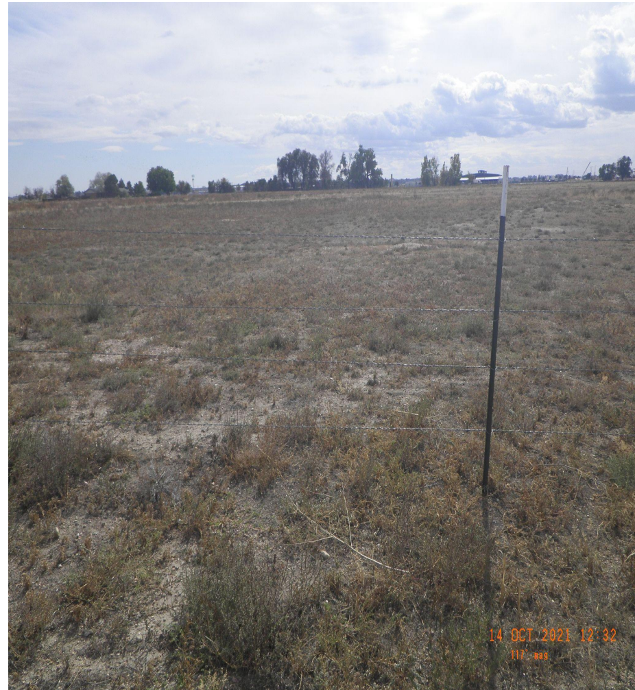
Photo 3. Photos taken from the middle of the well pad. Left photo is facing north and right photo facing east.