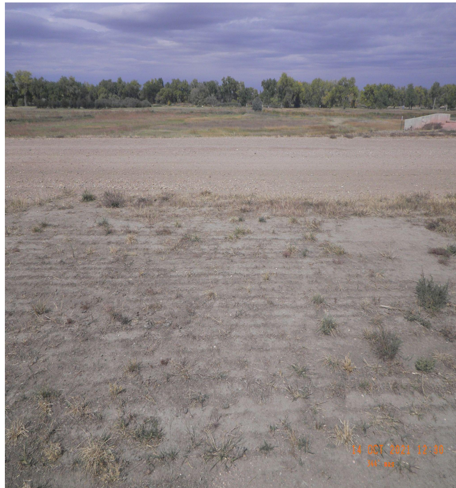
Photo 8. Photos taken from the middle of the tank battery. Left photo facing south and right photo facing west.