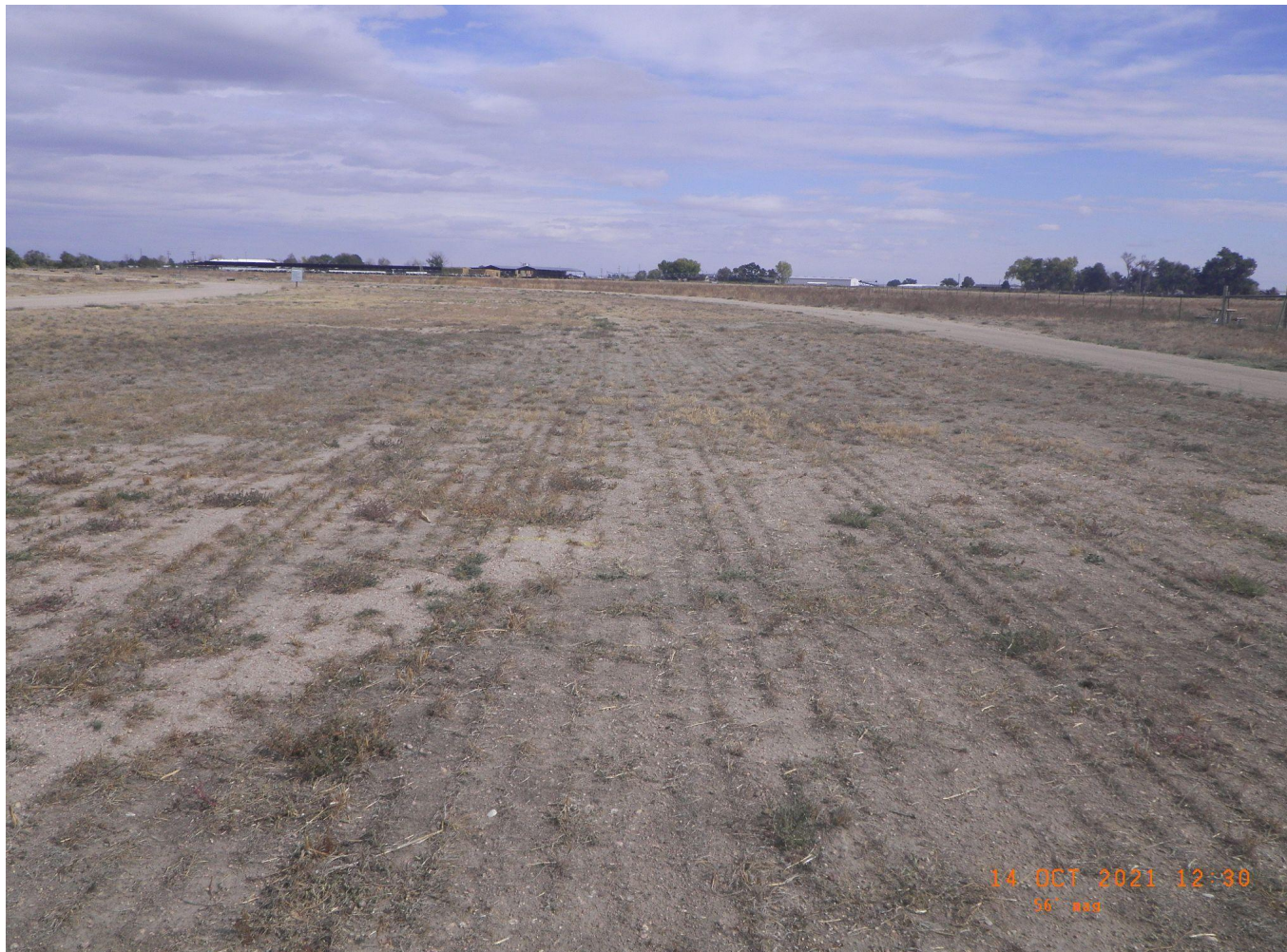
Photo 9. Reference area to the north of the tank battery.