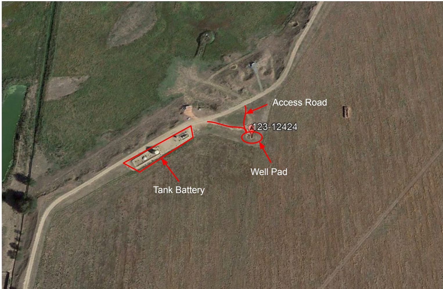
Photo 1. 2016 aerial imagery of the well pad, access road and tank battery (north is up). Note: The tank battery and well pad now exist in a campground.