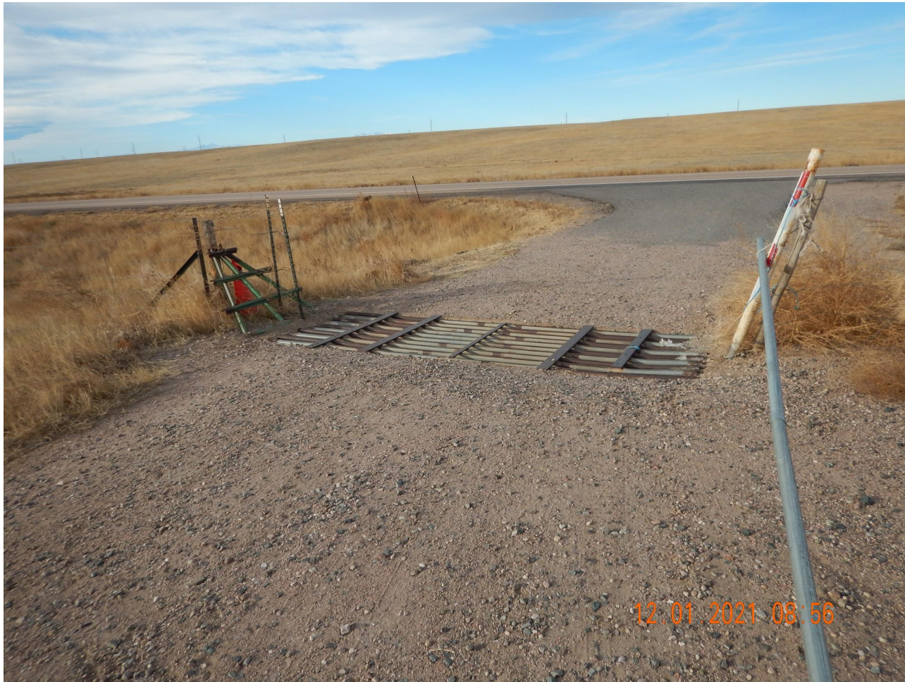
Photo 8. Photo taken from the entrance of location, facing West. Photo illustrates the cattle guard has not yet been replaced but there are plans to replace with a used cattle guard from a nearby PA location.