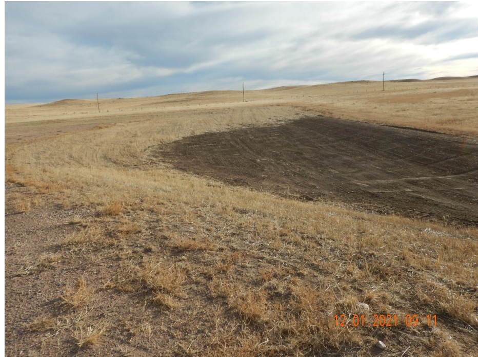
Photo 4. Photo taken from the southwestern location, facing East. Photo illustrates the eastern stormwater pond.