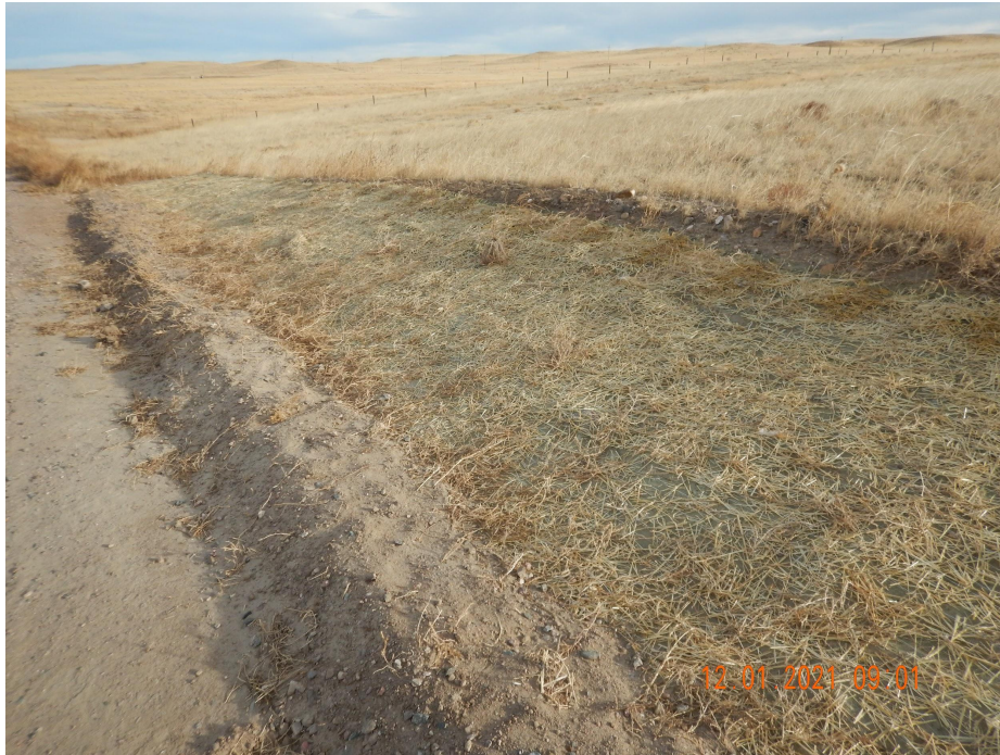
Photo 6. Photo taken from the southern access road, facing Northeast. Photo illustrates Operator has stabilized the cut slope along the access road.