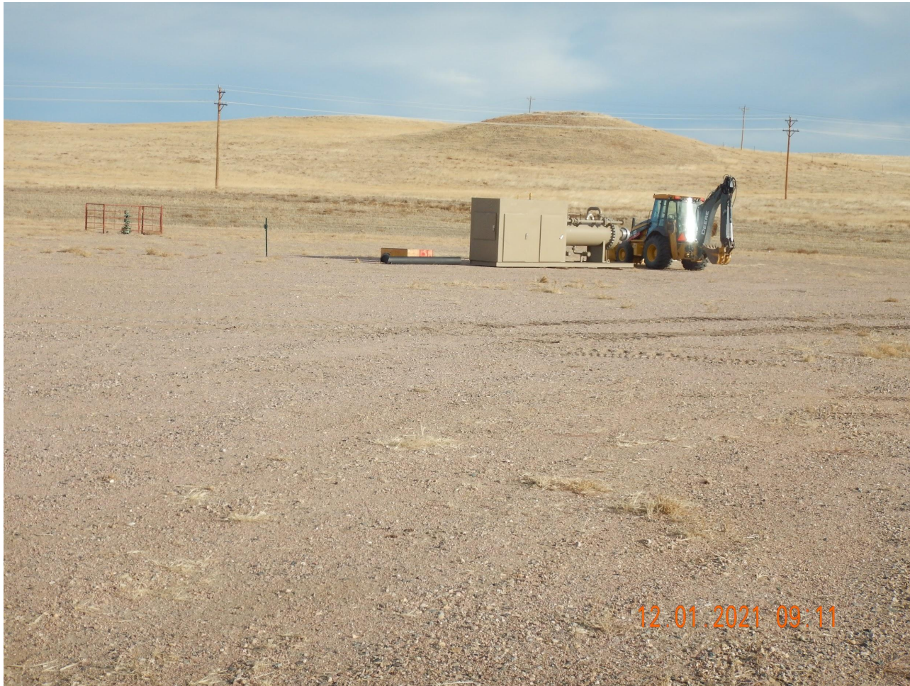
Photo 1. Photo taken from location, facing Northeast. Photo illustrates Operator is starting to mobilize equipment to location.