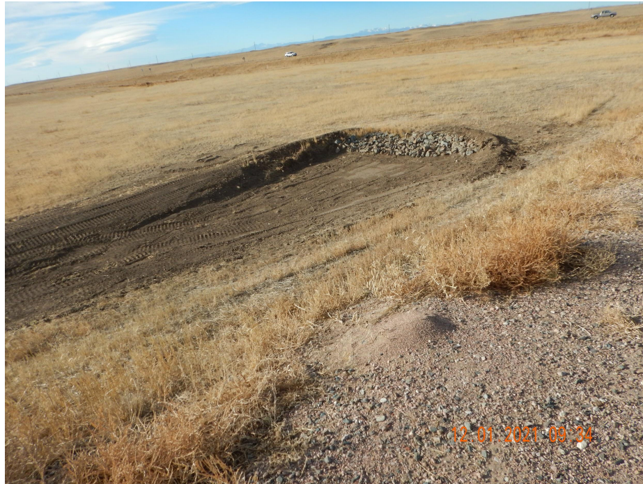
Photo 3. Photo taken from the southwestern location, facing Southwest. Photo illustrates Operator has enlarged the previous sediment trap to a stormwater pond with a stabilized outlet.