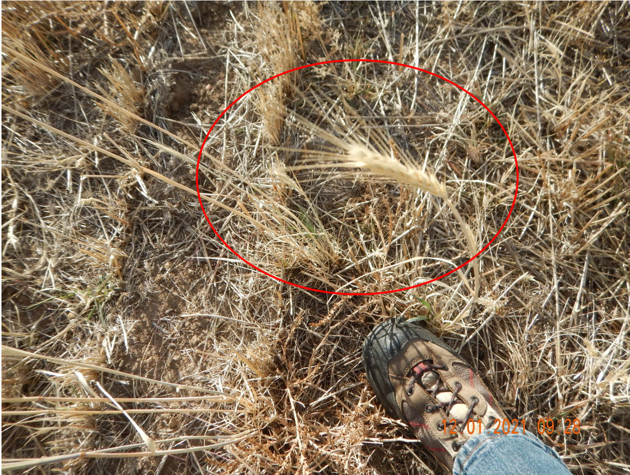
Photo 2. Photo taken from a portion of the interim reclamation area. Photo illustrates Common rye that has matured and gone to seed. This was observed throughout the interim reclamation areas.