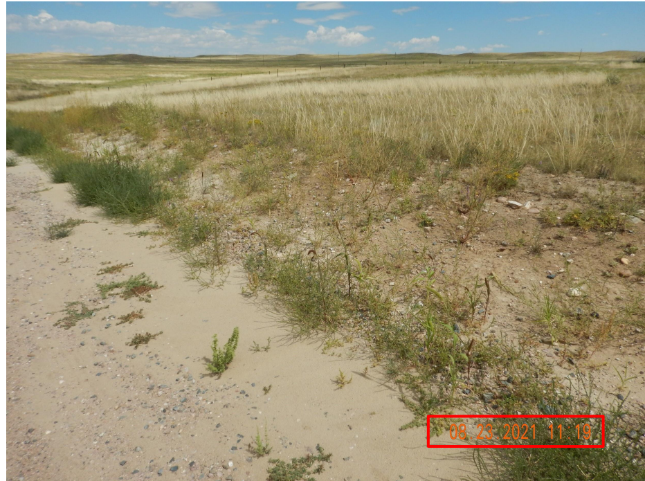
Photo 7. Photo taken from the southern access road on 8/23/2021, facing Northeast.