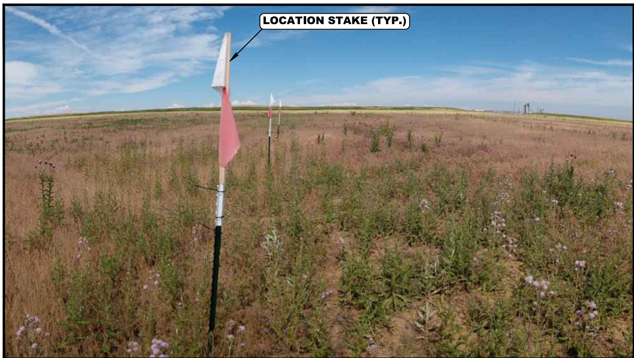
PHOTO: VIEW OF PROPOSED LOCATION