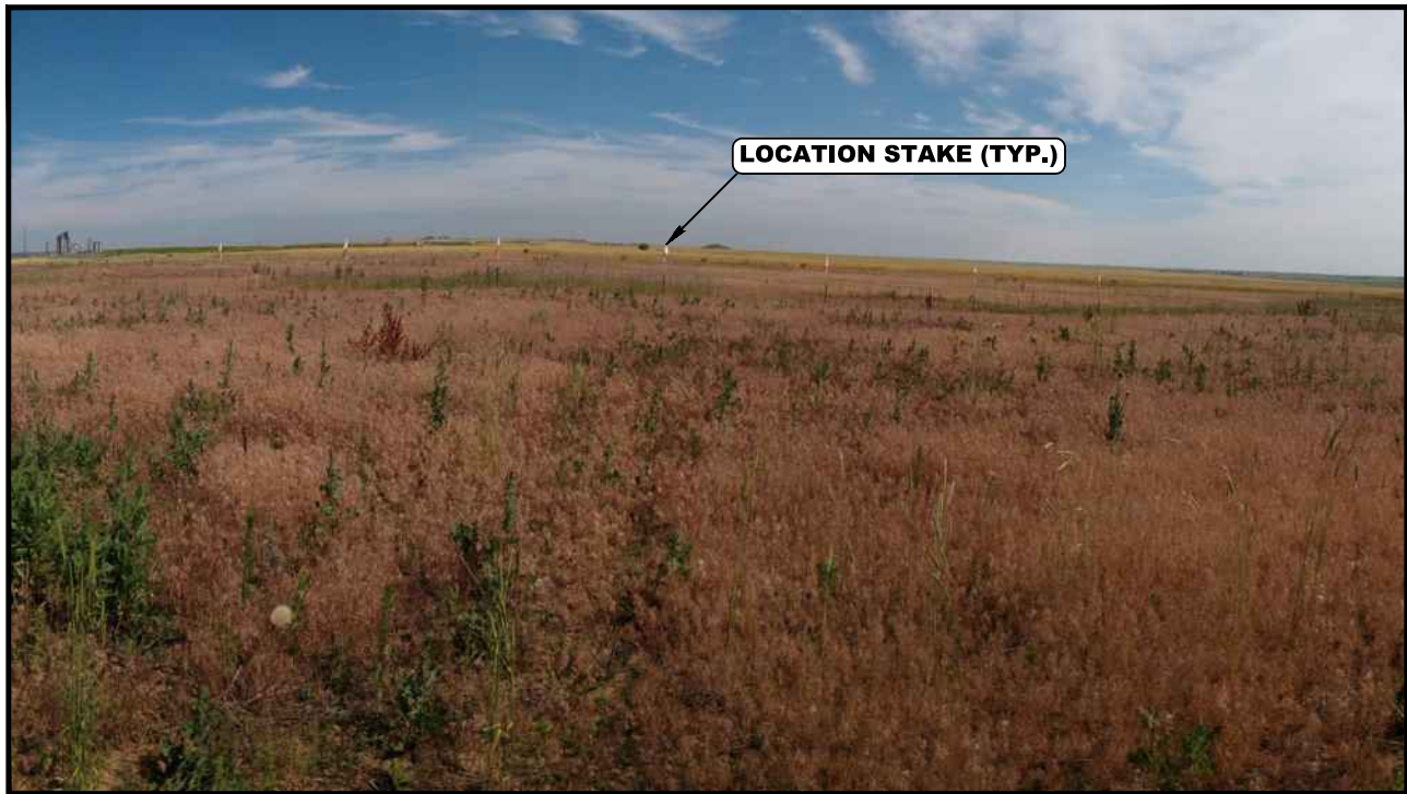
PHOTO: VIEW OF PROPOSED LOCATION