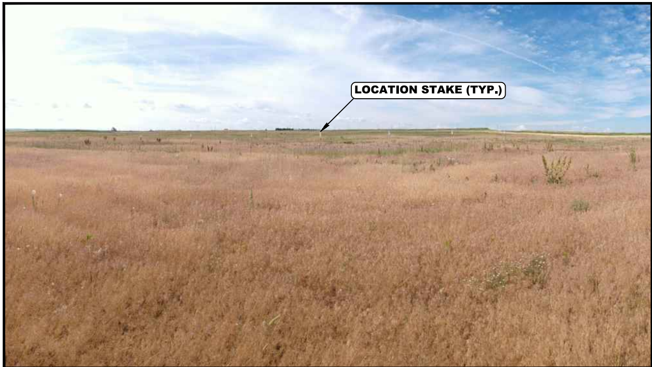
PHOTO: VIEW OF PROPOSED LOCATION