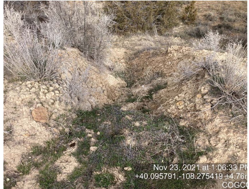
Fill slope erosion channels