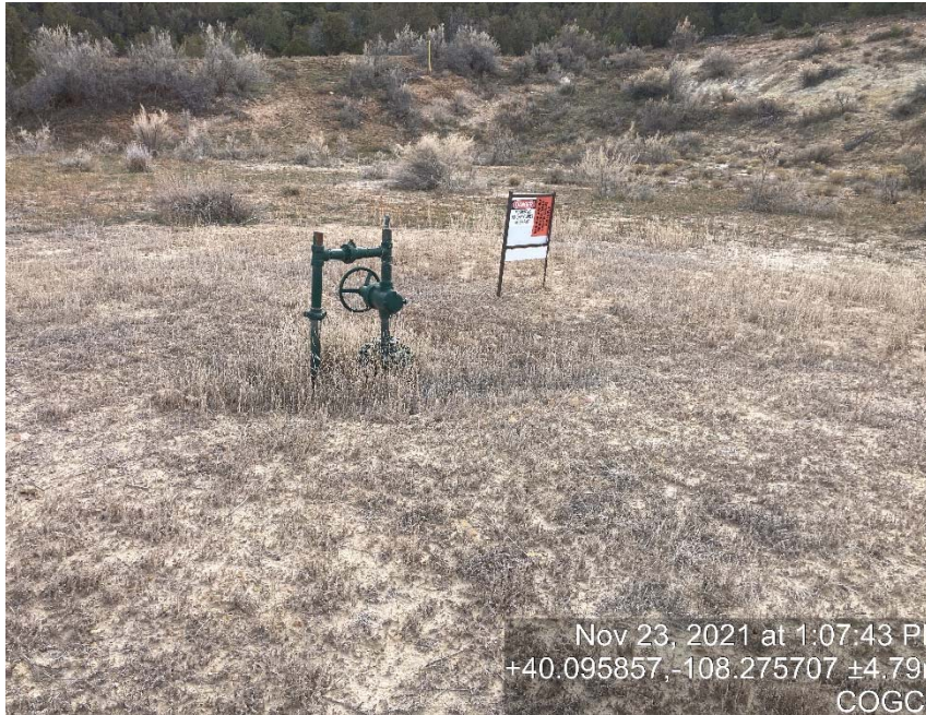
Location/ debris(dead weeds)