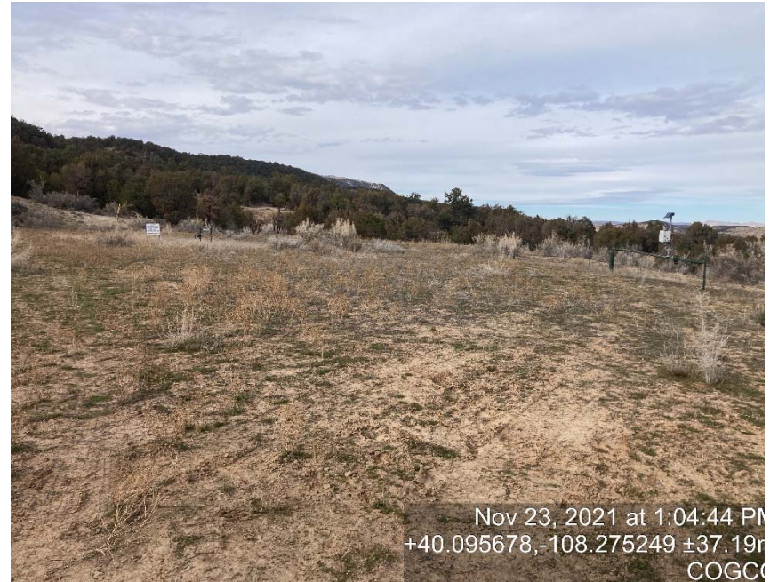
Location/ debris(dead weeds)