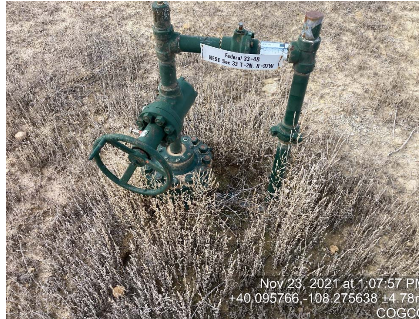
Well head/ lack of Braden head access