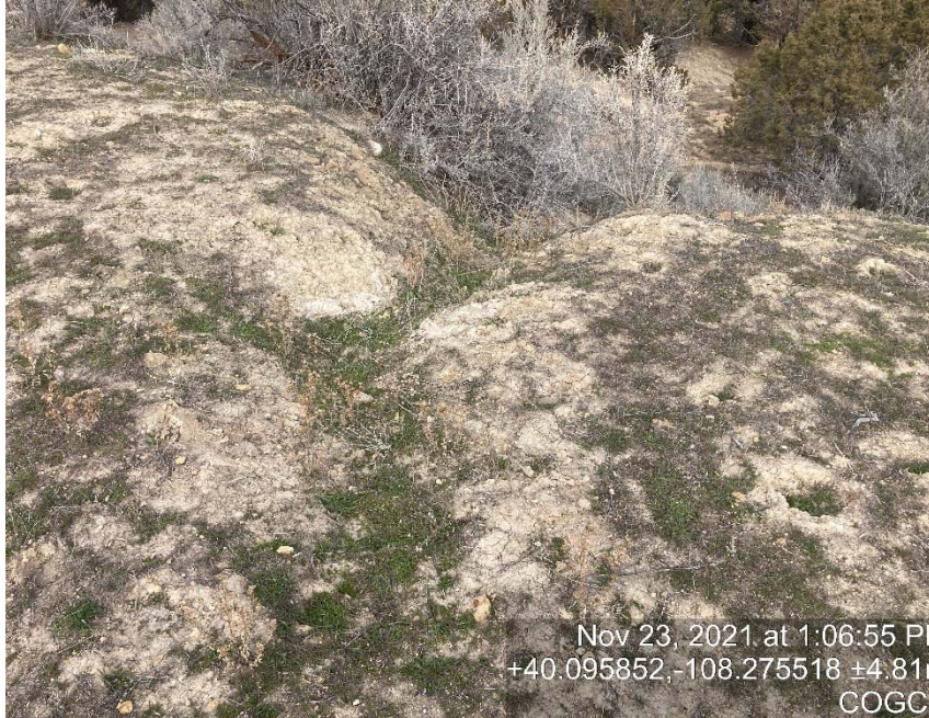
Fill slope erosion channels