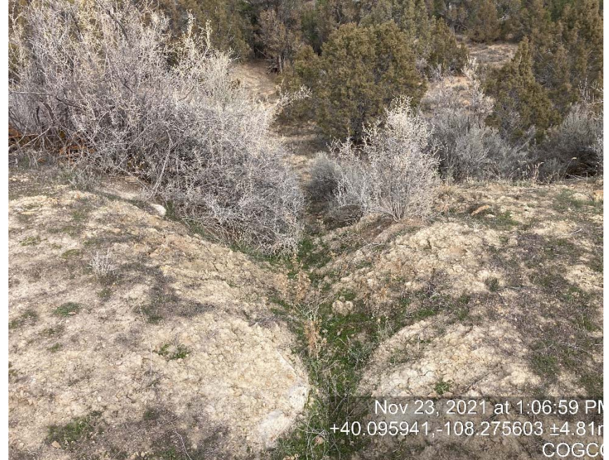
Fill slope erosion channels