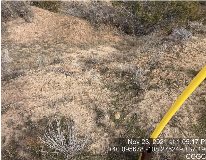
Fill slope erosion channels