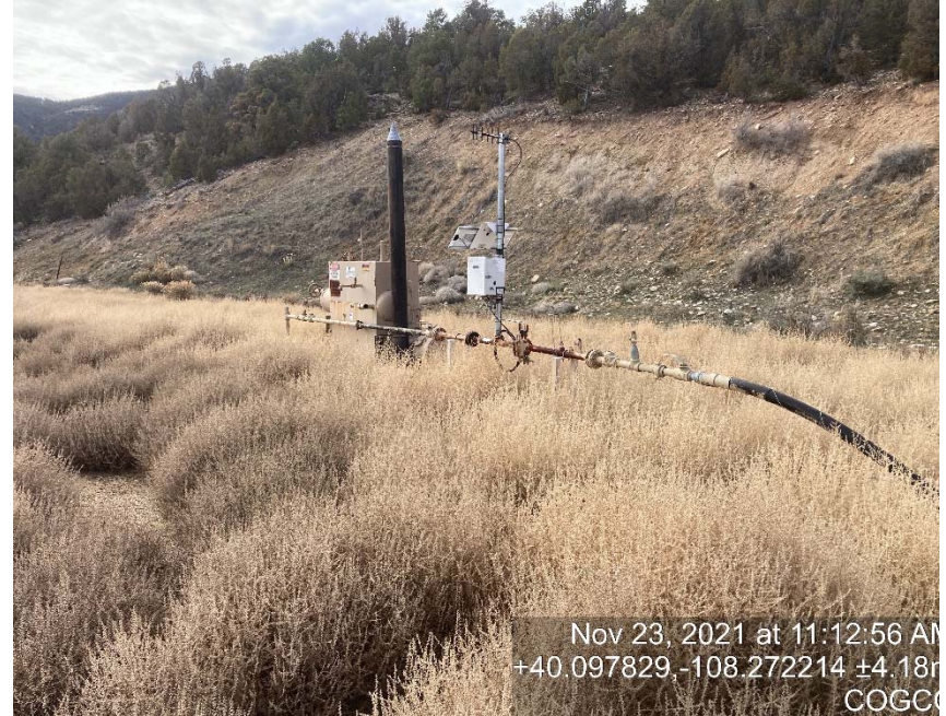
Location/ Debris(dead weeds)