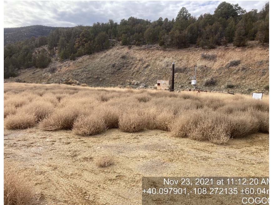
Location/ Debris(dead weeds)