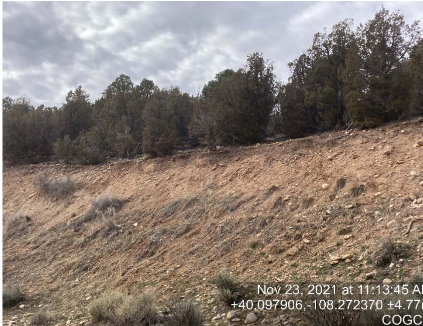
Cut slope lack of stabilization