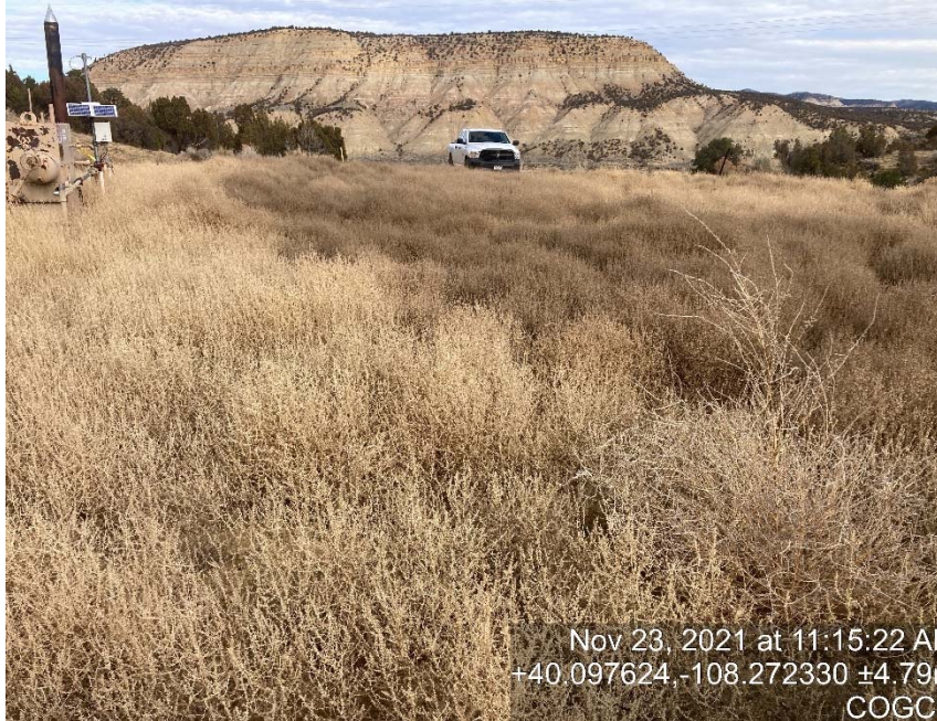
Location/ Debris(dead weeds)