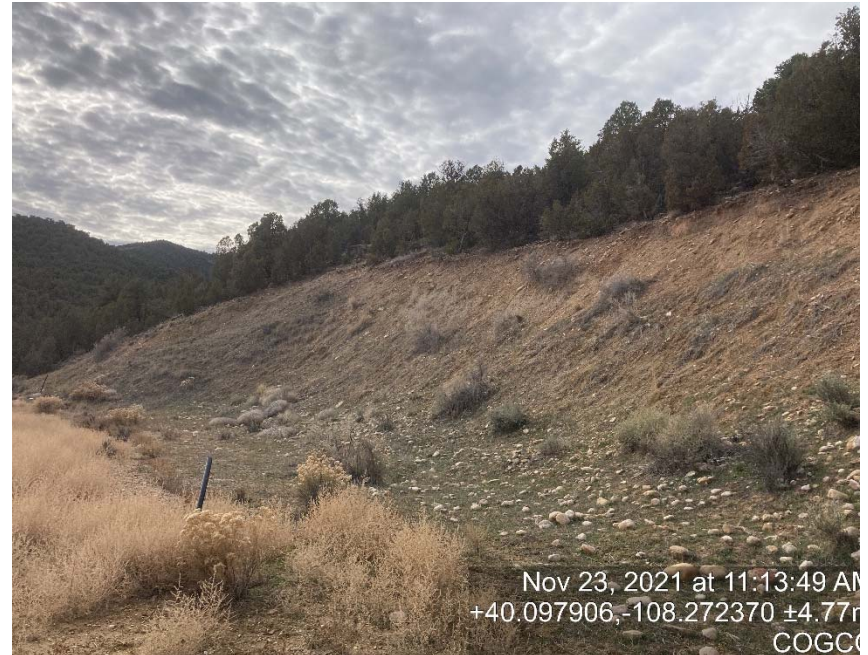
Cut slope lack of stabilization