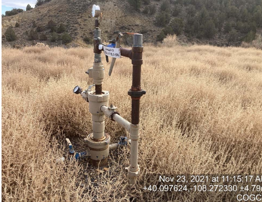
Location/ Debris(dead weeds)