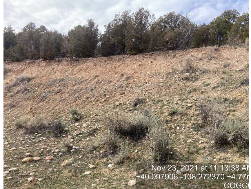
Cut slope lack of stabilization