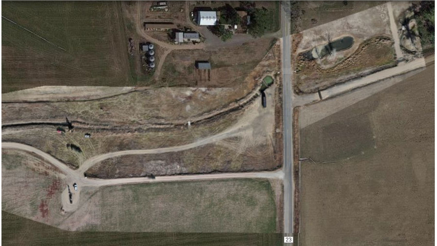
Photo 2. COGCC drone aerial imagery taken on November 11, 2021 documenting the current status of the remediation work and documenting the potential reclamation scope. This image is of the eastern to approximate central remediation extent.