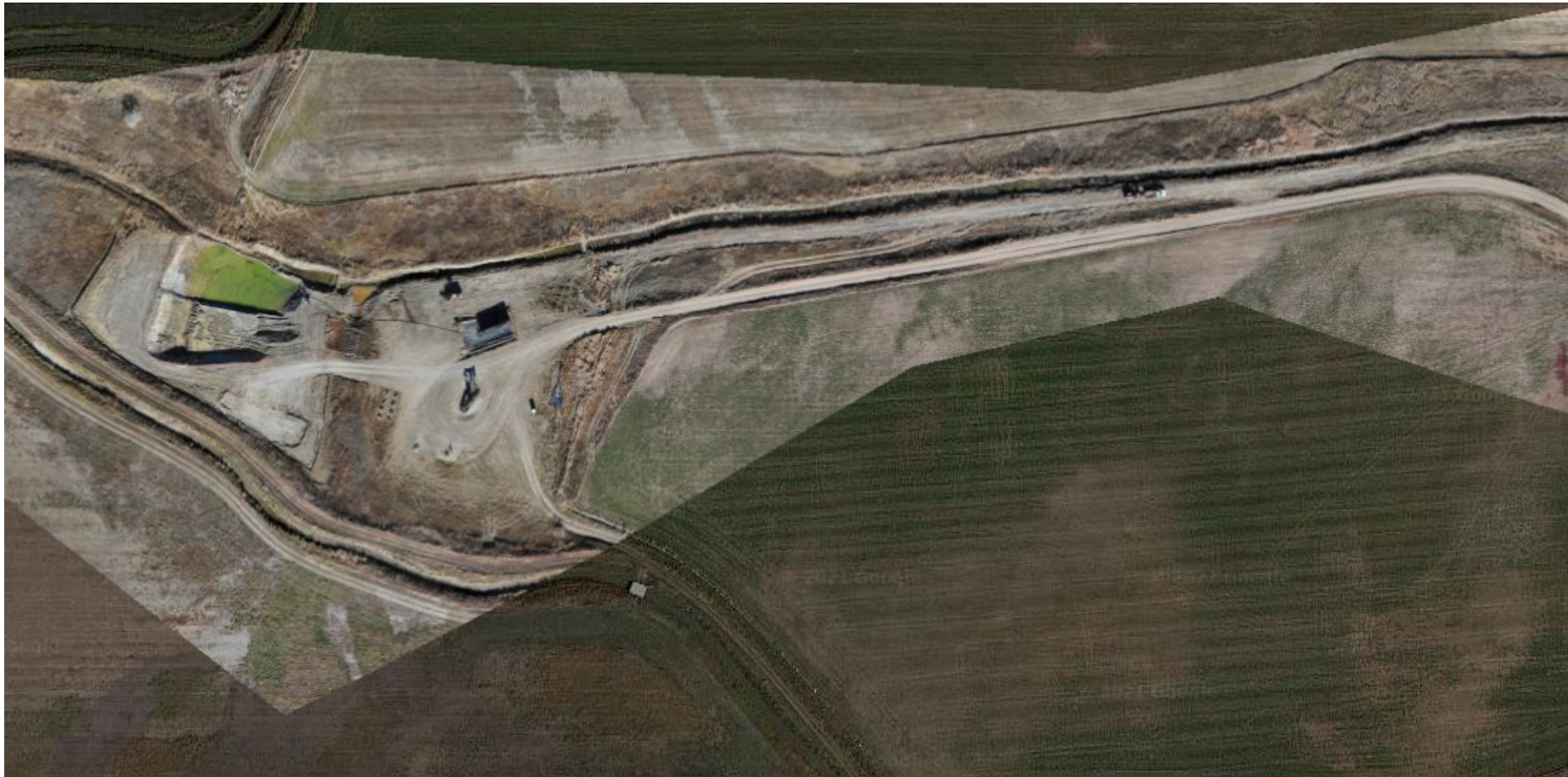
Photo 1. COGCC drone aerial imagery taken on November 11, 2021 documenting the current status of the remediation work and documenting the potential reclamation scope. This image is of the western to approximate central remediation extent.