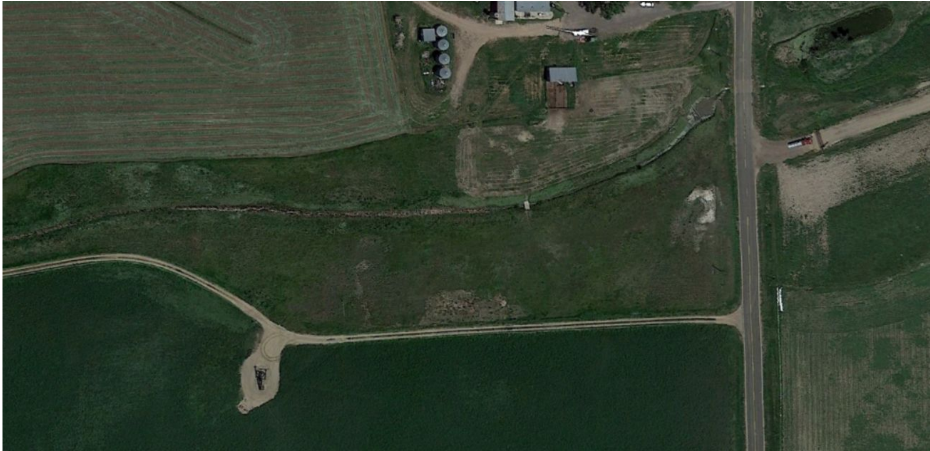
Photo 4. Google Earth aerial imagery from 6/10/2021 illustrates conditions prior to the flowline spill.