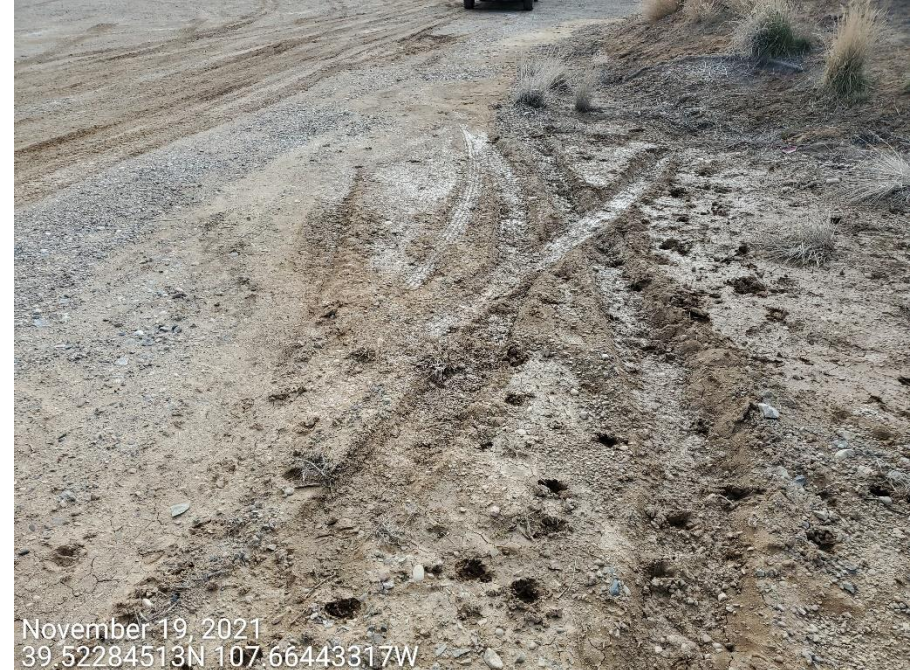
Photo 5: Photos taken from the production areas. Photos show example of stabilization/tracking issues that remain evident on the Location.