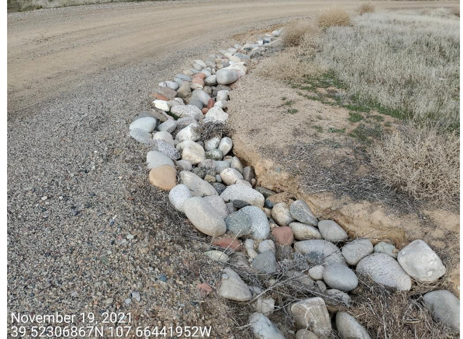
Photo 6: Photo shows the stormwater outlet on the northwest end of the Location. Control measures to manage stormwater runoff from the production area is inadequate; outlet improperly engineered and not maintained; runoff resulting in degradation at the control, and within ditches at access road.