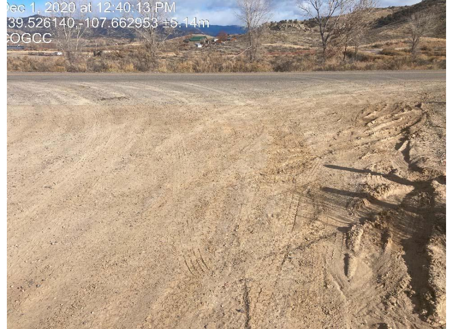
Photo 8: Photos taken from the access road entrance and County Road 331. Photo right shows off-site sediment transport due to vehicle tracking observed during the 12/1/2020 inspection. Photo left (dated 11/19/2021) shows stabilization and tracking issues have not been addressed, resulting in continued off-site sediment transport onto the county road.