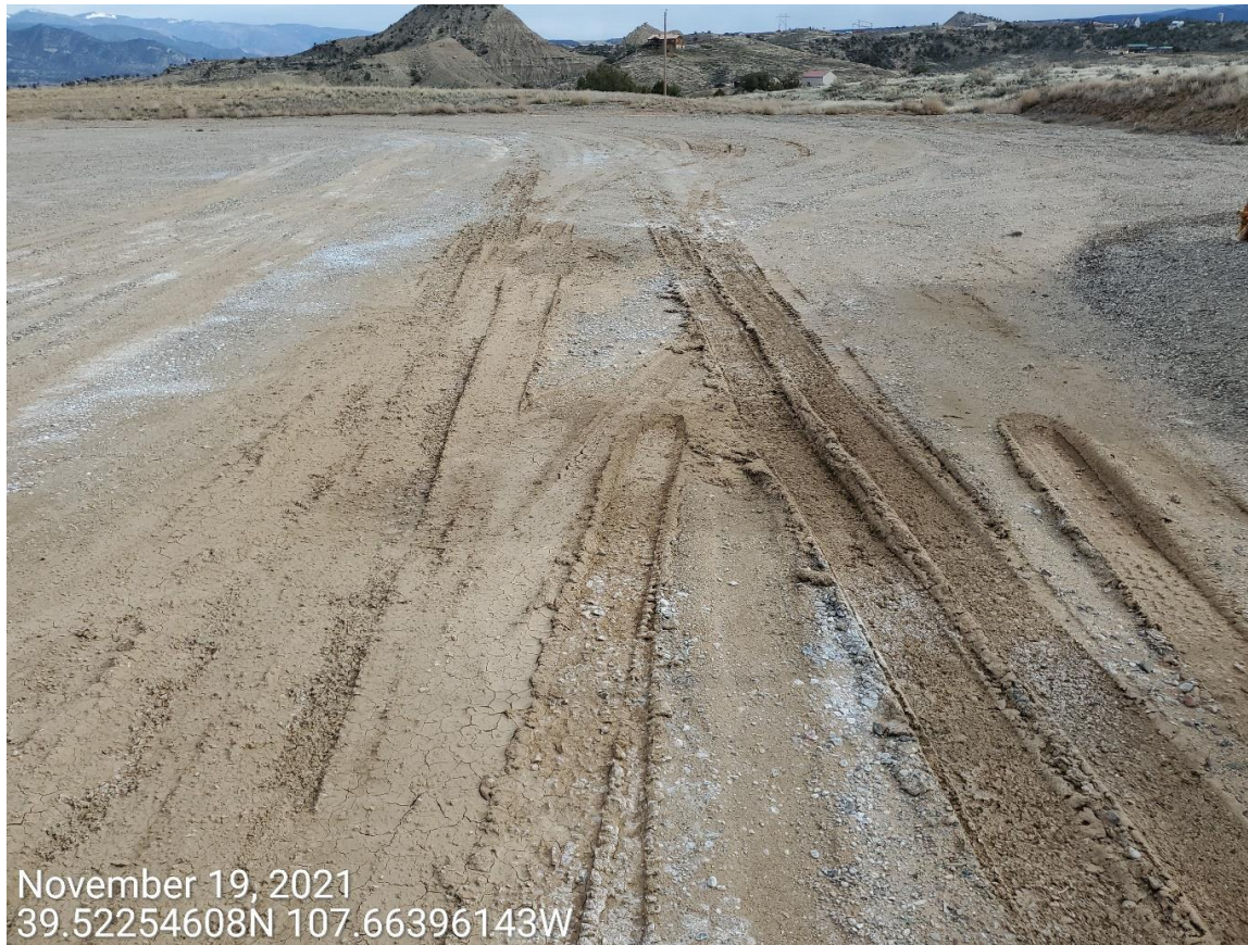
Photo 4.b: Continued from Photo 4. Photo left shows stabilization/tracking issues observed on the south end of the Location. Photos to the right taken from the same areas during the 12/1/2020 and 5/11/2021 inspections showing. Stabilization/tracking issues on the production areas have not been addressed.