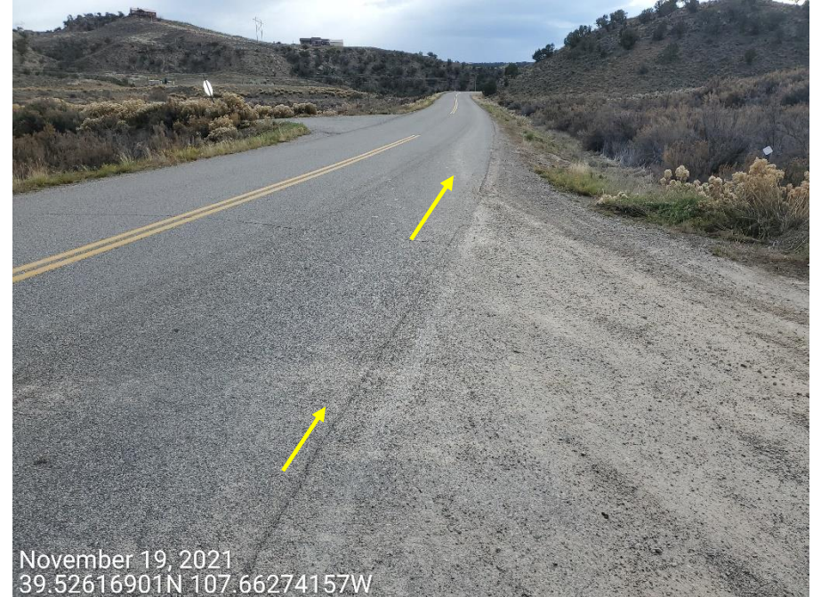
Photo 9: Continued from photo 8. Photo shows sediment transport onto the county road.