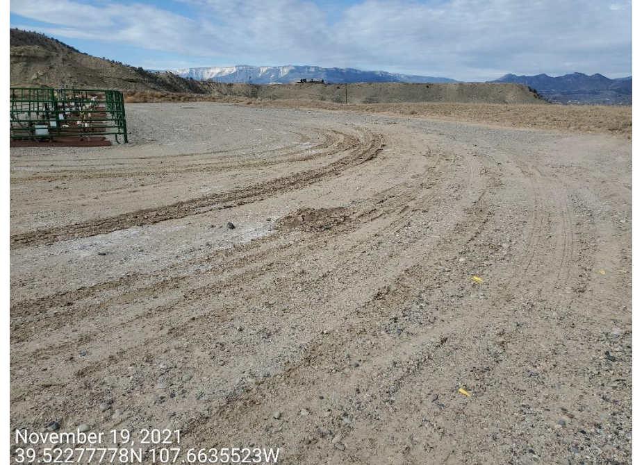
Photo 4: Photos taken from the production areas. Photos show example of stabilization/tracking issues that remain evident on the Location.