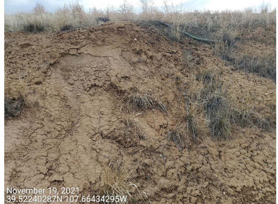
Photo 3: Photos provide examples showing control measures to address stabilization, erosion and degradation issues at the cut slopes of the Location remains missing or insufficient.