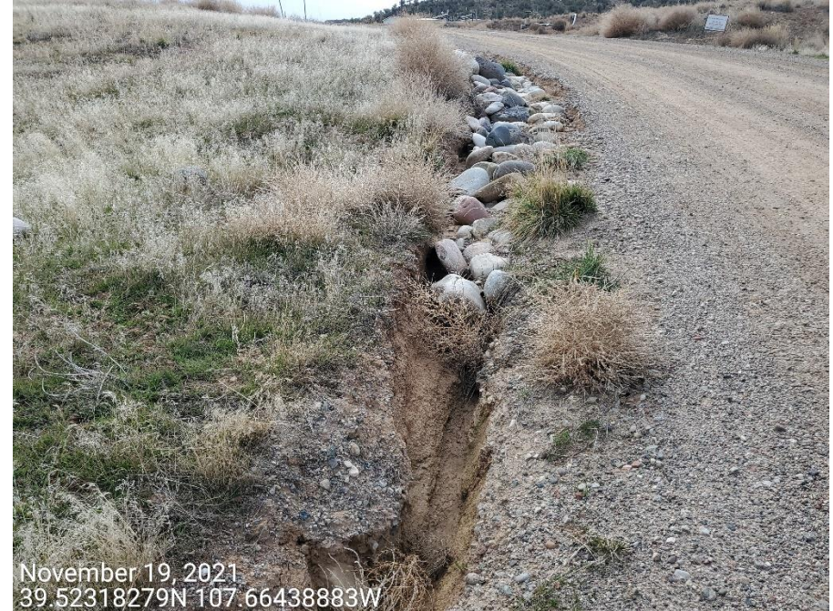
Photo 7: Continued from photo 6. Photo shows degradation to the stormwater outlet and ditch. Control has been constructed without geotextile lining, and with smooth stone rather than angular. This has resulted in stormwater accelerating around the rock material and scouring the sides, and channel, of the control measure.