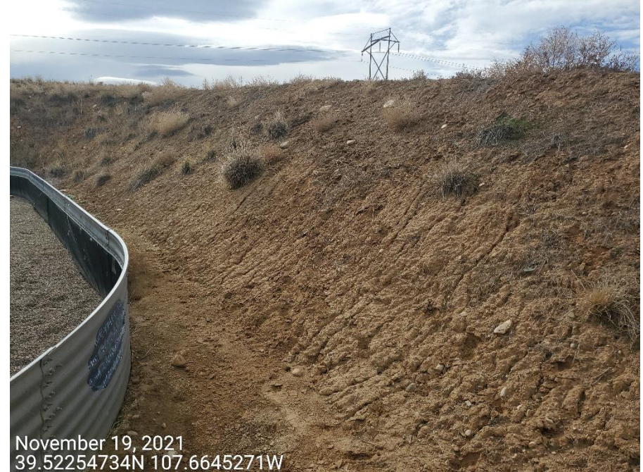
Photo 2: Photos provide examples showing control measures to address stabilization, erosion and degradation issues at the cut slopes of the Location remains missing or insufficient.