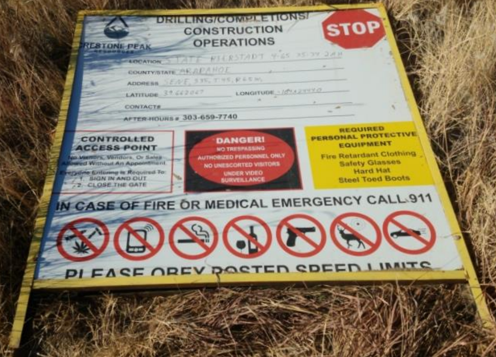
Colorado Oil and Gas Conservation Commission 39.66341, -104.6239, 5813.6ft, 249° 11/15/2021 09:12:58 AM