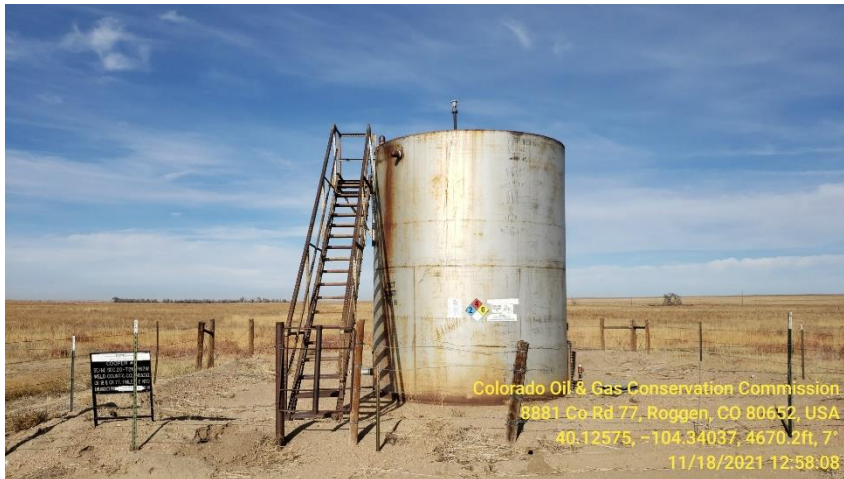
Photo 3 TB