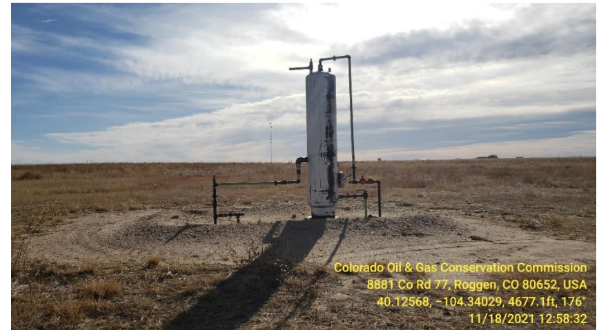
Photo 4 Vertical Heated Sep.