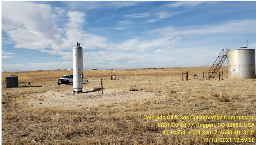
Photo 7 weeds have been cut around location