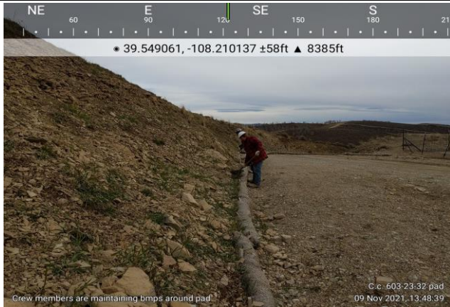
Maintaining Existing Wattle Installations on the Cascade Creek 603-23-32 Pad