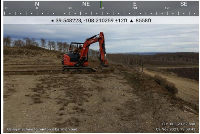
Installing Earthen Berm on the Cascade Creek 603-23-32 Pad