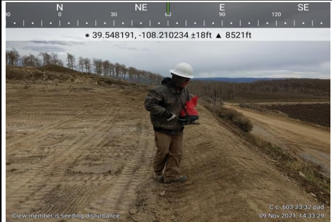
Broadcast Seeding Disturbances on the Cascade Creek 603-23-32 Pad