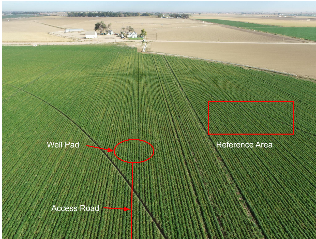
Photo 2. Overview photo of the well pad, access road and reference area using a drone. The photo shows that the well pad appears consistent with the reference area.