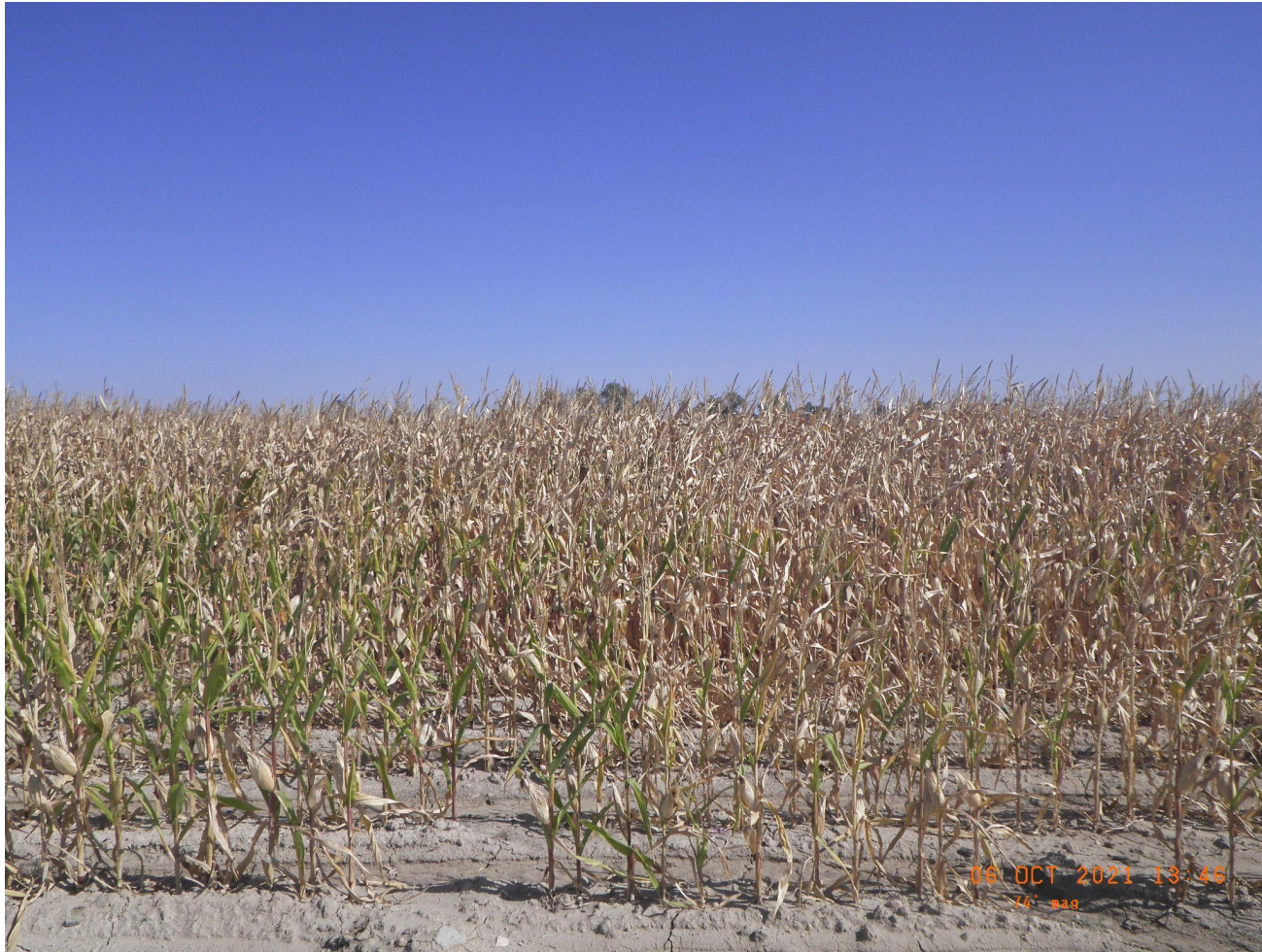
Photo 3. Ground photo taken from the western edge of the field looking east towards the well pad.