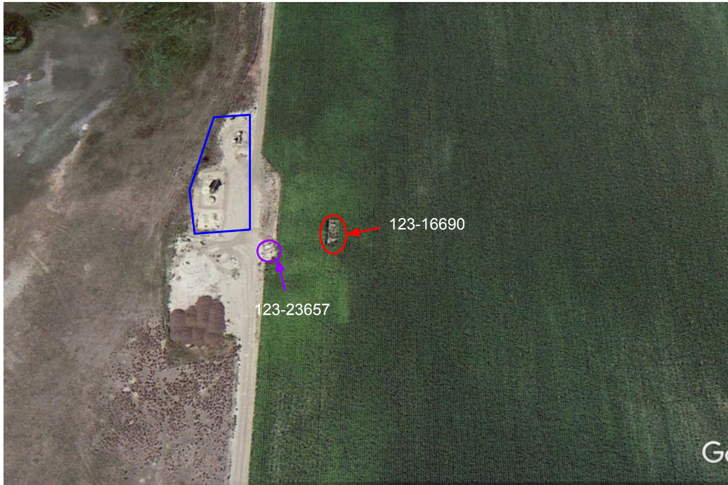
Photo 1. 2012 aerial imagery of the well pad (north is up). The tank battery highlighted in blue will be associated with the temporarily abandoned well API # 123-23657 highlighted in purple.