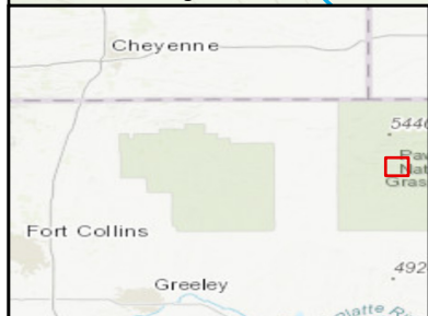
Figure 3A. Peanut Fed 3403 - Hydrology Map