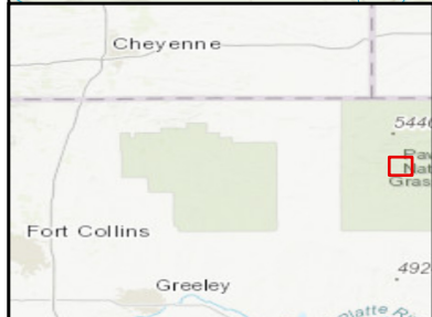
Figure 3B. Peanut Fed 3403 - Hydrology Map