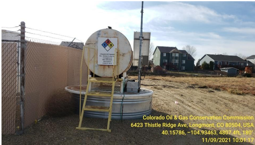
Photo 5 Methanol tank