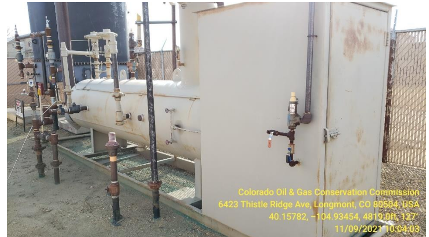
Photo 6 Horiz. Heated Sep.