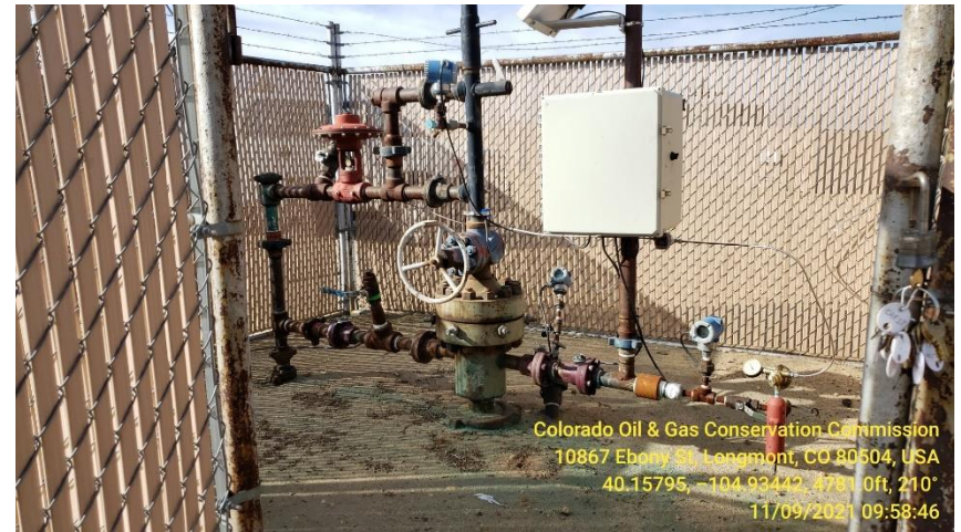
Photo 1 WH sign