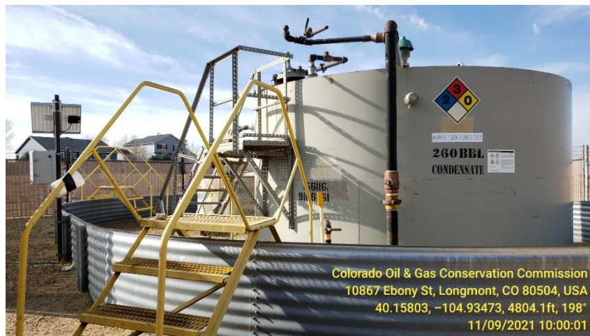
Photo 3 TB sign