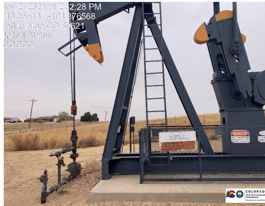
Pic 4 Wellhead/pumpjack

Nov 2, 2021 at 2:32:28 PM 40.065137,-104.876568 Fort Lupton CO 80621 United States COGCC