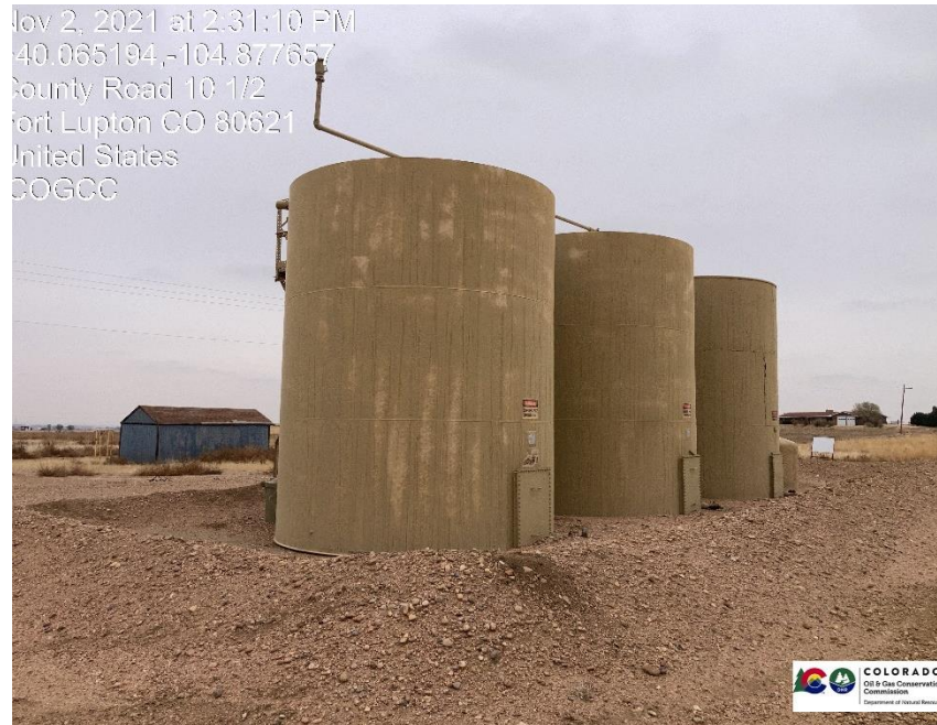
Pic 1 Tanks