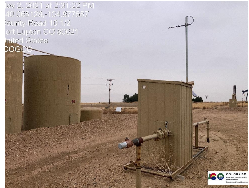
Pic 2 Gas meter run