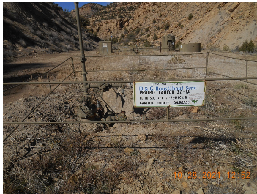
Wellhead with fence and sign