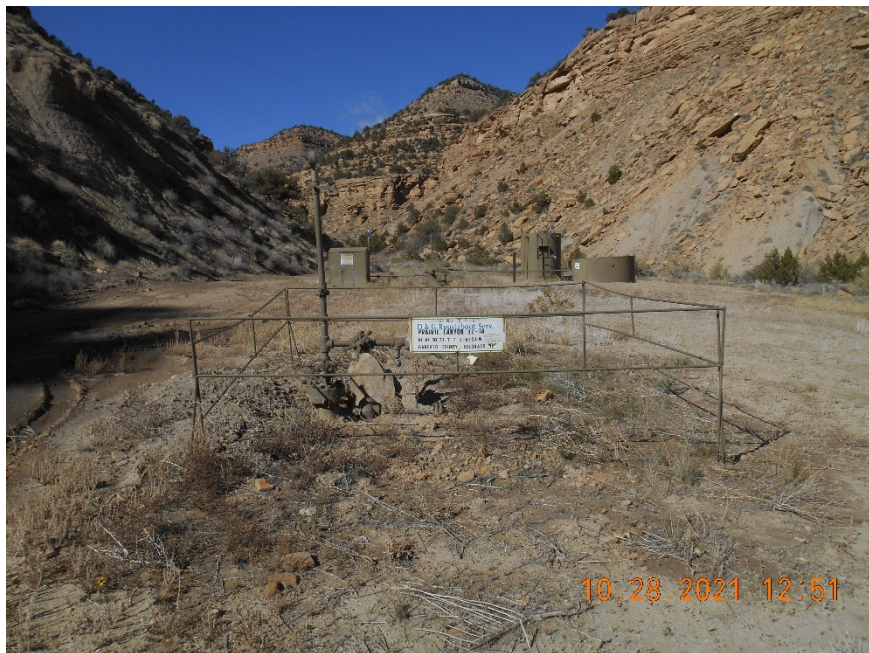
Location overview looking NW.