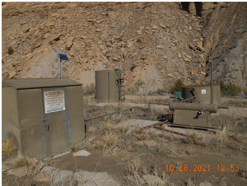
Meter housing, Produced Water tanks(2) and Separator.