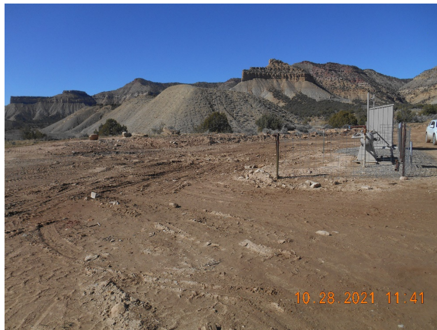
Reclaimed pit area