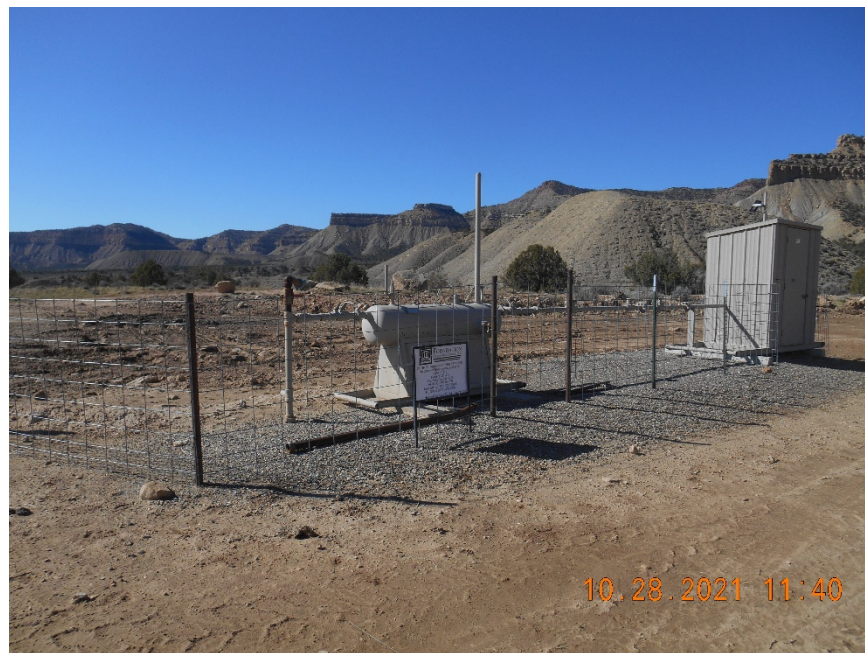
Separator, meter housing