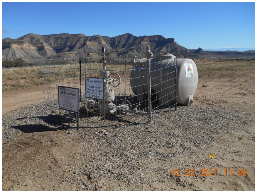
Wellhead with fence and signs