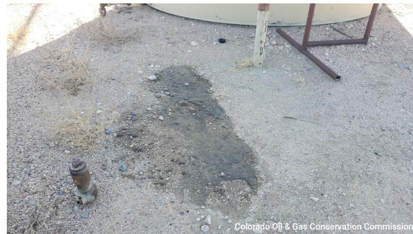
Photo 16 stained soil by Crude tank