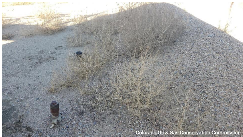
Photo 13 dead weeds inside TB berm