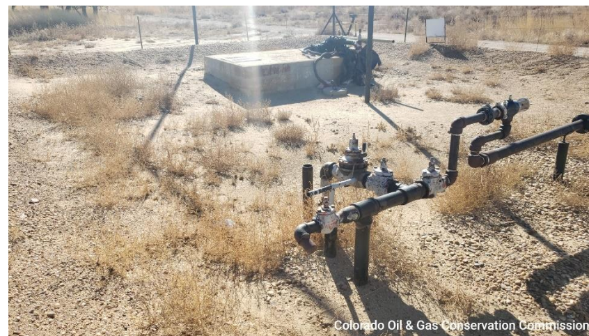
Photo 14 dead weeds by Gas Meter Run inside TB berm