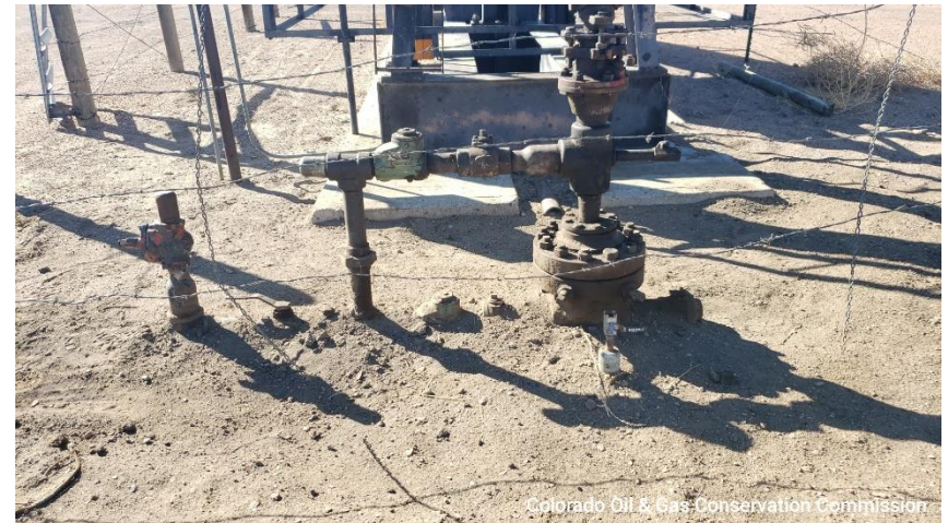
Photo 2 Stained soil and weeds have been removed from around WH