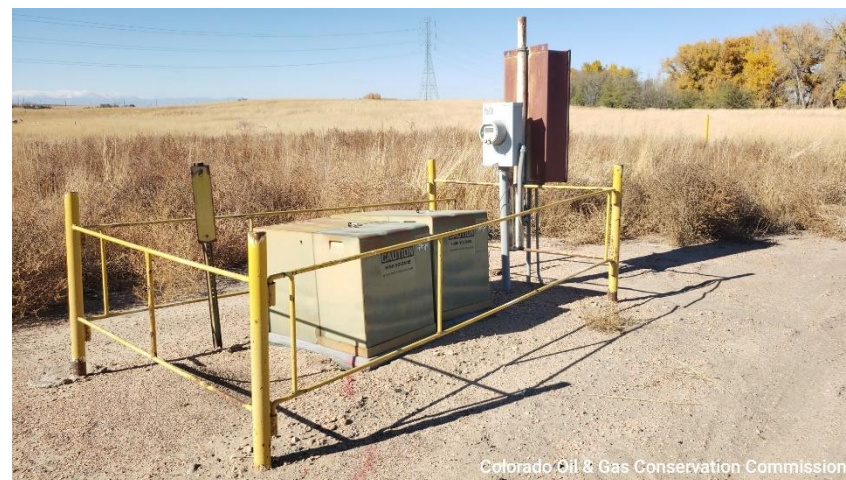
Photo 4 Ancillary equipment