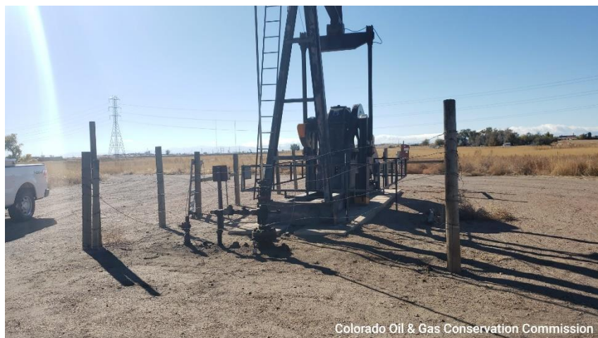
Photo 3 Pump Jack