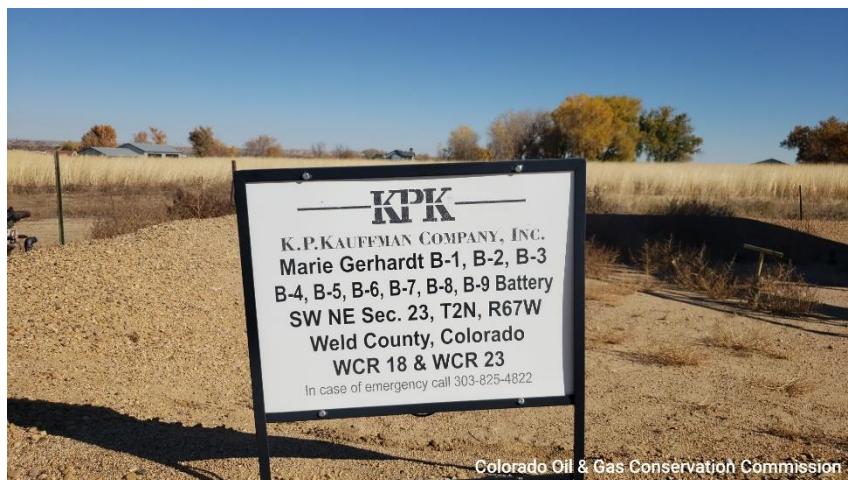
Photo 5 TB sign