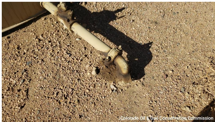
Photo 15 stained soil by Crude tank flow line