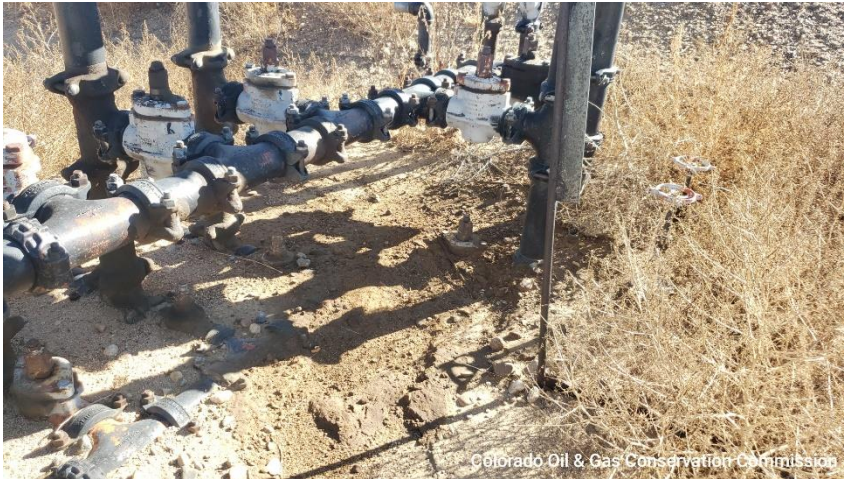
Photo 11 dead weeds and stained soil by flow line manifold