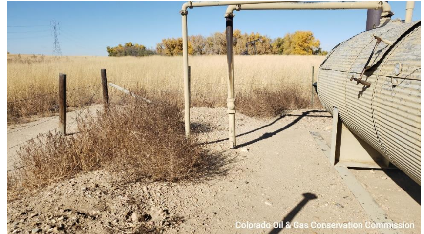
Photo 8 dead weeds inside fencing by Horiz. Heated Sep.