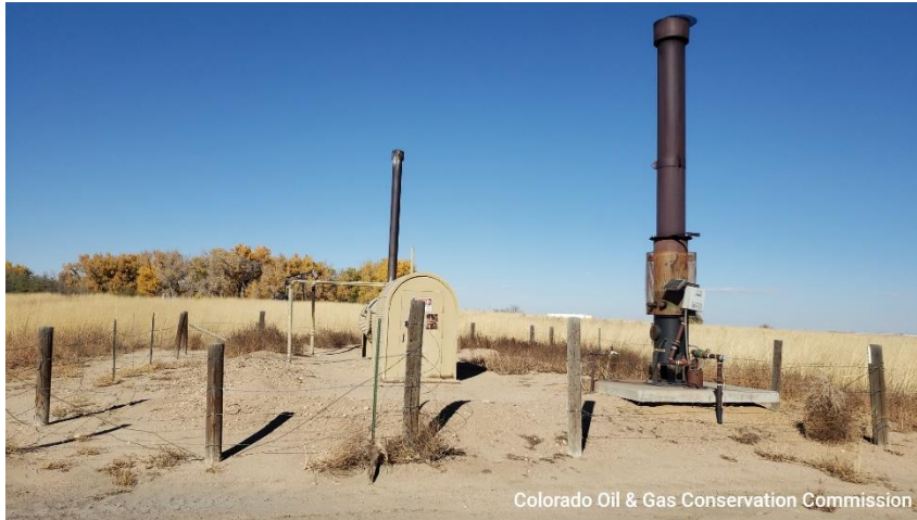
Photo 7 ECD and Horiz. Heated Sep. dead weeds inside fencing