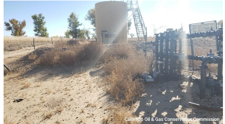
Photo 12 dead weeds by flow line manifold and on TB berm