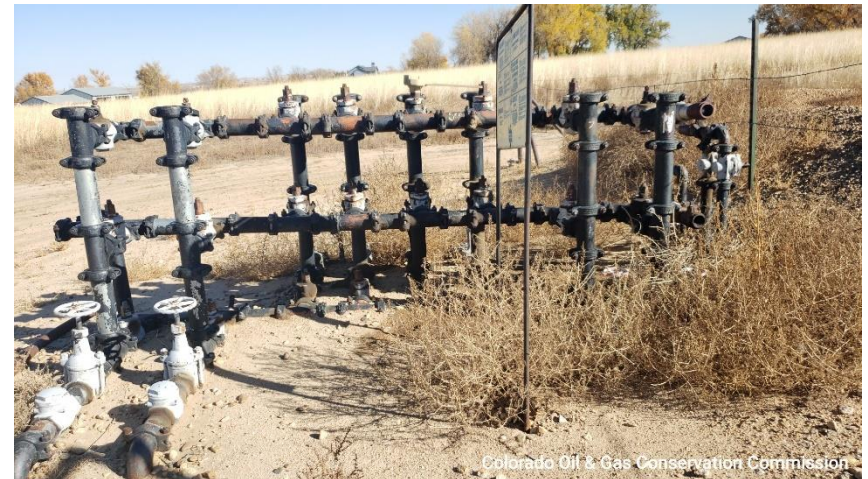
Photo 10 dead weeds by flow line manifold.