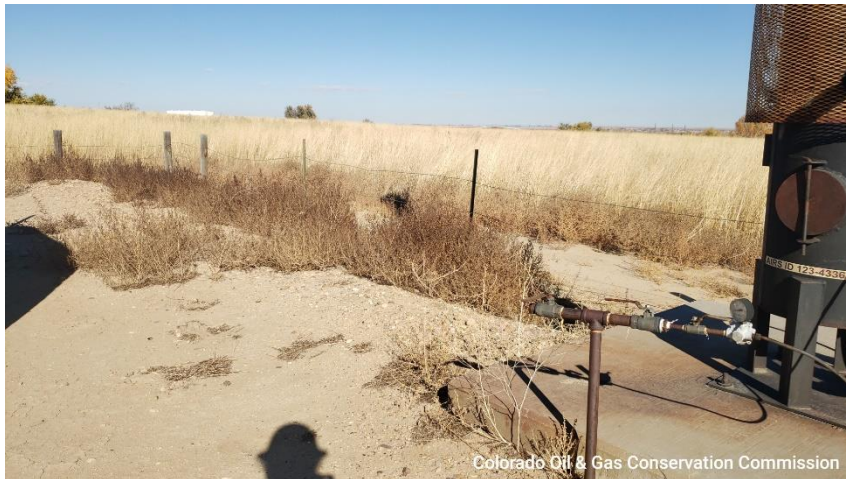
Photo 9 dead weeds inside fencing by ECD