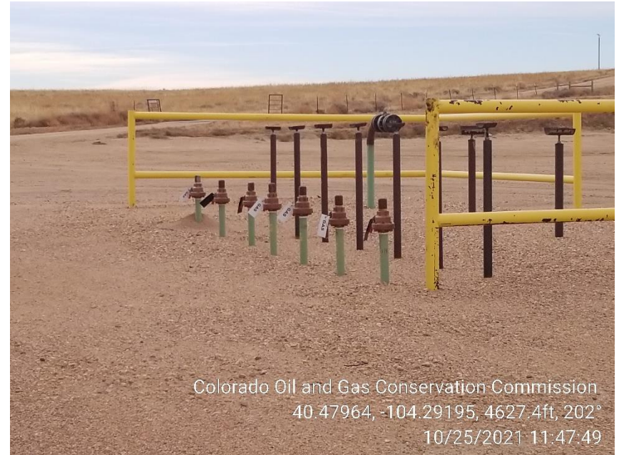
Colorado Oil and Gas Conservation Commission 40.47964, -104.29195, 4627.4ft, 202° 10/25/2021 11:47:49