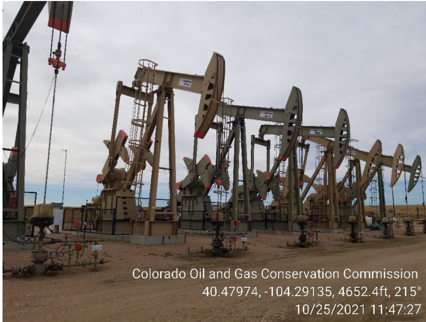
Colorado Oil and Gas Conservation Commission 40.47974, -104.29135, 4652.4ft, 215° 10/25/2021 11:47:27