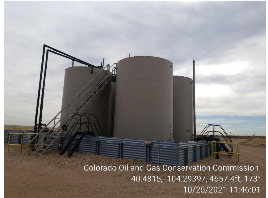
Colorado Oil and Gas Conservation Commission 40.4815, -104.29397, 4657.4ft, 173° 10/25/2021 11:46:01