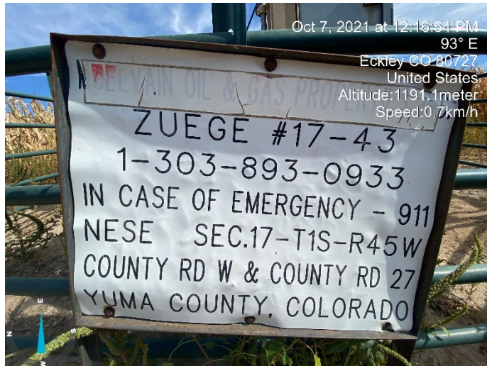
1. Lease sign does not display current operator