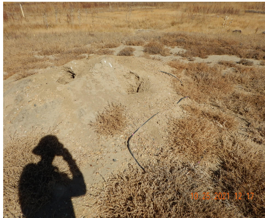
Photo 3. Photo taken from the meter house location, facing East. Photo illustrates a gravel pile and some wire debris.