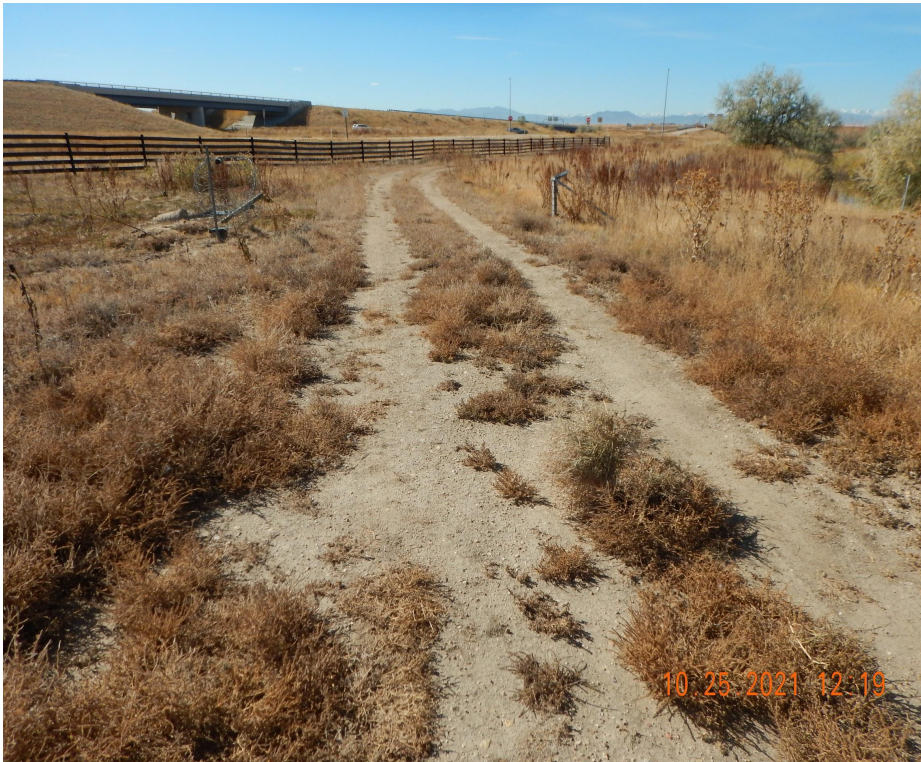
Photo 4. Photo taken from the eastern well location access road, facing West. See comments under Photo 1.