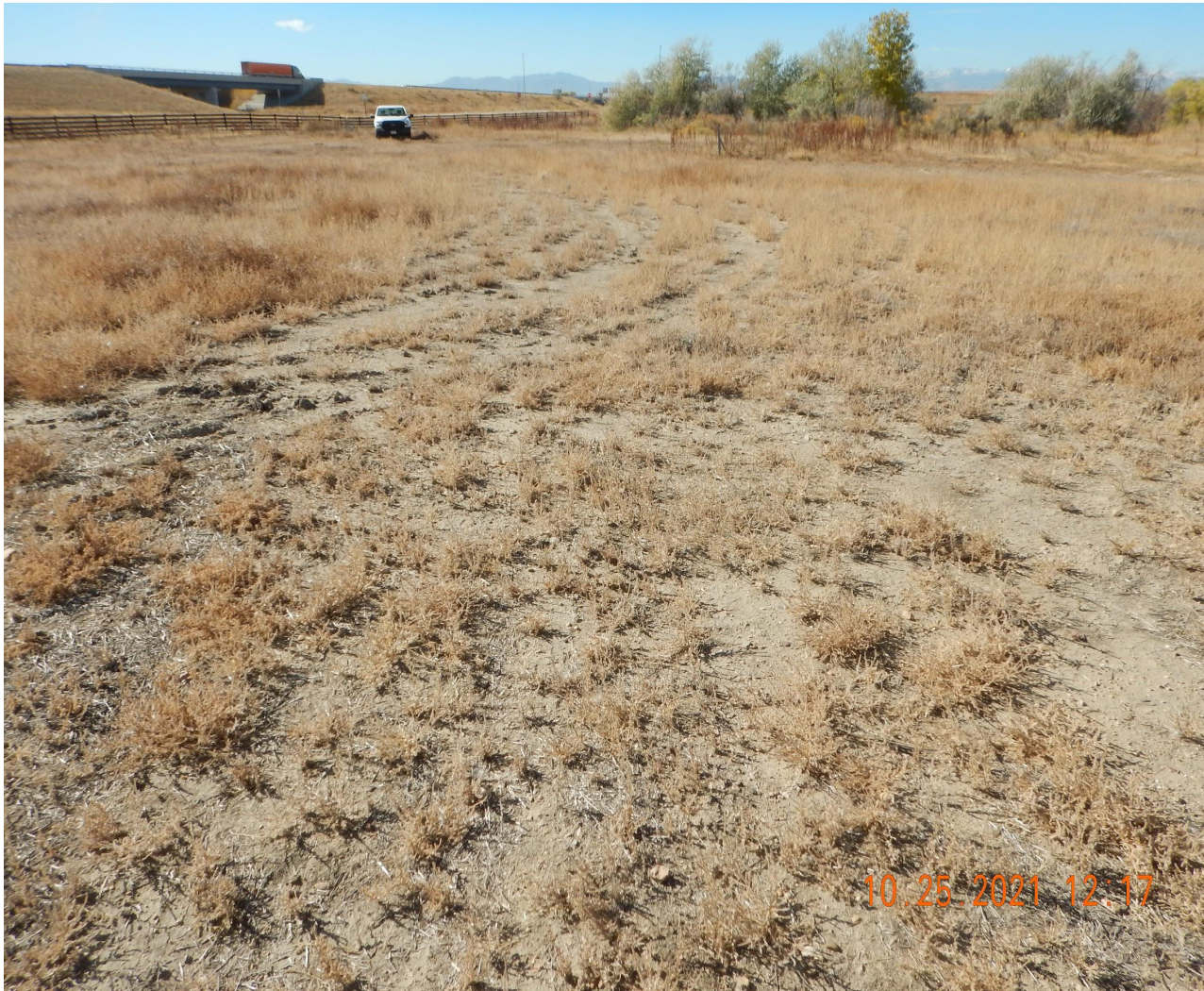
Photo 1. Photo taken from the eastern location, facing West. Photo illustrates Operator has failed to complete final reclamation activities.