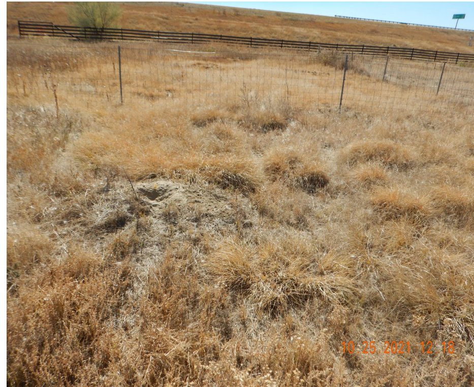
Photo 5. Reference photo taken east of location, facing South. See comments under Photo 1.