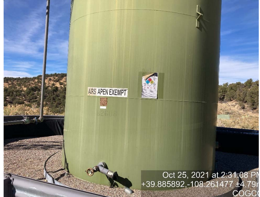
location/ labeling is still XTO