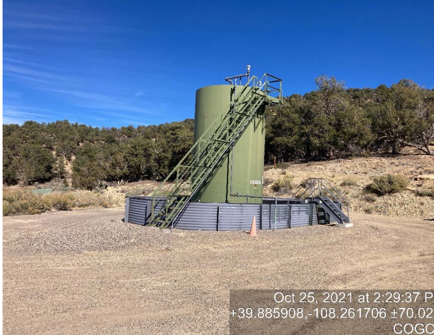
Location/Lack of battery signage