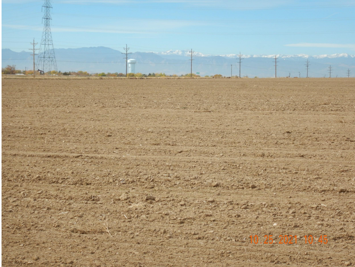
Photo 9. Photo taken from the well location, facing West. Photo confirms that all equipment has been removed.