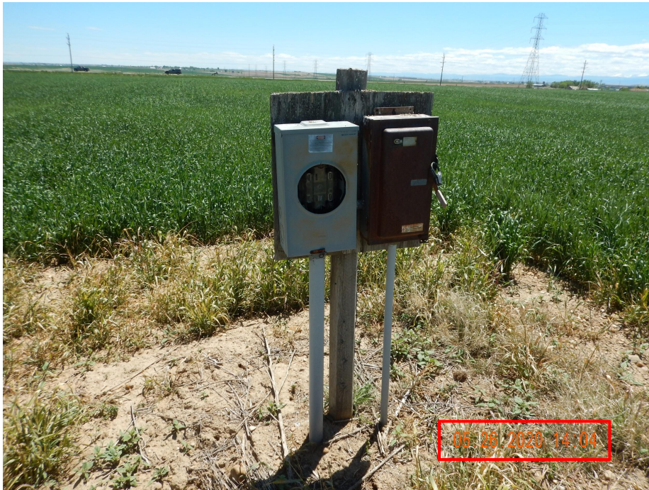
Photo 1. Photo taken from the well location on 5/26/2021, facing South. Photo illustrates the Operator has failed to remove all equipment.