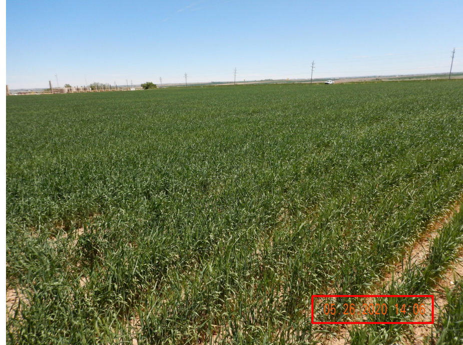
Photo 4. Photo taken from the well location on 5/26/2021, facing South. Photo illustrates the access road appears reflective of reference crop areas.