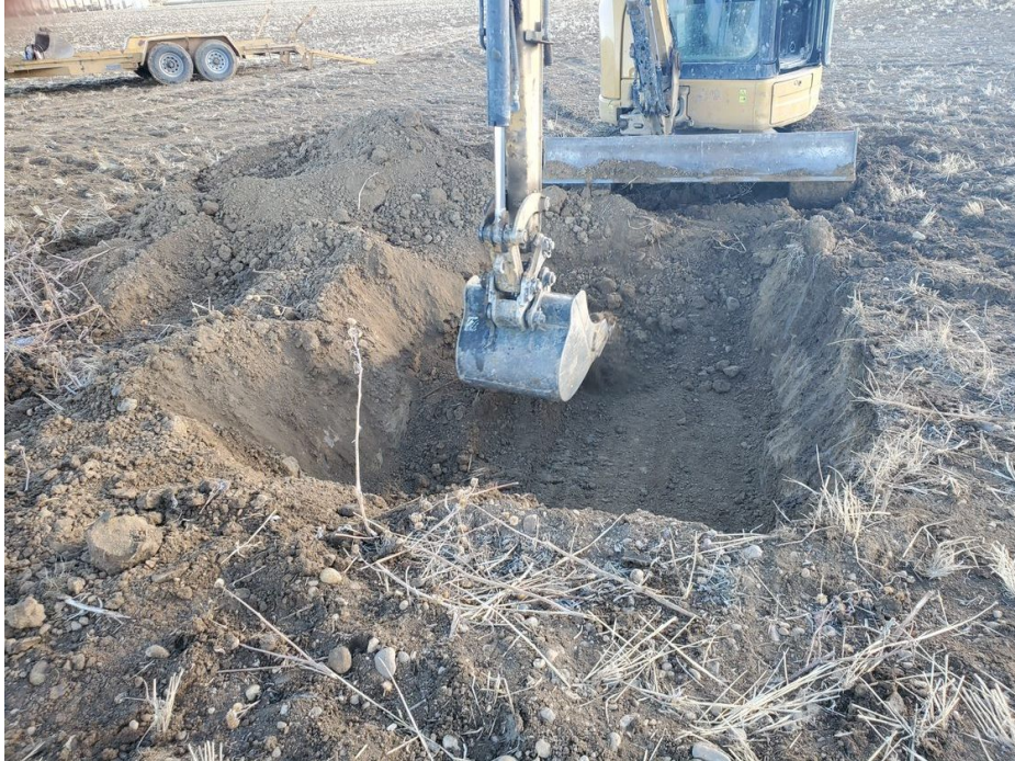
Photo 7. Photo taken from the removal work conducted on 12/22/2020.