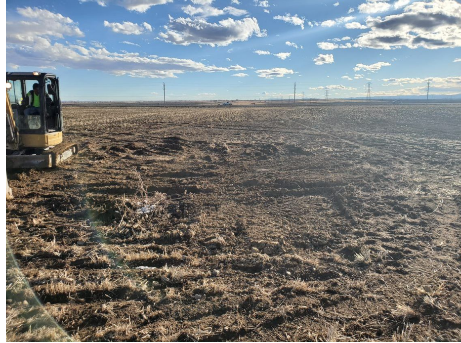
Photo 8. Photo taken from the removal work conducted on 12/22/2020.