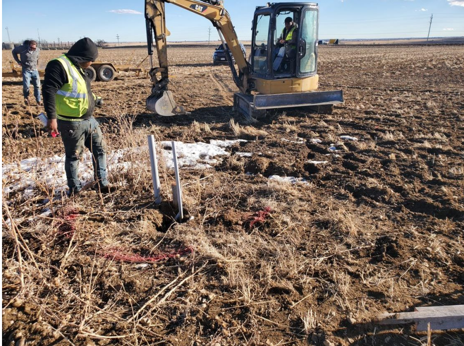
Photo 5. Photo taken from the removal work conducted on 12/22/2020.