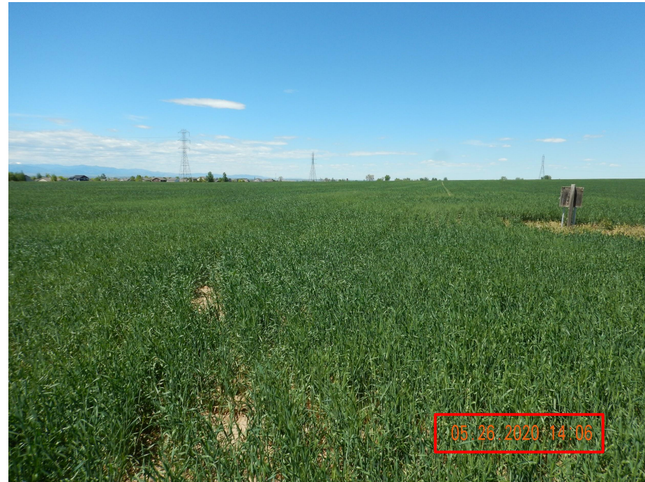
Photo 2. Photo taken from the well location on 5/26/2021, facing Northwest. Photo illustrates other areas surrounding the well location appear to meet Rule 1004 vegetative standards.