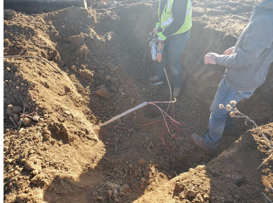
Photo 6. Photo taken from the removal work conducted on 12/22/2020.