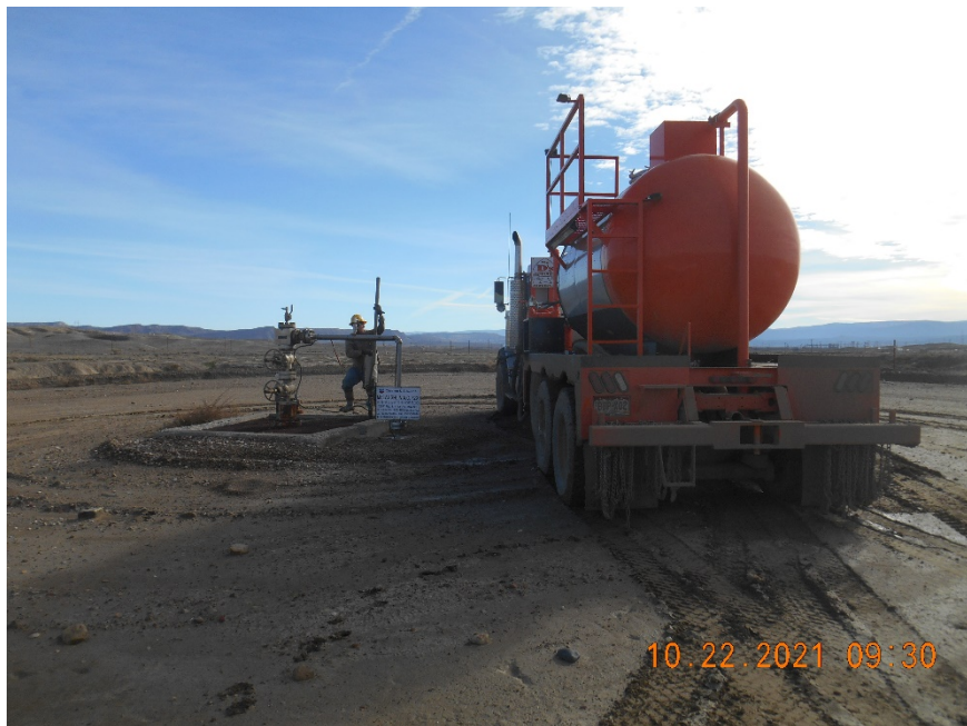
Injection wellhead during MIT.