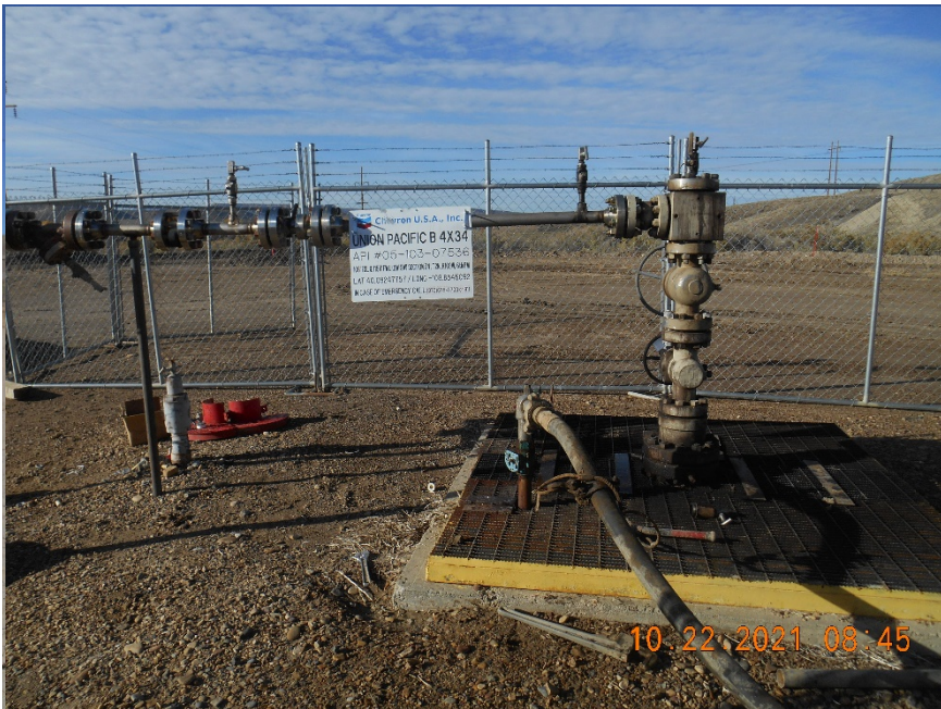
Injection wellhead during MIT.