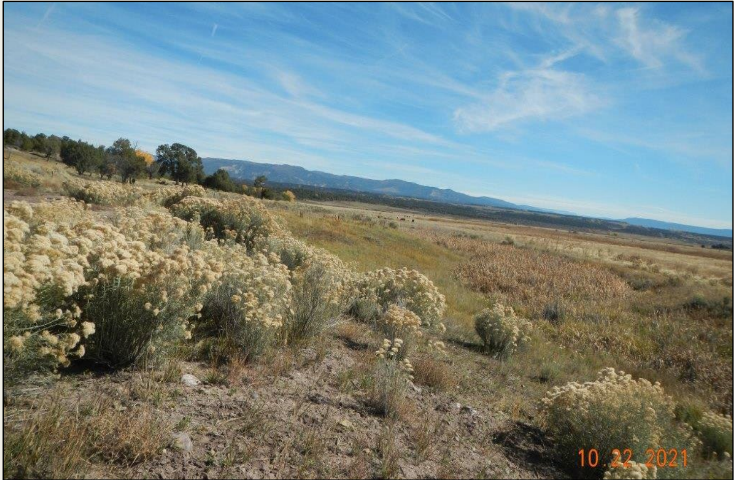
Photo 2. View of the southern fill slope from the southwestern corner facing eastward. Revegetation is progressing with western wheatgrass, ssand dropseed, and rubber rabbitbrush.