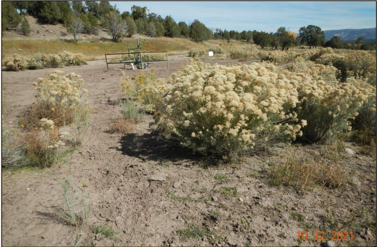
Photo 1. View of the project area from the southwestern corner facing center.