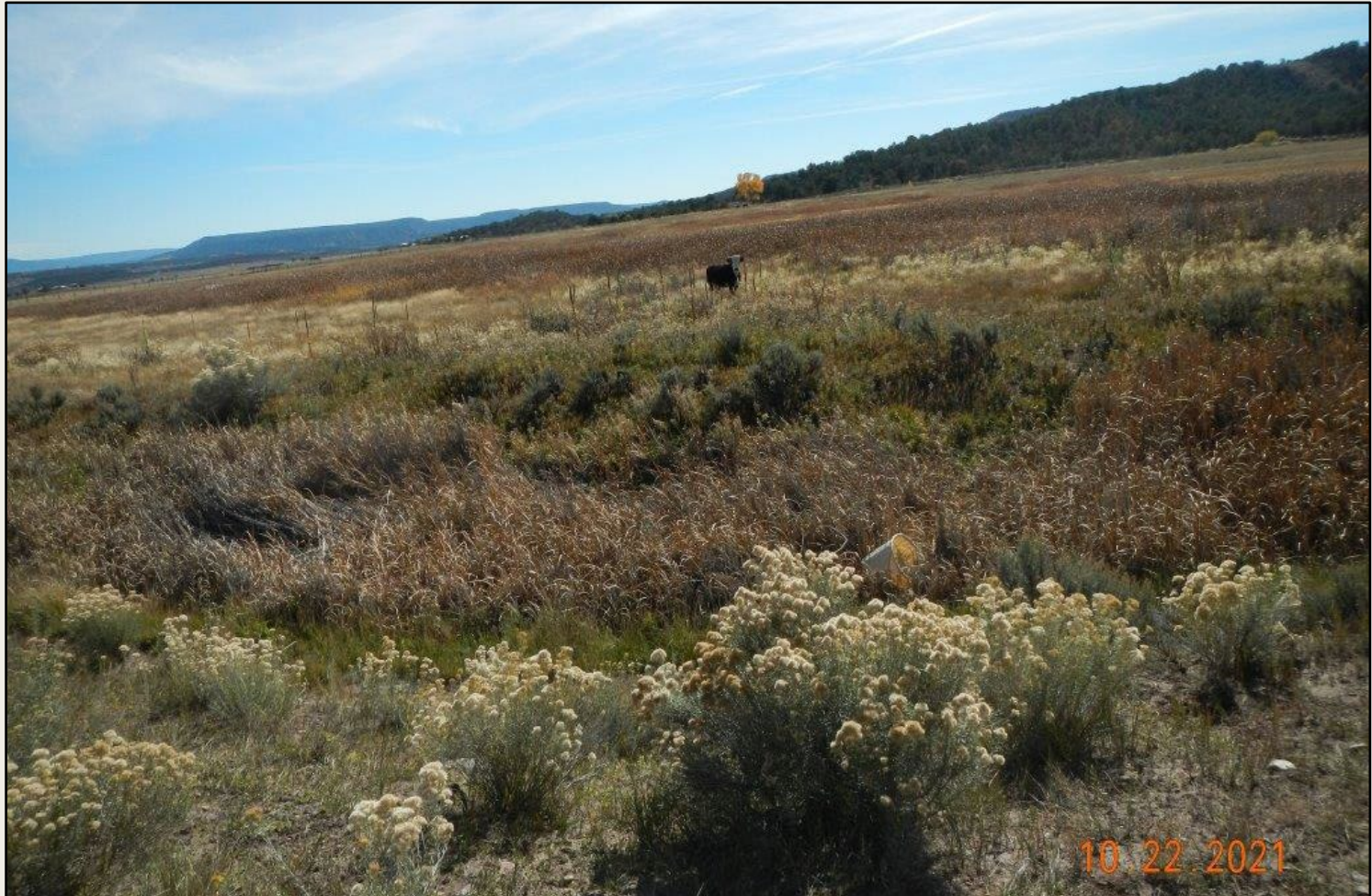
Photo 4. View of the reference area comprised of irrigated grass field with grasses such as smooth brome, orchard grass, and foxtail barley, as well as scattered sagebrush and wetland vegetation such as cattails.