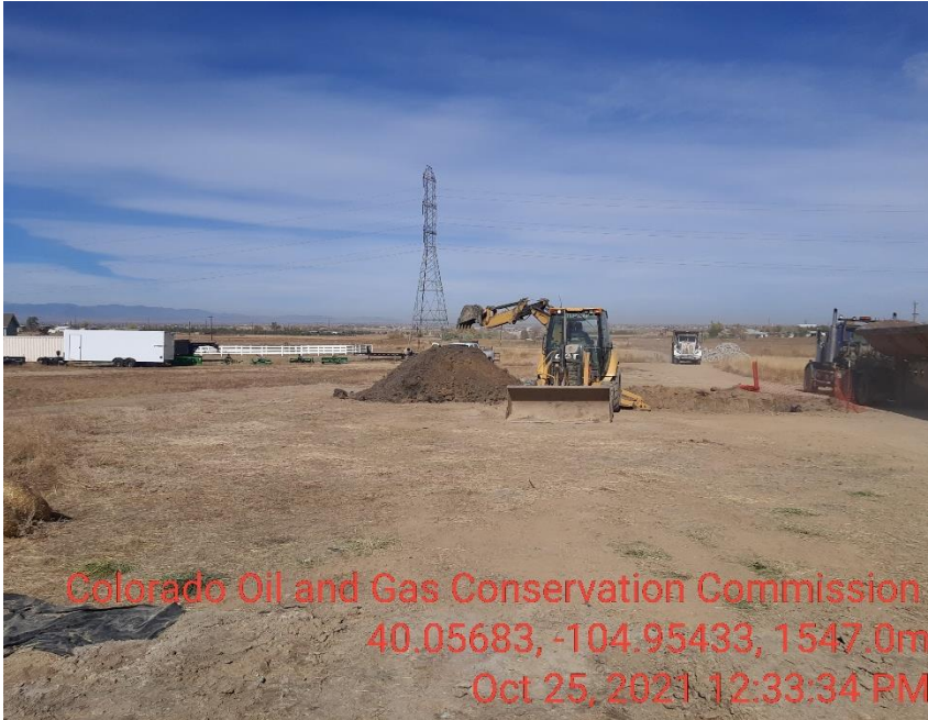
Photo 1A Operator digging contaminated material and placing on non protected soil.