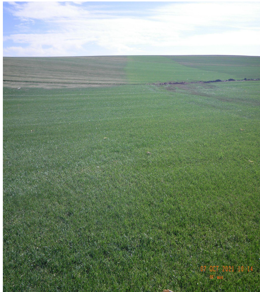
Photo 3. Photos taken from the middle of the well pad. Left photo facing north and right photo facing east.