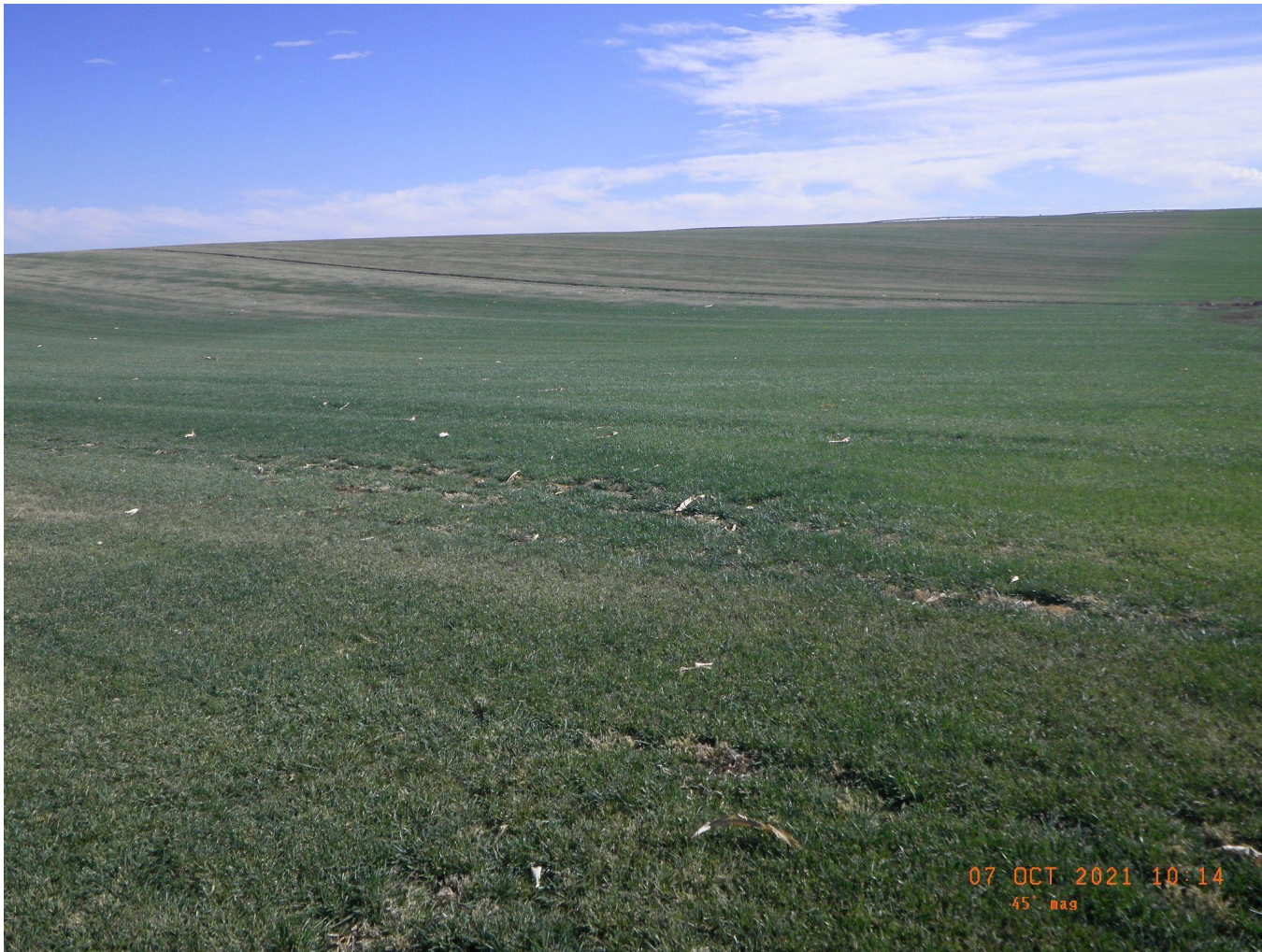
Photo 2. Overview photo of the well pad taken at ground level from west of the well pad. Note: well pad lies within a sod grass field.