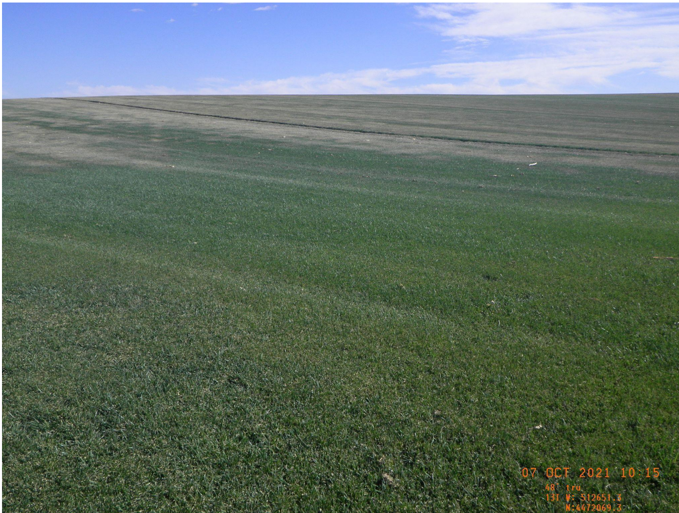
Photo 5. Reference photo northeast of the well pad.