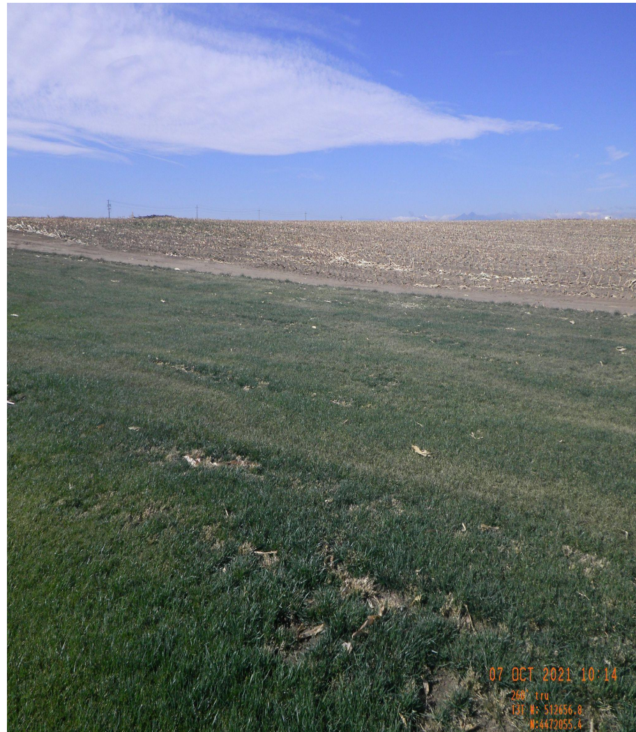
Photo 4. Photos taken from the middle of the tank battery. Left photo facing south and right photo facing west. Photos show that the well pad appears consistent with the reference area (see photo 5).